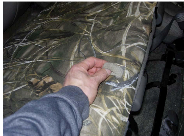
Step 20. Driver & Passenger Bottom/DB&PB: Slide the cover on with the seat release tab in back.