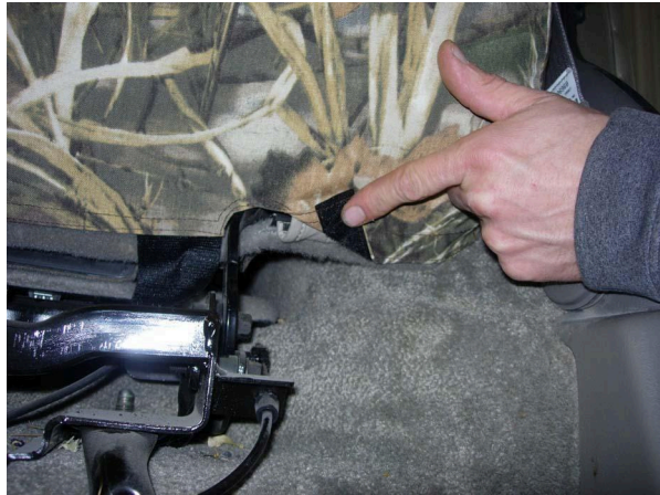
Step 17. Driver Top/DT: Pull the front outside edge down and press the hook Velcro™ to the carpet.