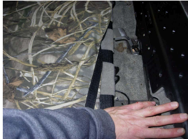
Step 18. Driver Top/DT: Connect the rear Velcro™ same as Step 12.