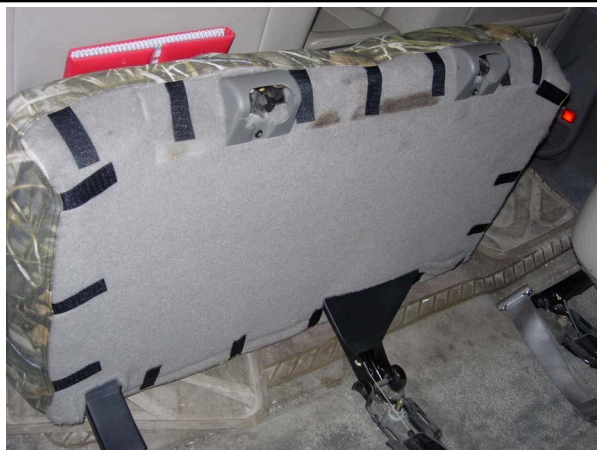
Step 21. Driver & Passenger Bottom/DB&PB: Line up the seams as in Steps 3&8, and press the hook Velcro™ to the carpet under the seat as shown.