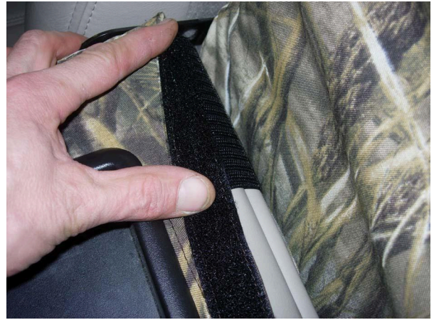
Step 24. Armrest/A: Mate the Velcro™ at the back of the armrest.