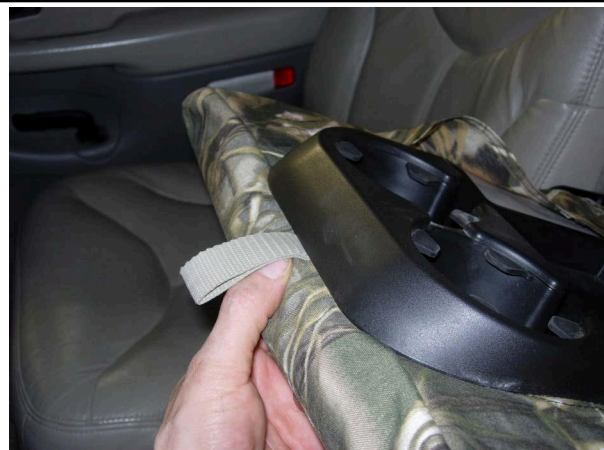
Step 22. Armrest/A: Tuck the cover under the plastic as shown.