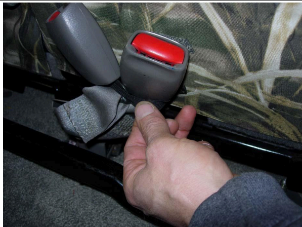
Step 19. Driver Top/DT: Slide the seat belts through the elastic.