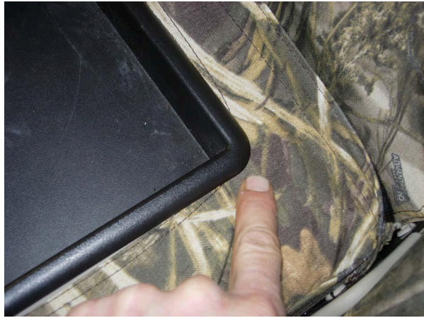
Step 23. Armrest/A: Tuck the fabric under the plastic tray.