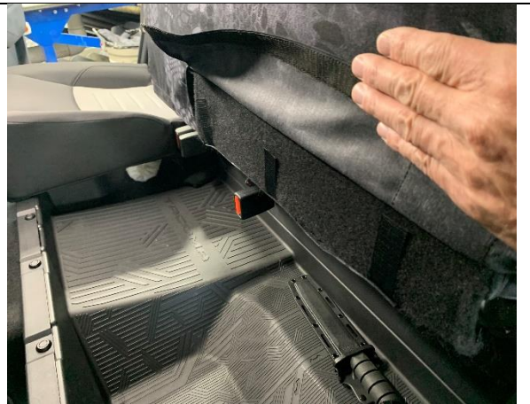
Step 18. Driver&Passenger Bottom/DB&PB: Like Step 13 & 14, tuck the front edge, and flip the seats up. Press the 1"x3" Hook Velcro™ onto the fuzzy carpet as shown.