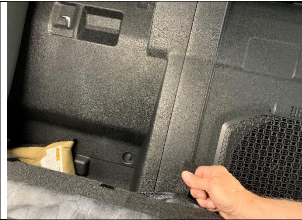
Step 13. Driver & Passenger Top/DT&PT: Tuck in the front edge and fold the backrests forward. Pull the 1"x3" Hook Velcro™ through as shown.