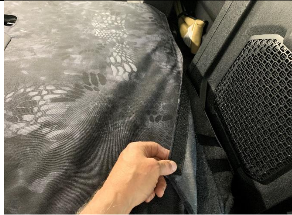
Step 15. Driver & Passenger Top/DT&PT: Lastly, pull the cover down and press the Hook Velcro™ to the fuzzy carpet behind the seat. Re-connect the center seatbelt from Step 1.