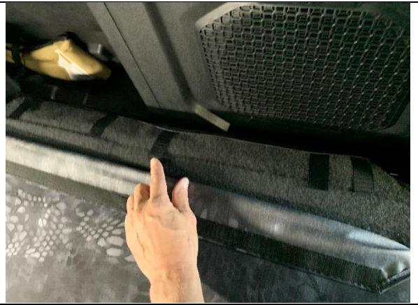
Step 14. Driver & Passenger Top/DT&PT: Press the Hook Velcro™ to the carpet fuzz behind the seat as shown.