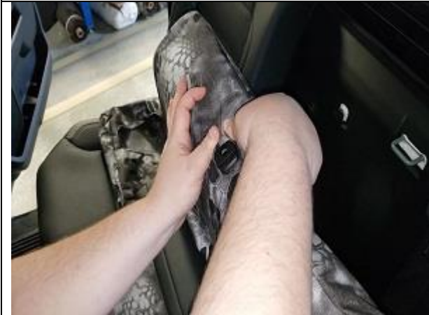
Step 13. Driver Top/DT: Tuck the fabric under the middle headrest plastic by starting on the push button side first.