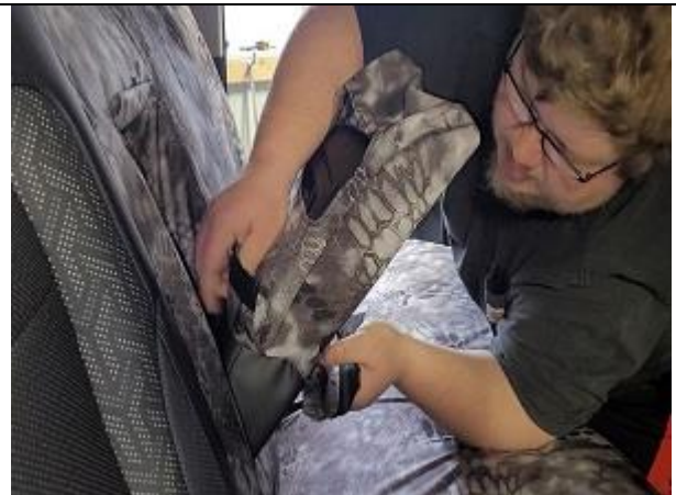
Step 20. Armrest/A: With the armrest partway folded down, slide the cover on with the opening for the drink holders to the top.