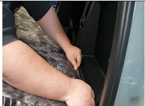
Step 16. Driver & Passenger Top/DT&PT: Lastly, pull the back edge down and press the Velcro™ to the fuzzy carpet as shown.