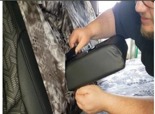
Step 18. Driver Top/DT: Fold the armrest down and connect the Velcro™ behind the armrest.