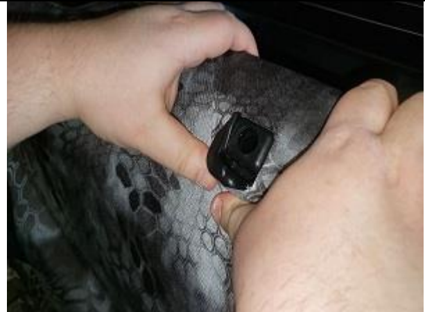
Step 12. Driver & Passenger Top/DT&PT: Tuck the fabric under the plastic for the headrests as shown.