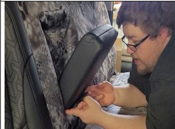
Step 19. Driver Top/DT: After the Velcro™ is connected, lift the arm up and check your corners. Make sure the bottom corners of the armrest cavity are clear of the armrest.