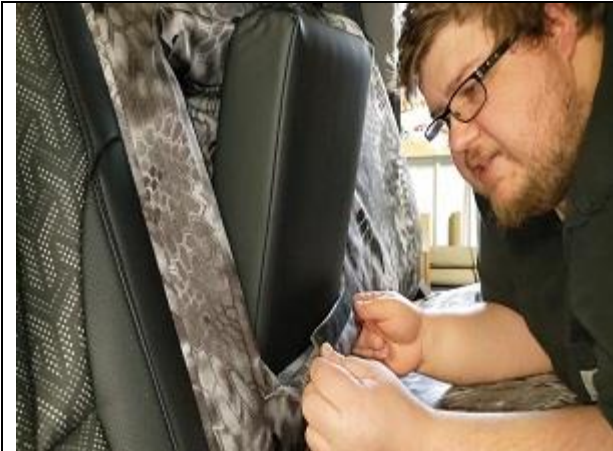
Step 17. Driver Top/DT: Tuck the fabric under the armrest.