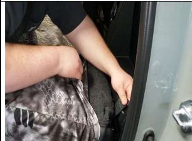
Step 15. Driver & Passenger Top/DT&PT: Working from one side to the other, using the same smoothing method as Step 6, press the hook Velcro™ to the fuzzy carpet behind the seat.