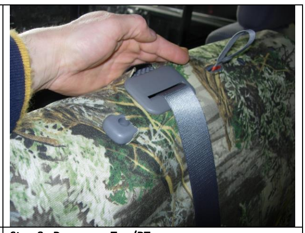
Step 8. Passenger Top/PT: Carefully open the seat cover, slide it behind the center seatbelt with the extending hook Velcro™ to the front and wrap it around to the back of the seat. Tuck the seat cover under the plastic for the headrests and center seatbelt. Pull the left and right sides of the seat cover down into position and feed the release strap through the provided opening.