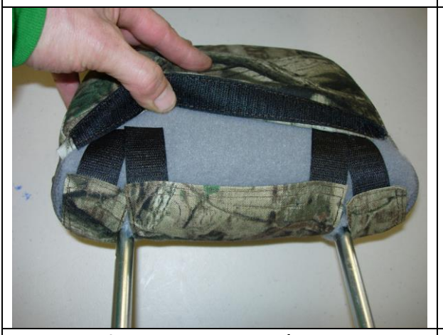
Step 13. Left and Right Headrests/H: Pull the Velcro from the front side around to the back and connect it to the carpet on the back of the headrest, then press the back edge down.