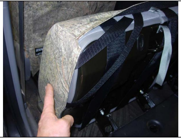
Step 7. Driver and Passenger Bottoms/DB&PB: Route the side hook Velcro™ at an angle as shown and press it onto the carpet on the back edge of the seat. Route the long front Velcro™ under the seat and connect it to the carpet on the back edge of the seat. Now, pull the back edge of the cover back and press the hook Velcro™ sewn inside to the carpet on the back of the seat bottom. Feed the release strap through the provided elastic.