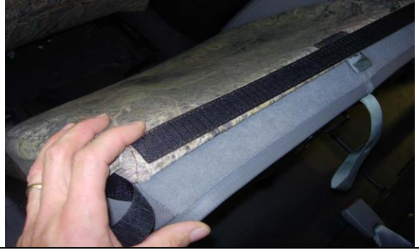
Step 6. Driver and Passenger Bottom/DB&PB:

Temporarily remove the seat release strap from its restraint on the back of the seat. Slide the cover on with the long hook Velcro^{TM} to the front.