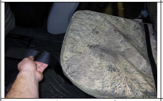
Step 5. Driver and Passenger Bottom/DB&PB:

Tuck the hook Velcro<sup>™</sup> into the seat and fold the seat flat. Connect the hook Velcro<sup>™</sup> to the loop (fuzzy) Velcro<sup>™</sup> sewn inside the back edge. Use your hand in a smoothing action down the front of the seat while pulling on the Velcro<sup>™</sup> to remove slack and tighten the seat cover.