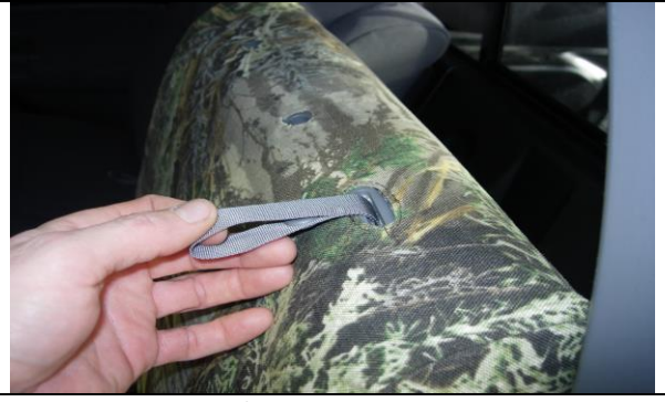
Step 2. Driver Top/DT:

All the parts of the seat cover are labeled inside. Use the seat cover piece identification chart to ID parts. Temporarily remove the headrests by depressing the push button release and gently lifting up in the middle.