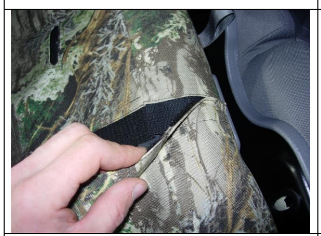
Step 9. Passenger Top/PT: Fold the backrest forward and connect the Velcro<sup>™</sup> behind the center seatbelt.