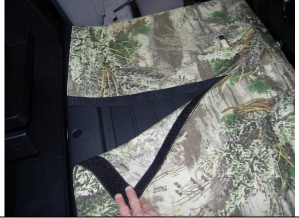
Step 10. Passenger Top/PT: Gather the fabric to the center and mate the Velcro™ down the back working a few inches at a time. Tilt the backrest up and tuck the hook Velcro™ into the seat and connect them to the loop Velcro™ in back same as step 4.