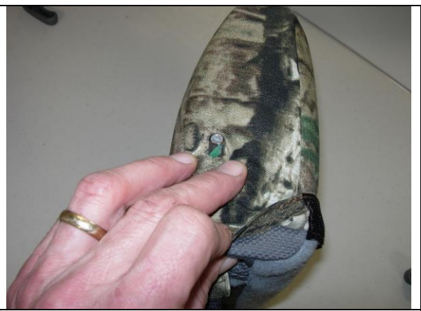
Step 11. Left and Right Headrests/H: Line up the hole in the cover for the lever.