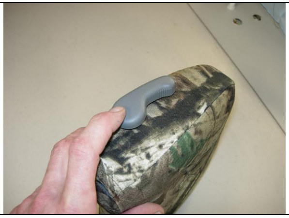
Step 12. Left and Right Headrests/H: Snap the lever back on.