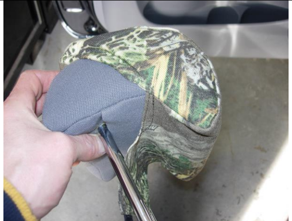
Step 14. Middle Headrest/MH: Slide the cover over the front of the headrest with the extending hook Velcro™ to the front. Connect the Velcro™ same as step 11.