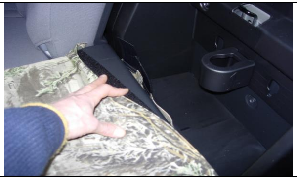
Step 4. Driver Top /DT:

Tuck the fabric under the plastic for the headrests starting with the push button release. Pull the cover down into position on the left and right, lining up the seams of the seat cover to the seams of the seat, they should closely match.