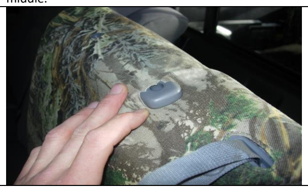
Step 3. Driver Top/DT:

Tilt the backrest away from the cab and slide the seat covers on with the extending hook (sticky) Velcro™ to the front. Feed the release strap through the provided opening.