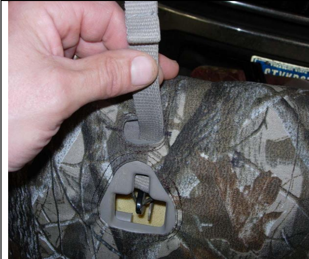
Step 9. Driver & Passenger Top/DT&PT: Slide the seat covers on with the extending hook Velcro™ to the front side. Feed the seat release strap through the provided opening and line up the triangular hole.