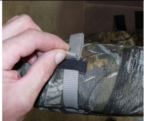
Step 10. Driver & Passenger Top/DT&PT: Feed the release strap through the elastic restraint on the seat cover as shown.