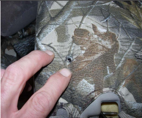
Step 11. Driver & Passenger Top/DT&PT: Line up the holes for the bumpers on the back of the seat.