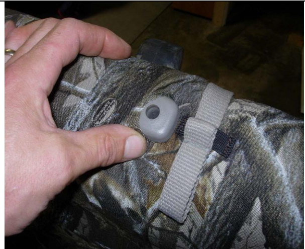
Step 12. Driver & Passenger Top/DT&PT: Tuck the seat cover fabric under the plastic for the headrests stating with the push button side first