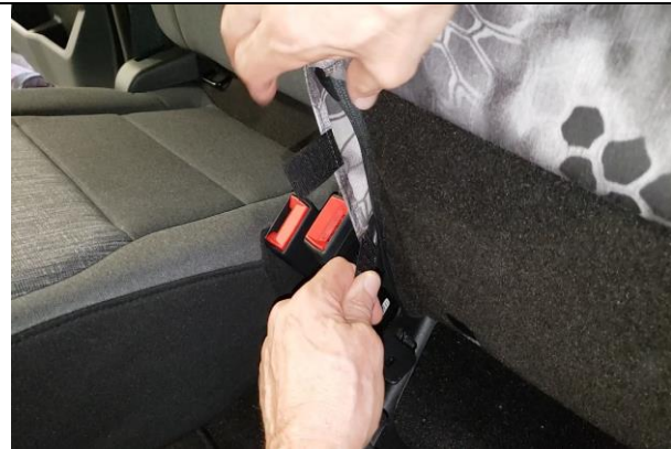
Step 17. Driver & Passenger Bottoms/DB&PB: Attach the side Velcro™ under the seat to the fuzzy carpet under the seat bottom.