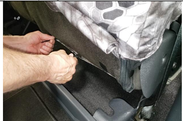
Step 16. Driver & Passenger Bottoms/DB&PB: Lift the seat bottom up, pull the Velcro™ snug, and press the hook Velcro™ to the fuzzy carpet on the underside of the seat.