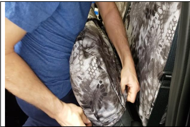
Step 13. Driver & Passenger Bottoms/DB&PB: Slide the cover over the seat with the extending hook Velcro™ on top.