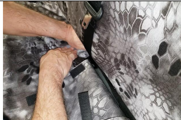
Step 15. Driver & Passenger Bottoms/DB&PB: Tuck the top side in.