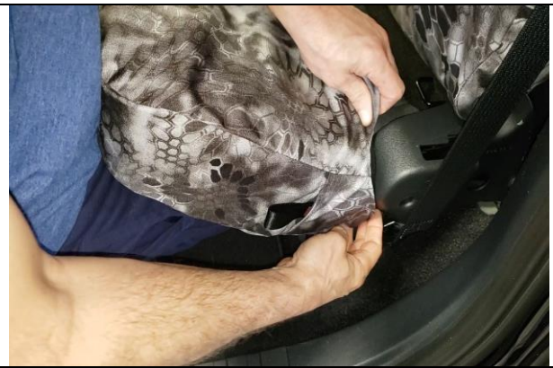
Step 14. Driver & Passenger Bottoms/DB&PB: Route the nylon seat release strap through the provided opening.