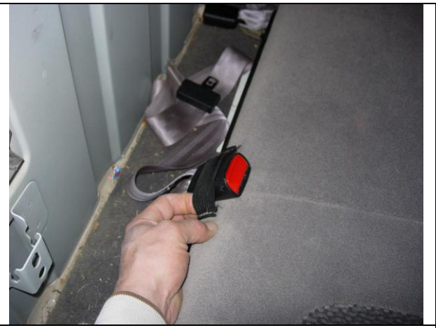
Step 6. Passenger Bottom/PB: Remove the seatbelts from their elastic restraints in the middle of the seat.