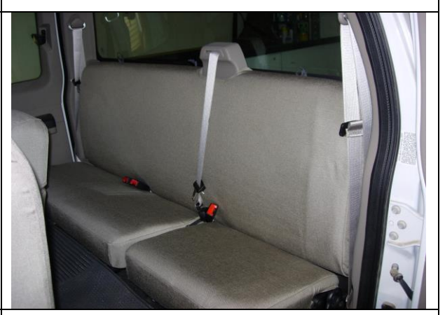
Congratulations, you're done! Your seat covers should fit like they're painted on, giving you several years of use, no matter how hard you use them.

Velcro ^{\text{m}} to the carpet on the bottom of the seat.