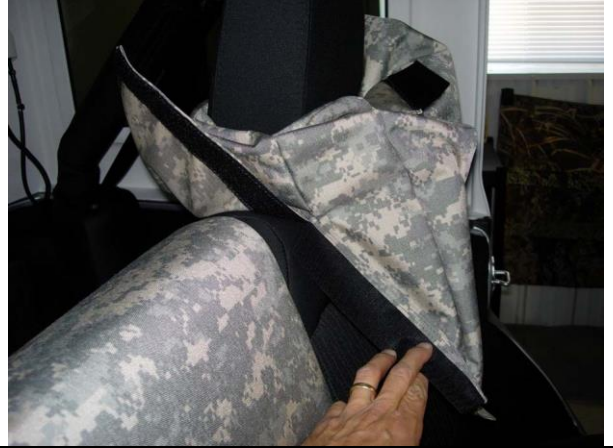
Step 26. Driver Top/DT: Fold the passenger seat down and form the top corners of the seat cover to the seat, lining up the seams.