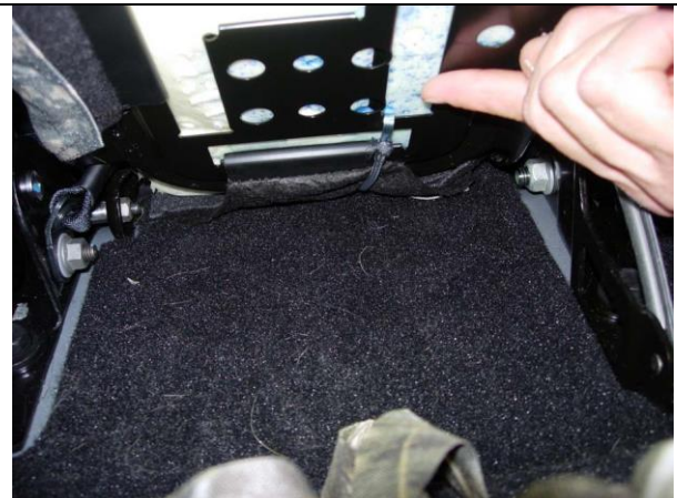
Step 34. Driver Bottom/DB: From under the front of the seat, use the Cordura strap to pull the bungee cord into place and attach it, remove the Cordura strap.