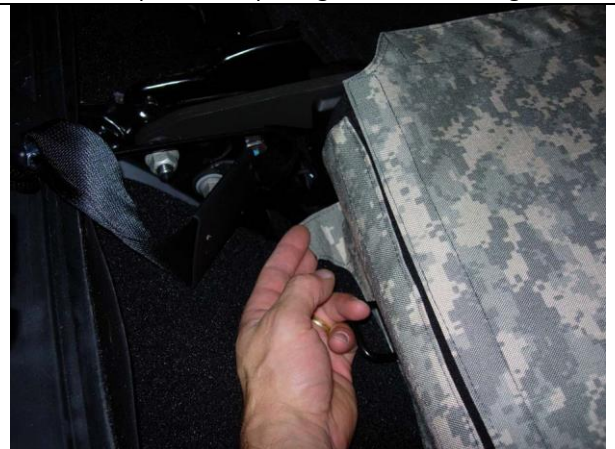
Step 22. Passenger Bottom: Likewise, press the small Velcro™ to the carpet on the back edge of the seat bottom.