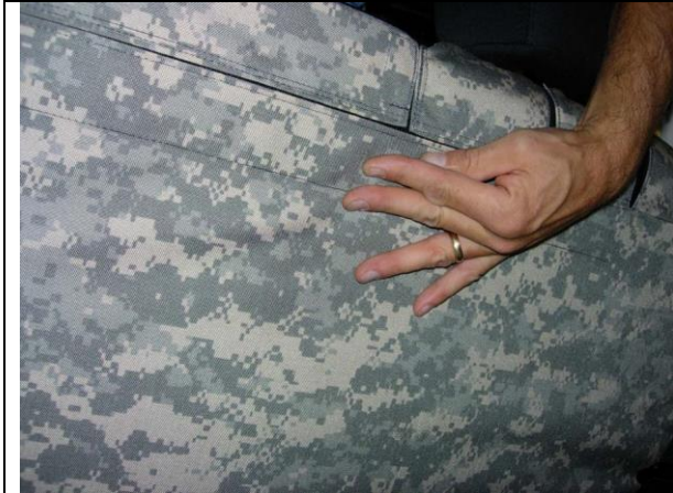
Step 13. Passenger Top/PT: After the Velcro™ is connected it should look like this.