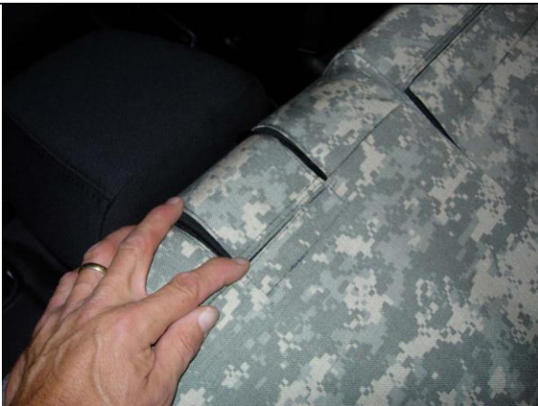
Step 29. Driver Top/DT: As in Step 11, connect the Velcro™ behind the top of the seat.