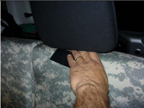
Step 27. Driver Top/DT: Tuck the Velcro™ under the headrest.