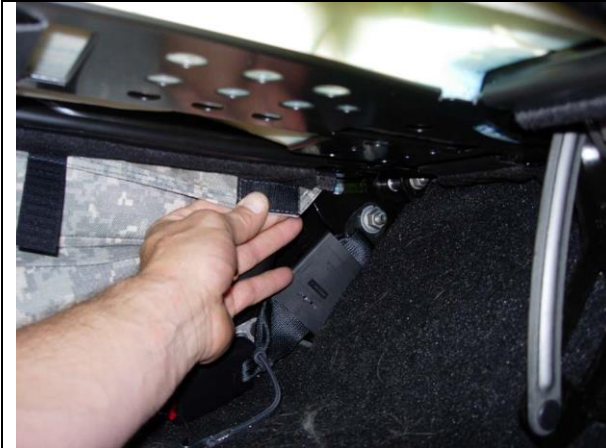
Step 31. Driver Bottom/DB: Place the cover on same as Step 17, press the Velcro™ to the carpet under the seat, and front and back edge.