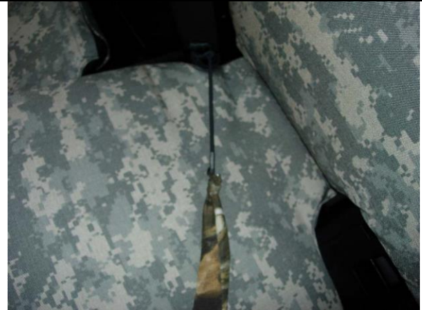
Step 32. Driver Bottom/DB: Tie one of the Cordura straps the cover was sent with to the elastic on the seatbelt.