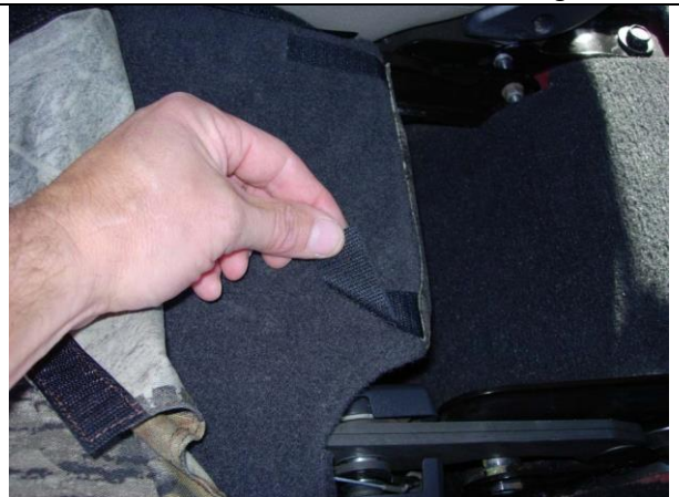
Step 30. Driver Top/DT: Same as Step 15 & 16, connect the Velcro™ to the carpet on the seat.