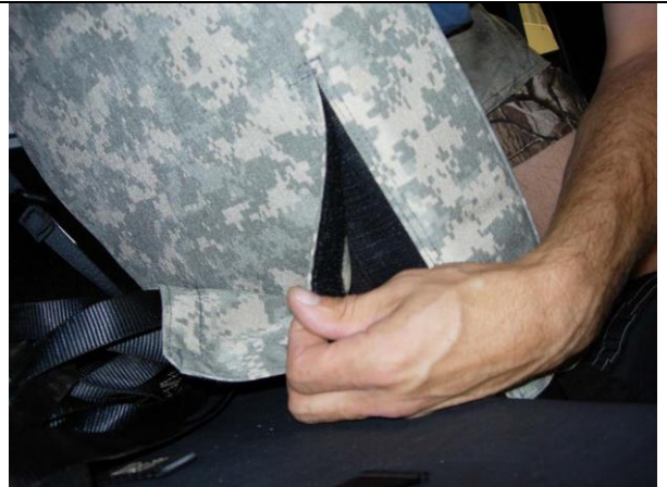
Step 28. Driver Top/DT: Connect the vertical Velcro™ on the inside edge.