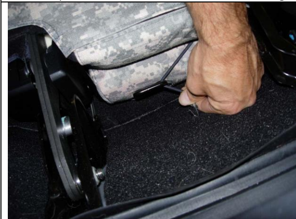
Step 33. Driver Bottom/DB: Re-route the bungee cord thru the metal loop on the back of the seat and tuck the Cordura strap under the seat..