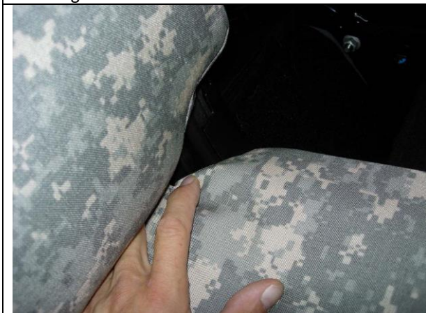
Step 23. Passenger Bottom: Pull the cover around the back inside corner.