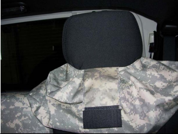
Step 25. Driver Top/DT: Carefully open the seat cover and slide it over the headrest.