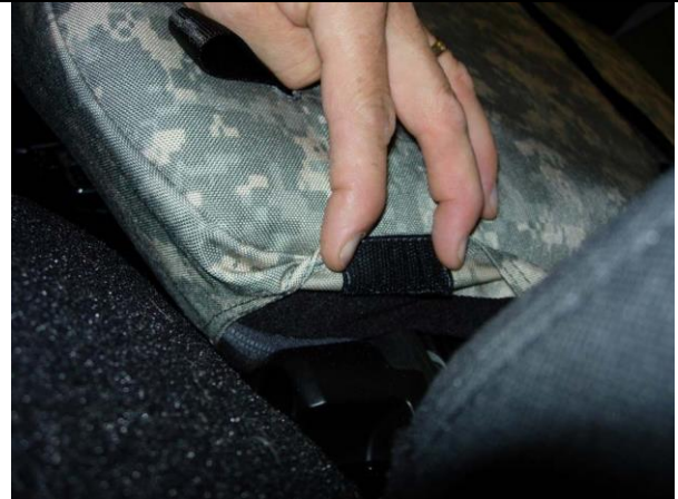
Step 14. Passenger Top/PT: Press the small hook Velcro™ to the carpet fuzz on the outside bottom corner below the nylon pull strap.