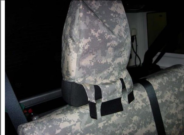
35. Headrests/H: Slide the headrest cover on with the extending Velcro™ to the front, line up the seams.