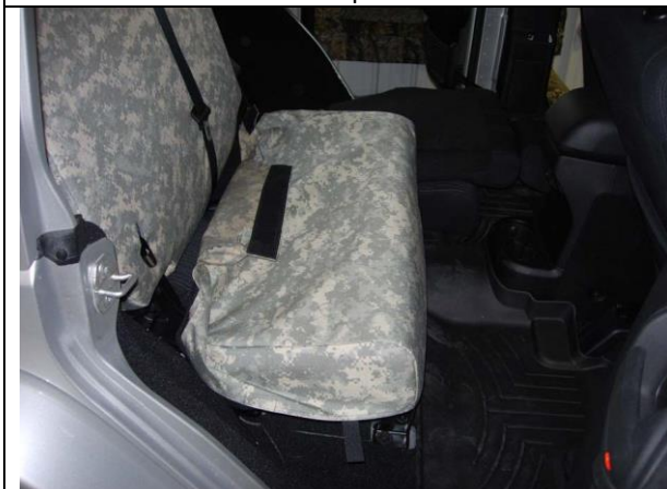
Step 17. Passenger Bottom: Place the seat cover on as shown.