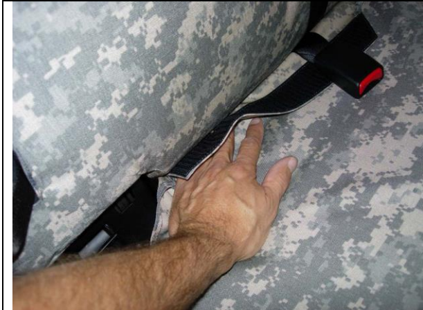
Step 19. Passenger Bottom: Tuck the back edge of the seat cover in.