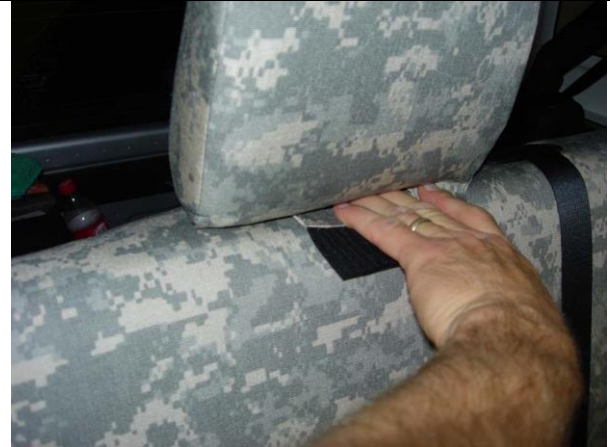
36. Headrests/H: Tuck it under the headrest and connect it to the loop Velcro™ sewn inside the back edge.