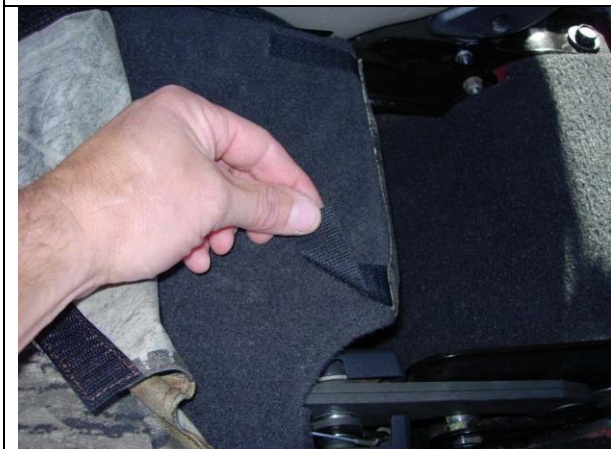
Step 15. Passenger Top/PT: Fold the seat forward and tuck the front edge in. Press the Velcro™ to the carpet on the seat.