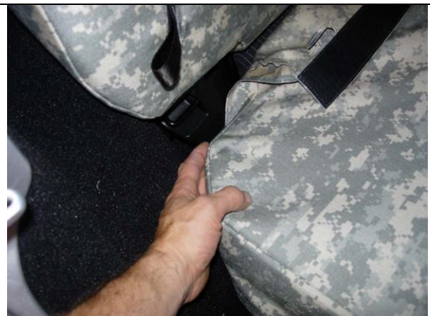
Step 18. Passenger Bottom: Tuck the cover around the back outside corner of the seat.