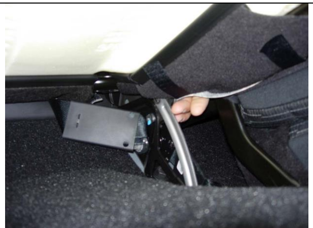
Step 24. Passenger Bottom: Press the Velcro™ to the carpet under the seat.