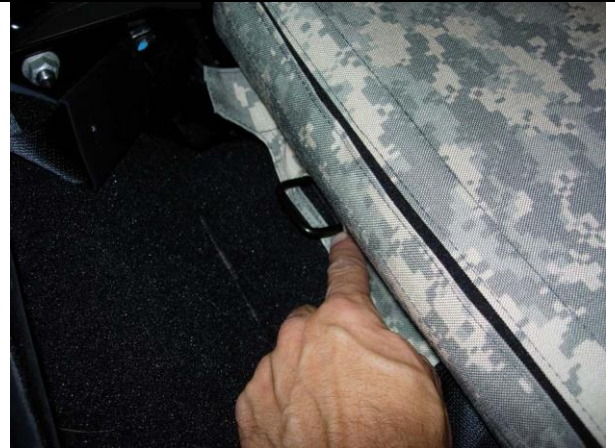
Step 20. Passenger Bottom: Pull the cover back and feed the metal loop thru the seat covers provided opening on the inside edge.