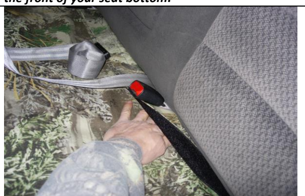
Step 3. Bottom/B:

Temporarily removing the plastic tray behind the seat will help with connecting the Velcro<sup>™</sup> on back edge of the seat cover bottom.