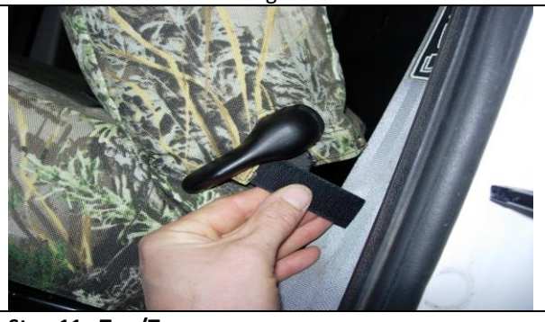
Step 11. Top/T:

Pull the left and right side of the seat cover all the way down into position with the extending hook fasteners to the front. Similar to step 4, work the fabric of the seat cover in (forefinger to thumb. The seams of the seat cover should closely match the seams of the seat.