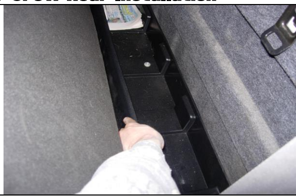
Step 2. Bottom/B:

All the parts of the seat cover are marked inside. Use the "Seat Cover Piece Identification Chart" to identify parts. Temporarily remove the beverage holders on the front of the seat by gently lifting up. Ignore this step if you do not have a drink holder on the front of your seat bottom.