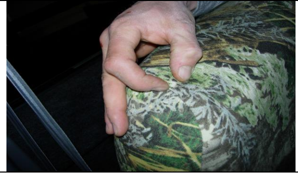
Step 10. Top/T:

View from under the back edge of the seat bottom. Clip the three plastic hooks with the hook Velcro™ sewn to it under the back edge of the seat as shown on the driver, passenger and middle of the seat. Press the hook Velcro™ to the loop Velcro™ sewn on the back edge, trimming the excess. This will keep the seat cover from shifting.