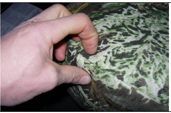
Step 4. Bottom/B:

Place the seat cover on with the long hook (sticky) Velcro^{TM} to the front. Tuck the back edge of the seat cover into the seat. Be sure to keep the seatbelts on top of the seat cover.