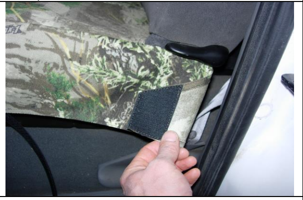
Step 6. Bottom/B:

Ignore this step if you do not have a drink holder on the front of your seat bottom.