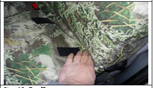
Step 16. Top/T:

Connect the Velcro^{\mathbf{m}} under the release levers on the left and right sides of the backrest.