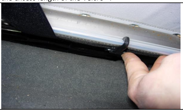
Step 9. Bottom/B:

Route the two long 1" outside edge hook Velcro™ where shown, above the metal frame and mate them at an angle to the loop Velcro™ on the back edge, trim the excess.