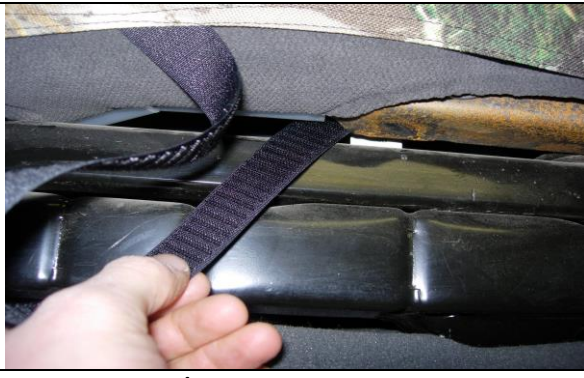
Step 8. Bottom/B:

Route the long hook Velcro<sup>™</sup> in front under the seat and mate them to the loop Velcro<sup>™</sup> sewn on the back edge. Using your hand in a smoothing action from front to back while connecting the Velcro<sup>™</sup> will help to tighten the seat cover. Adjusting the Velcro<sup>™</sup> a few times may be necessary for the tightest fit. Trim the excess length of the Velcro<sup>™</sup>.