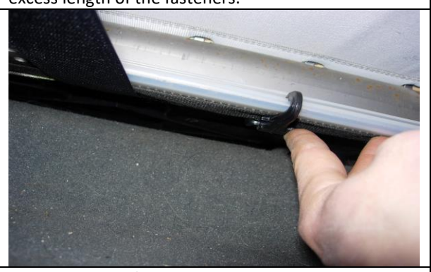
Step 9. Bottom/B:

Route the two long 1" outside edge hook fasteners where shown, above the metal frame and mate them at an angle to the loop strip on the back edge, trim the excess.