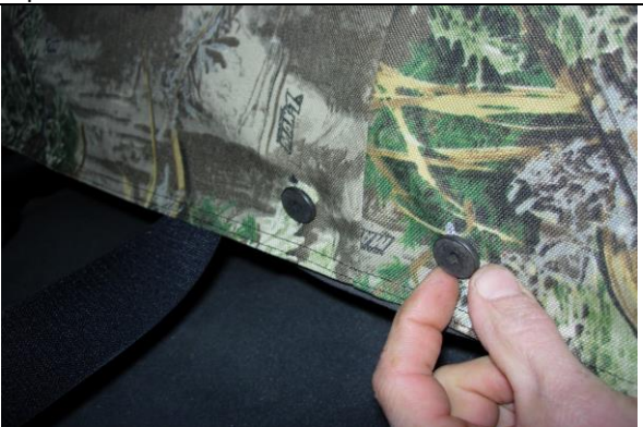
Step 5. Bottom/B:

Work the fabric inside the seat cover to the outside (forefinger to thumb) around the front and sides of the seat cover. The seams of the seat cover should closely match the seams of the seat.