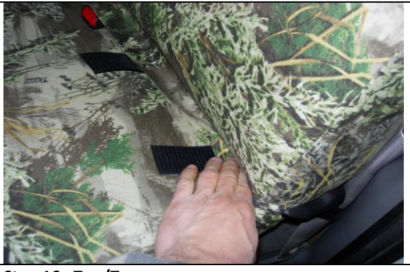
Step 16. Top/T:

Tuck the fabric of the seat cover between the seat and the metal hinge for the armrest on the left and right. Next, push the fabric in under the armrest and mate the hook fasteners to the loop fastener sewn inside the back edge of the armrest cavity. Move the armrest up and down making sure the seat cover doesn't impede the action of the armrest.