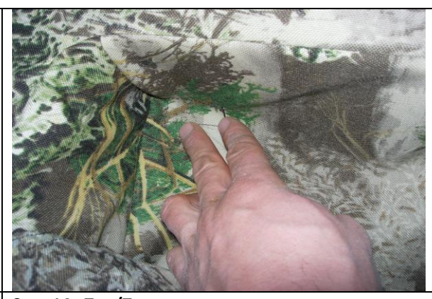
Step 14. Top/T: If there is fuzzy carpet on the back of the armrest cavity, mate the two hook fasteners sewn inside the corners of the seat cover to the carpet.