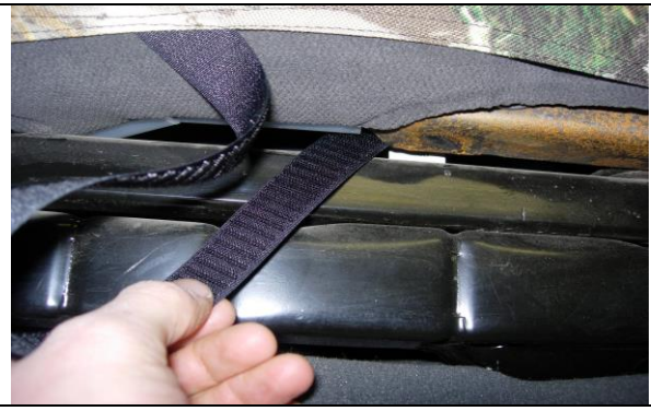
Step 8. Bottom/B:

Route the long hook fasteners in front under the seat and mate them to the loop strip sewn on the back edge. Using your hand in a smoothing action from front to back while mating the fasteners will help to tighten the seat cover. Adjusting the fasteners a few times may be necessary for the tightest fit. Trim the excess length of the fasteners.