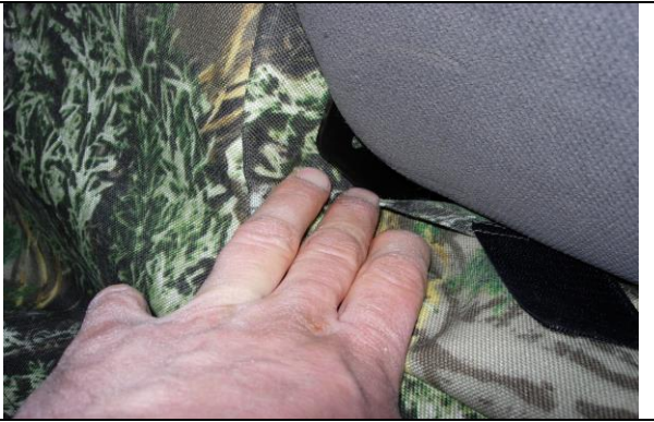
Step 15. Top/T:

Tuck the fabric of the seat cover between the seat and the metal hinge for the armrest on the left and right. Next, push the fabric in under the armrest and mate the hook fasteners to the loop fastener sewn inside the back edge of the armrest cavity. Move the armrest up and down making sure the seat cover doesn't impede the action of the armrest.