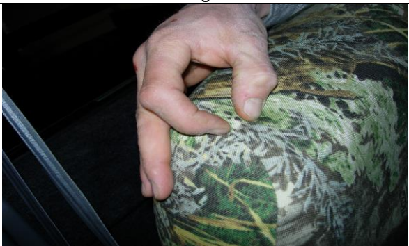
Step 11. Top/T:

Fold the armrest part way down, open the seat cover and slide it on with the extending hook fasteners to the front. Work the armrest through the provided opening.