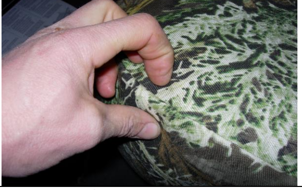
Step 4. Bottom/B:

Place the seat cover on with the long hook (sticky) fasteners to the front. Tuck the back edge of the seat cover into the seat. Be sure to keep the seatbelts on top of the seat cover.