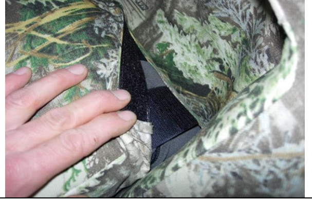
Step 18. Armrest/A: Tuck the hook fasteners inside the back edge and mate the fasteners.

Note: Tuck the fabric of the armrest cover under the plastic for the drink holders before mating the fasteners.