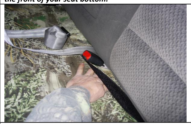
Step 3. Bottom/B:

Temporarily removing the plastic tray behind the seat will help with mating the fasteners on the seat cover bottom.