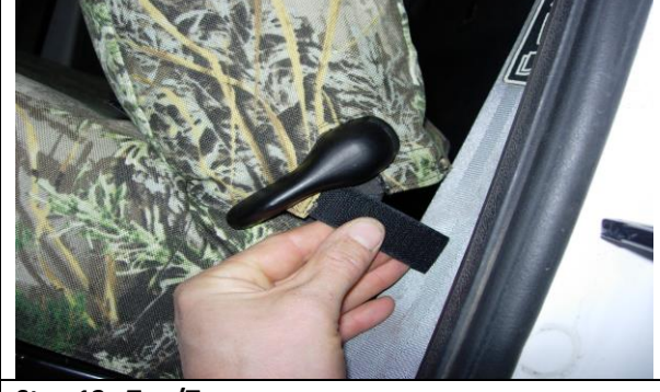
Step 12. Top/T:

Pull the left and right side of the seat cover all the way down into position. Similar to step 4, work the fabric of the seat cover in (forefinger to thumb. The seams of the seat cover should closely match the seams of the seat.