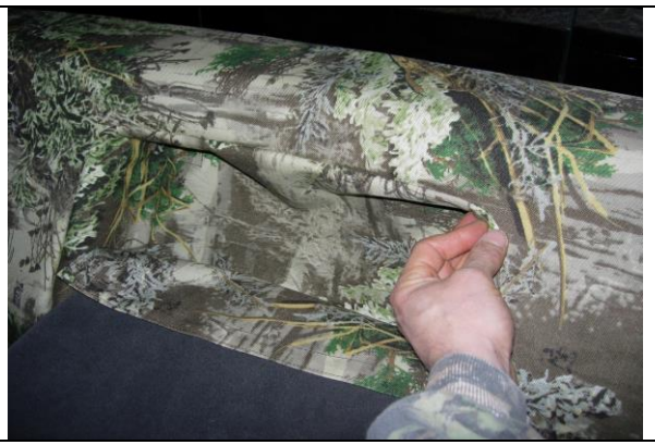
Step 13. Top/T: Line up the seam for the armrest cavity on top, the corners, and down both sides.