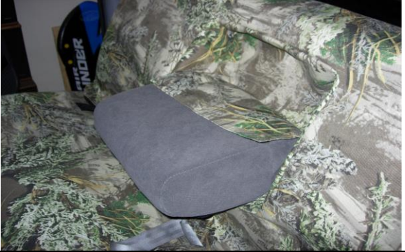
Step 10. Top/T:

View from under the back edge of the seat bottom. Clip the three plastic hooks with the hook fastener sewn to it under the back edge of the seat as shown on the driver, passenger and middle of the seat. Mate the hook fastener to the loop fastener sewn on the back edge, trimming the excess. This will keep the seat cover from shifting.