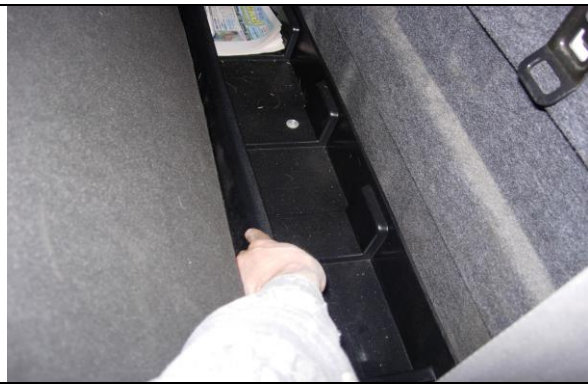
Step 2. Bottom/B:

All the parts of the seat cover are marked inside. Use the "Seat Cover Piece Identification Chart" to identify parts. Temporarily remove the beverage holders on the front of the seat by gently lifting up. Ignore this step if you do not have a drink holder on the front of your seat bottom.