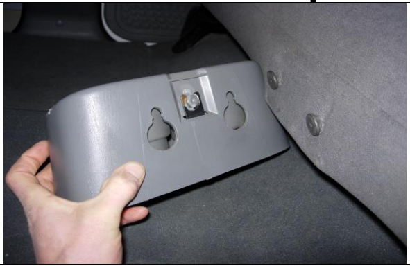
Step 1. Bottom/B:

All the parts of the seat cover are marked inside. Use the "Seat Cover Piece Identification Chart" to identify parts. Temporarily remove the beverage holders on the front of the seat by gently lifting up. Ignore this step if you do not have a drink holder on the front of your seat bottom.