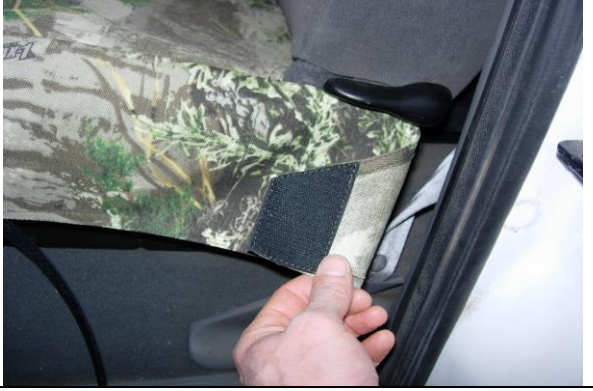
Step 6. Bottom/B:

Feed the metal studs for the beverage holders through the provided holes on the front of the seat. Re-install the beverage holders on the front of the seat. Ignore this step if you do not have a drink holder on the front of your seat bottom.