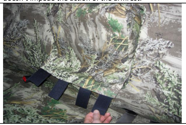
Step 17. Armrest/A: Slide the armrest cover on with extending hook fasteners to the front. Line up the seams of the armrest cover with the seams of the armrest. Tuck the fasteners into the seat and fold the armrest down.

Tuck the extending hook fasteners into the seat. Do this by using one hand in a smoothing action in front from top to bottom and pulling on the fabric from behind with the other hand. Using the smoothing action follow the fastener between the seat bottom and backrest, tucking it behind the back edge and mating the fasteners.