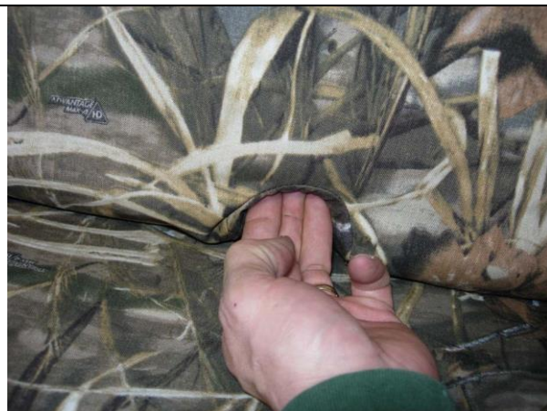
Step 11. Top/T: Tuck the cover into the recessions on the front of the cover.