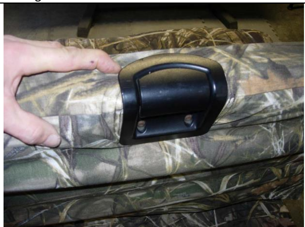
Step 12. Top/T: Loosen the Phillips screws on the plastic and tuck the fabric under the plastic.