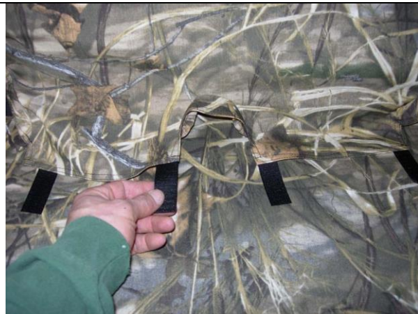
Step 9. Top/T: Slide the cover on with the extending hook Velcro™ to the front.