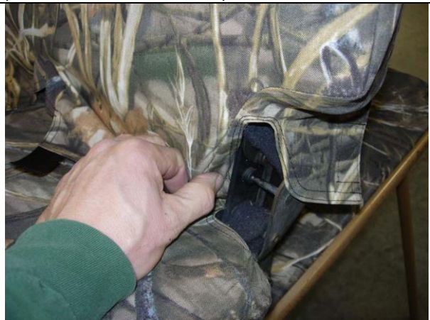
Step 10. Top/T: With the cover pulled into position, tuck the front left and right sides in.