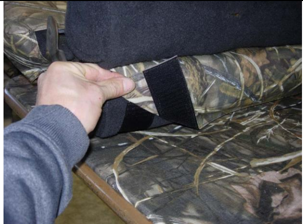
Step 8. Bottom/B: Lastly, pull the cover back from behind the seat, and press the Velcro™ to the carpet on the seat.