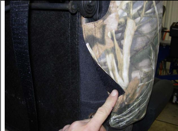
Step 7. Bottom/B: Reposition and fasten the Velcro™ on each side.