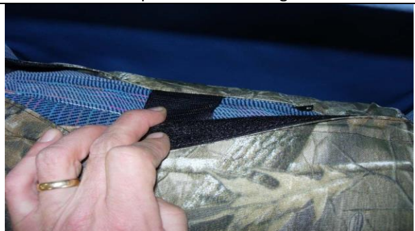
Step 20. Armrest/A: Fold the armrest down and connect the Velcro™.