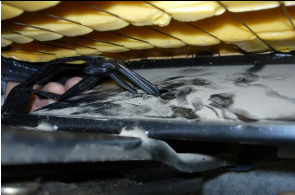
Step 15. Bottom/B: Clip the plastic buckle into the metal pan where shown.