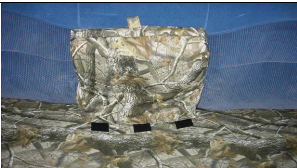
Step 19. Armrest/A: Slide the cover on with the hook Velcro™ to the front.