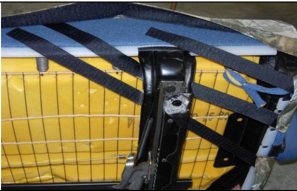
Step 13. Bottom/B: Route the side Velcro™ as shown and press them to the carpet on the back edge of the seat as shown.