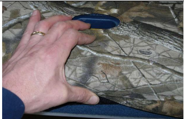
Step 18. Bottom/B: Align the seat belt holes again and press the seat Velcro™ to the carpet on the back edge of the seat.