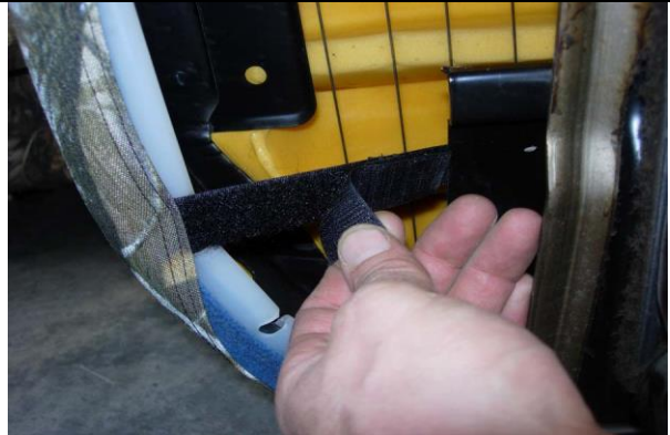
Step 16. Bottom/B: Pull the Velcro™ tight and press it together, and trim the excess.