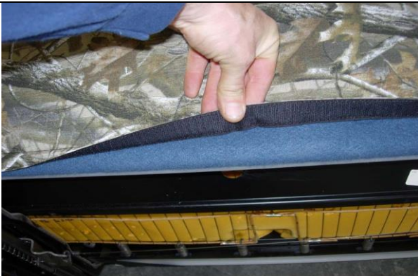
Step 17. Bottom/B: Press the front edge Velcro™ to the carpet on the seat.