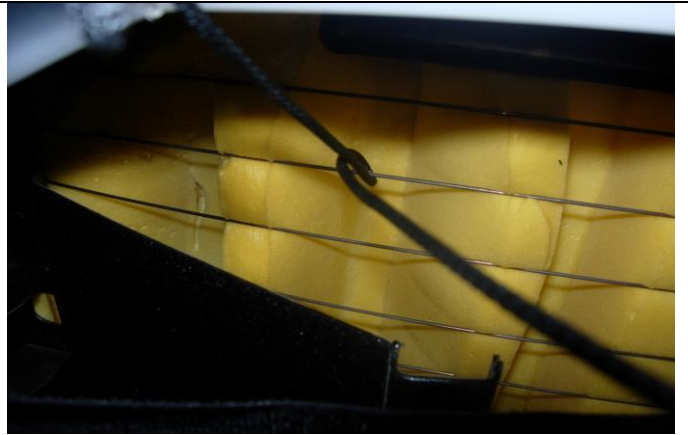
Step 12. Bottom: Run the ropes around one of the wires that support the seat's foam and tie it back to the loop where the rope is sewn on. Be careful to not over tighten the ropes and cause damage to the wire. Bolt the backrest to the bottom and put the plastic on.