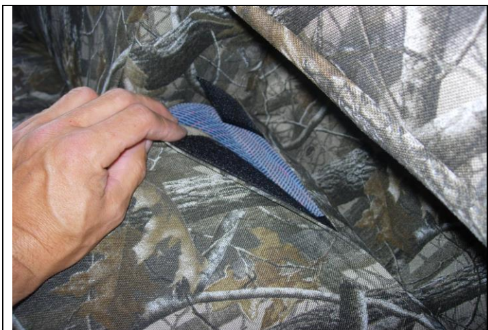
Step 19. Armrest/A: Slide the armrest cover on with the long hook straps to the front and mate them to the loop strip sewn on the back edge as shown.