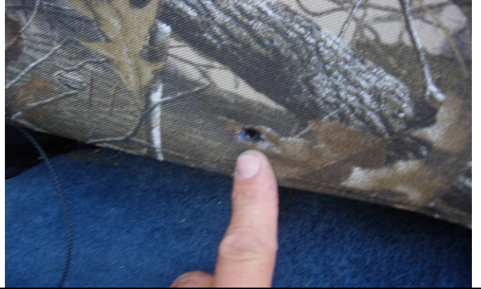
Step 8. Bottom: Pull the sides of the seat cover back and line up the hole for the backrest bolt.