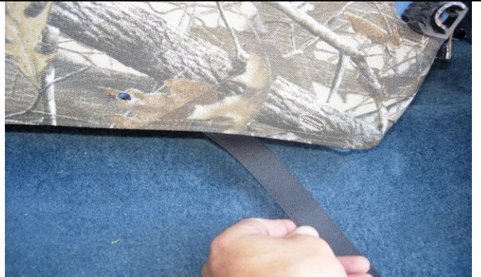
Step 10. Bottom: Route the long outside edge hook strap to the carpet on the back edge of the seat. Lastly, mate the hook strip sewn inside the back edge of the seat cover to the carpet on the back of the seat.