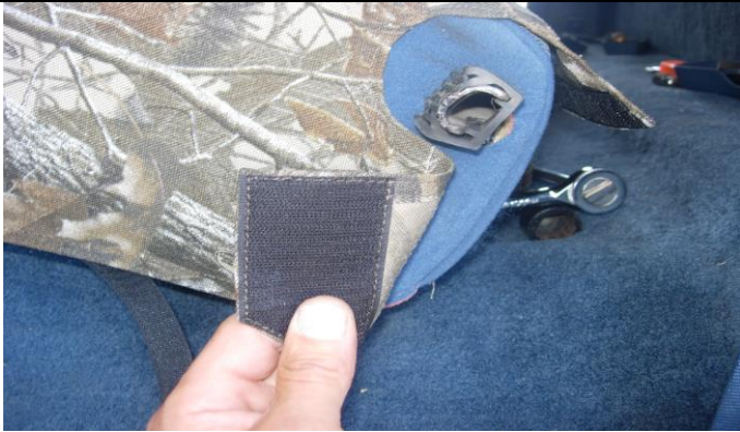
Step 9. Bottom: Pull the side flap around to the back and mate it to the carpet on the back edge of the seat.