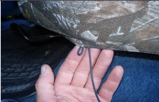
Step 11. Bottom: Route these two outside edge ropes under the seat.