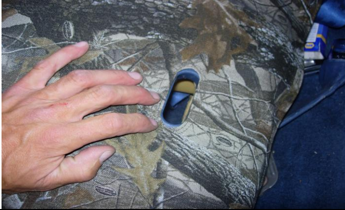
Step 7. Bottom: Center the cut out for the seat belts.