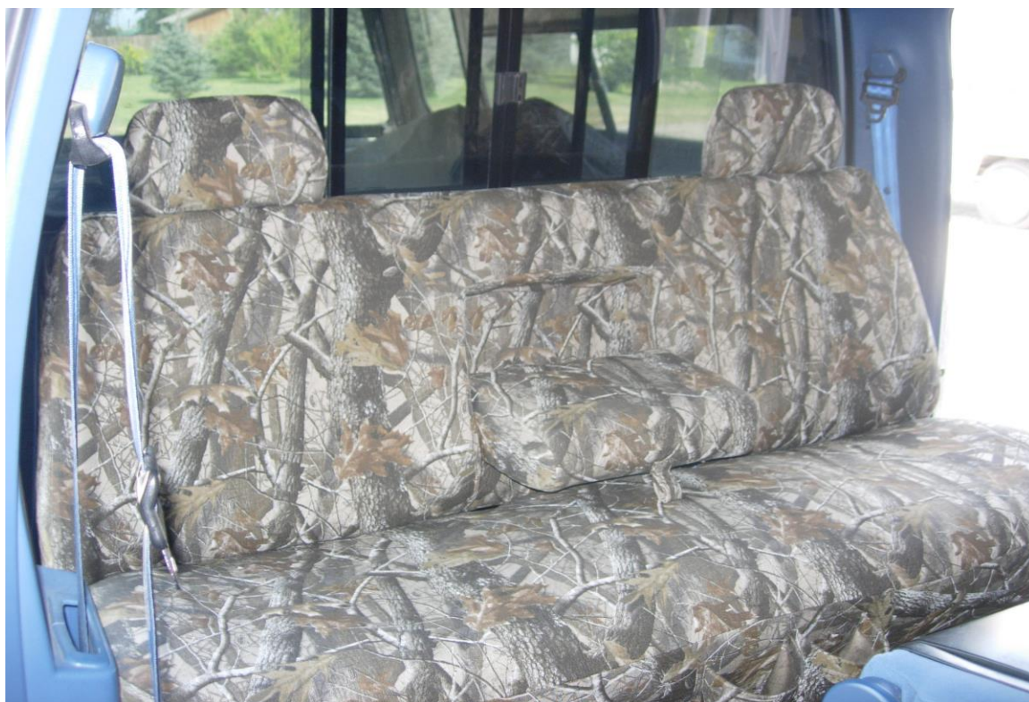
This seat is covered in Realtree Hardwoods HD 1000 Denier Cordura. This is a full coverage seat cover with two beverage holders in front and two gun scabbards behind the backrest.