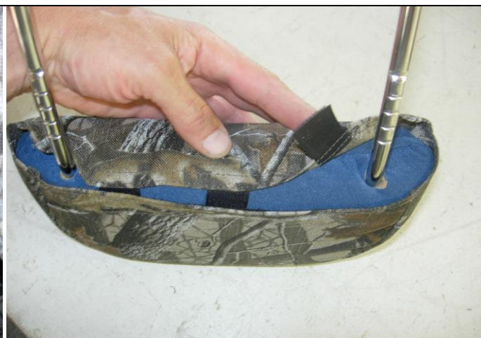
Step 20. Headrests/H: Slide the headrest covers on with the long hook straps to the front and mate them to the loop strip sewn inside the back edge as shown.