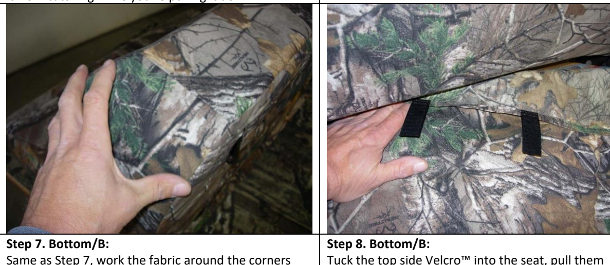
Same as Step 7, work the fabric around the corners and line up the seams.