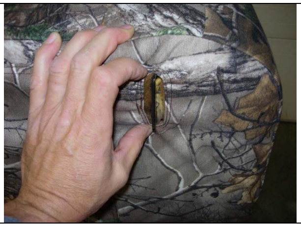
Step 6. Bottom/B: Locate the two openings for the seat bracket and line them up.