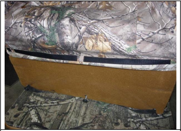
Step 5. Bottom/B: Slide the cover on with the Velcro<sup>™</sup> sewn inside to the bottom side of the seat. Turning it inside out will help it from catching while you're pulling it down.