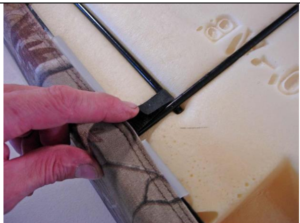
Step 16. Bottom/B: Press it onto the hook Velcro™. Check to see if all the holes for mounting the metal seat back are aligned.