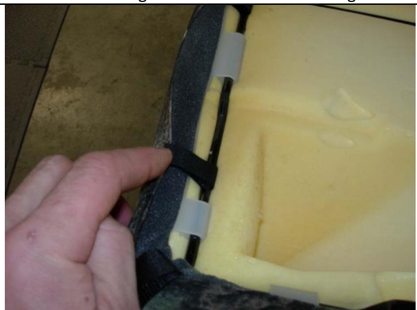
Step 18. Bottom/B: Same as earlier steps, press the Velcro™ together.