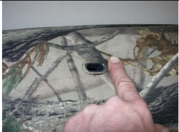
Step 14. Bottom/B: Place the Bottom on and position the opening for the seat release strap, and turn the seat upside down. Same as Step 8, align the holes for mounting the metal seat back.