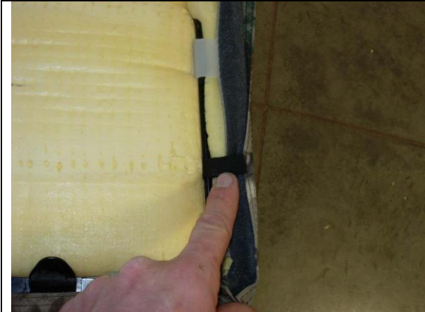
Step 13. Top/T: Press the hook Velcro™ onto the loop Velcro™.