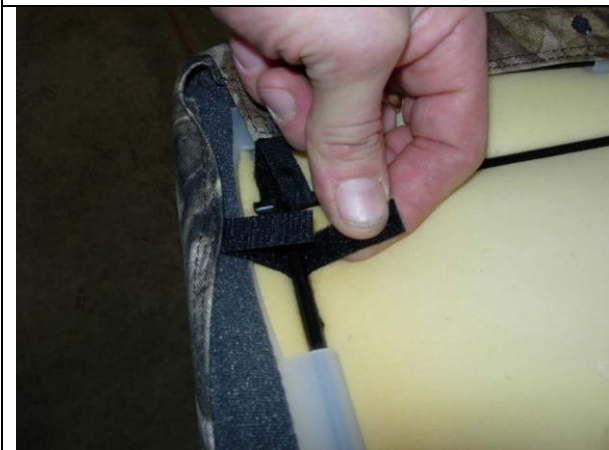
Step 17. Bottom/B: Connect the sides by sliding the loop Velcro™ under the metal bar.