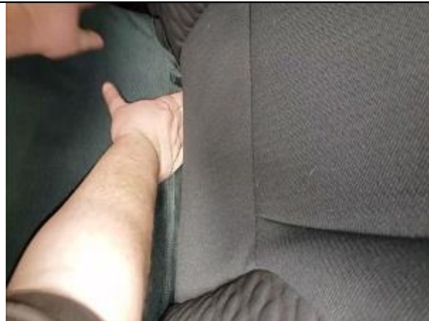
Step 11. Driver & Passenger Bottom/DB&PB: Tuck the back edge of the seat cover into the seat.