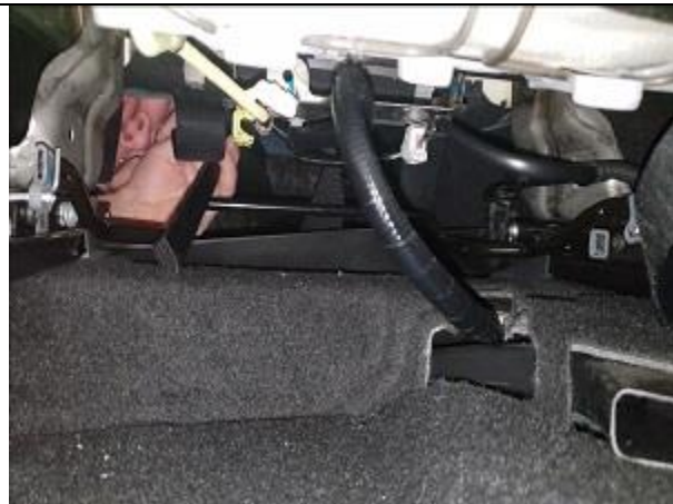
Step 13. Driver & Passenger Bottom/DB&PB: Make sure the Velcro is above any wires or bars that are hanging loose and are not tightly bound to the seat already.