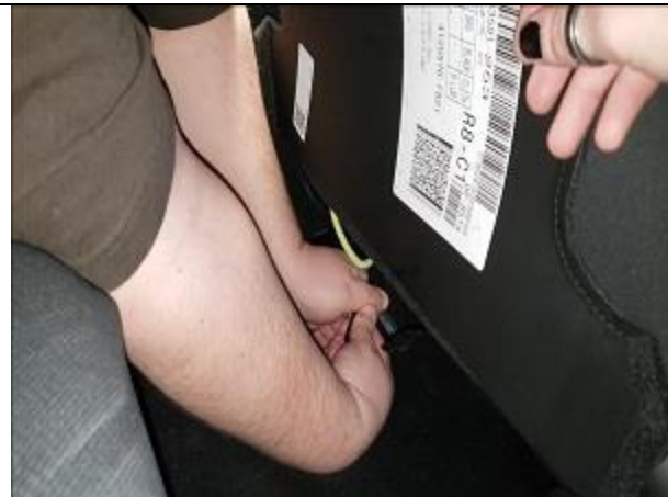
Step 14. Driver & Passenger Bottom/DB&PB: From behind the seat, pull the seat cover back to conform the front of the seat cover to the seat.