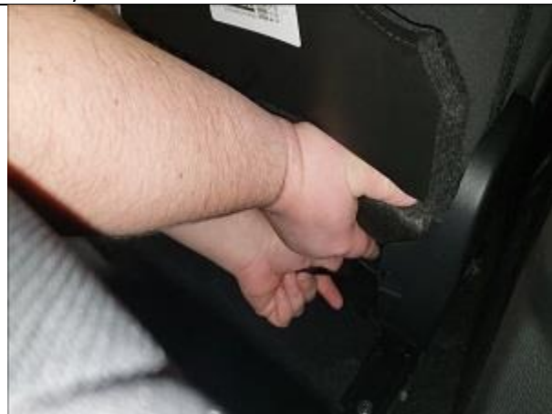
Step 15. Driver & Passenger Bottom/DB&PB: Connect the long Velcro that you sent under the seat to the loop Velcro sewn on the back edge.