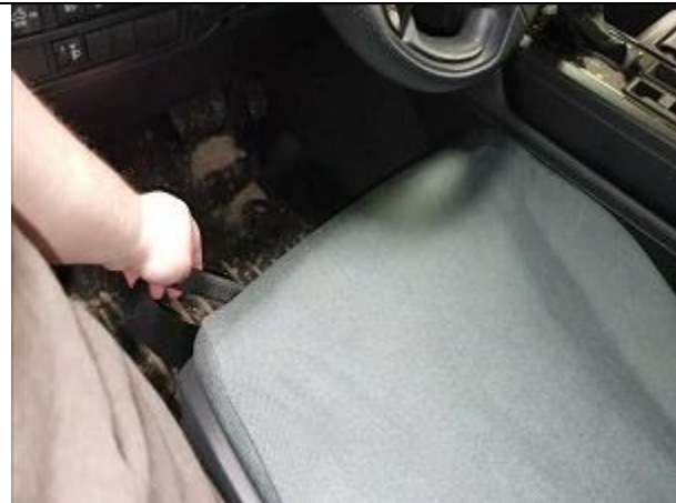
Step 12. Driver & Passenger Bottom/DB&PB: Fold the long front hook Velcro™ in half lengthwise. Send the Velcro under the seat toward the back of the seat.