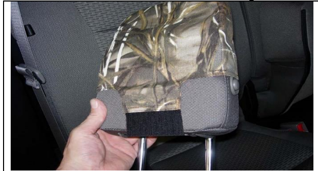
Step 1. Headrests/H: All the parts of the seat cover are labeled inside on the bottom right side. Slide the headrest covers on with the extending hook (sticky) Velcro<sup>™</sup> to the front. *Pictures are from a previous year range, installs the