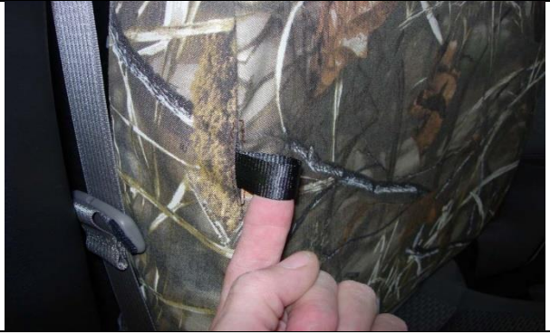
Step 10. Passenger Top/PT: Feed the nylon seat release trap through the provided opening.

Step 9. Driver & Passenger Top/DT&PT: Connect the outside edge 1"X12" hook Velcro™ to the loop Velcro sewn inside the seat cover on the left and right side.