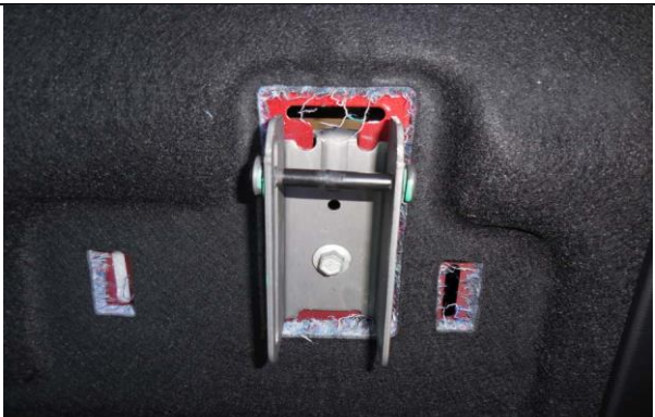
Step 12. Driver & Passenger Top/DT&PT: Driver Top/DT:

Make sure the driver side back wall catch is positioned where shown. Lift the driver side seat bottom up all the way and push the backrest in until you hear it click back in. This may take a few tries to get it done.