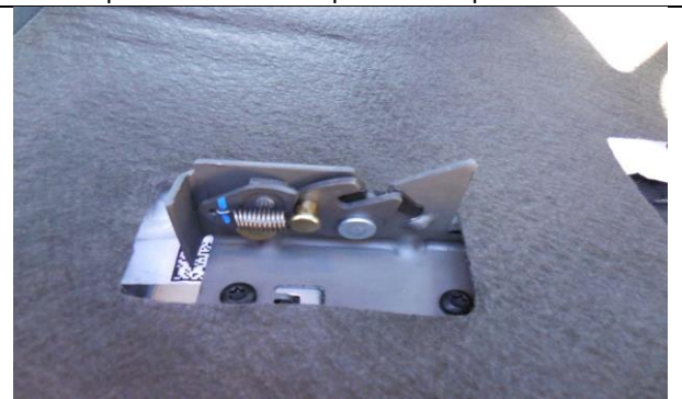
Step 6. Driver Top/DT&PT: Release the driver side backrest by lifting the seat bottom up all the way. Put a leather glove on and feel behind the outside top edge of driver side in and down about six inches. Look behind the seat, you're feeling for the release in the picture. Directly on the opposite side of the brass pin shown there is a silver pin same size, lift it up until hear it click and the will seat release. The passenger side backrest has an exposed nylon release strap that can be seen on Step 10.