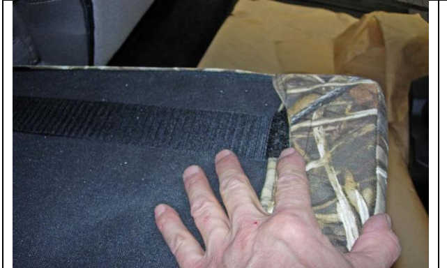
Step 11. Driver & Passenger Top/DT&PT: Connect the long hook Velcro<sup>™</sup> to the loop Velcro<sup>™</sup> sewn inside the top edge as shown. Do this by gently pulling on the long hook Velcro<sup>™</sup> with one hand while using the other hand in a smoothing action down the front of the seat from top to bottom.