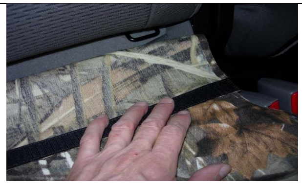
Step 4. Driver & Passenger Bottoms/DB&PB: Slide the seat covers on with the letters DB & PB to the top. Line up the seams of the seat cover to the seams of the seat, and line up the opening for the seat release pull tabs used to flip the seat up.