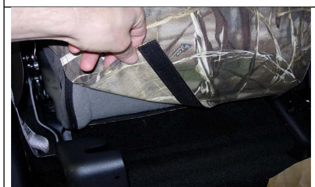
Step 5. Driver & Passenger Bottoms/DB&PB: Passenger Bottom: Re-connect the side Velcro<sup>™</sup> from Step 3. Tuck in the top side, pull it tight and press the hook Velcro<sup>™</sup> to the fuzzy carpet on the back edge of the seat. Lastly pull the bottom side tight and press it to the fuzzy carpet under the seat.