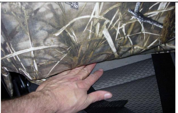
Step 8. Driver & Passenger Top/DT&PT: Tuck in the front edge of the seat cover and fold the backrest forward. Make sure to pull the cover down far enough that the rounded bottom left and right corners are forming to the bottom of the backrest.