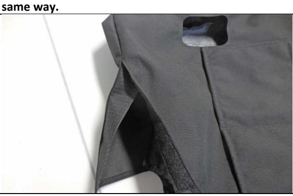
Step 3. Passenger Bottoms/PB: Carefully open the side Velcro<sup>™</sup> on the Passenger Bottom as shown.