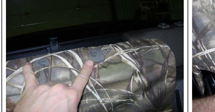
Step 7. Driver & Passenger Top/DT&PT: Tuck the seat cover under the plastic for the headrests starting with the push button release.