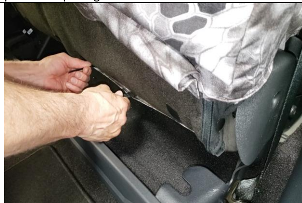
Step 16. Driver & Passenger Bottoms/DB&PB: Lift the seat bottom up, pull the Velcro™ snug, and press the hook Velcro™ to the fuzzy carpet on the underside of the seat.