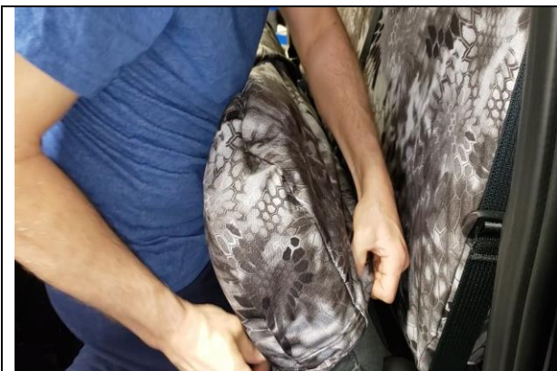
Step 13. Driver & Passenger Bottoms/DB&PB: Slide the cover over the seat with the extending hook Velcro™ on top.