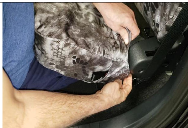
Step 14. Driver & Passenger Bottoms/DB&PB: Route the nylon seat release strap through the provided opening.