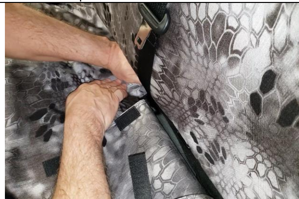
Step 15. Driver & Passenger Bottoms/DB&PB: Tuck the top side in.