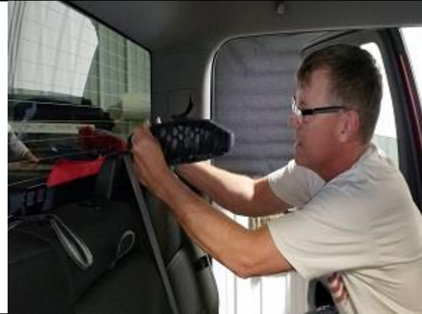
Step 7. H/Headrest: Same as Step 4, slide the cover on with the headrest still attached to the seat. Fold the headrest forward by depressing the side button, and remove it same as Step 5 using the two release buttons.