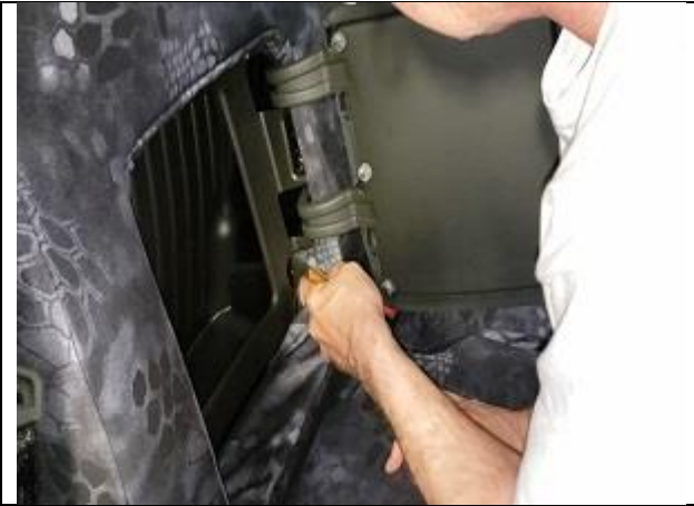
Step 25. T/Top: Tuck the fabric behind the hinge area.