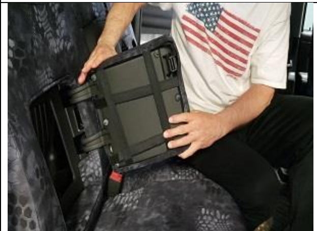
Step 27. DTS/PTS: Center the cover, forming it to the corners, then connect the Velcro™ on the backside as shown.