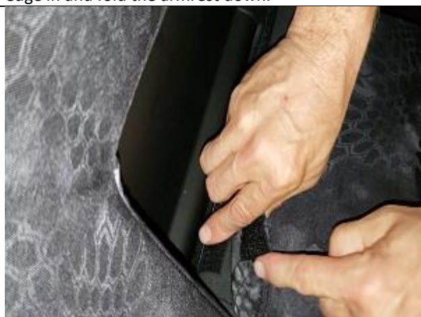
Step 32. A: Lastly, connect the Velcro™.