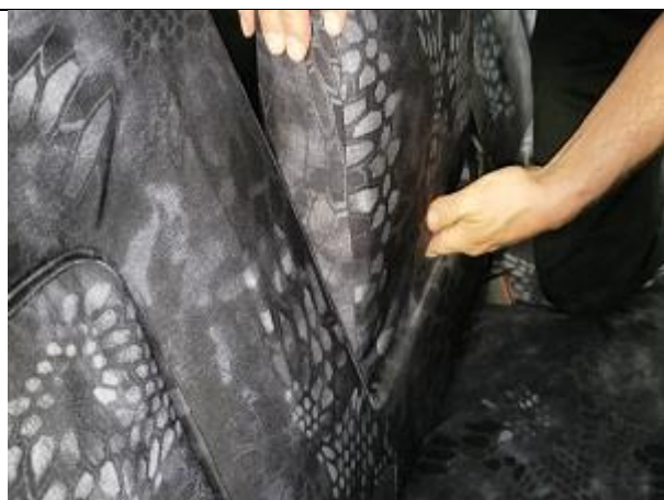
Step 30. A: Align the cover same as previous steps. Tuck the front edge in and fold the armrest down.