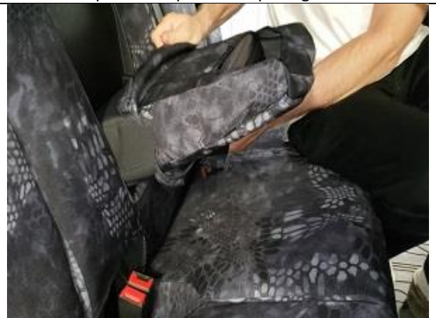
Step 28. A: Slide the armrest cover on with the drink holder on top.