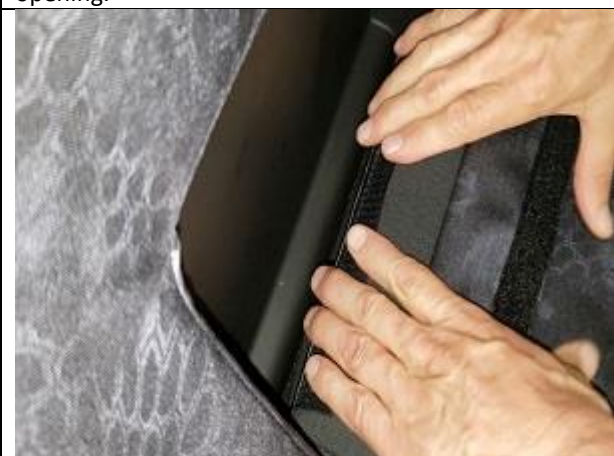
Step 31. A: Pull the hook Velcro™ thru and press it to the armrest as shown.