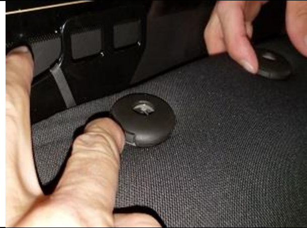
Step 5. MH/Middle Headrest: Release the middle headrest by gently lifting up and depressing the push button release as shown, lifting it up evenly.