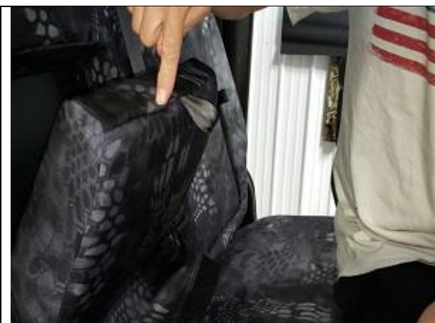
Step 29. A: Feed the pull strap for the armrest thru the provided opening.