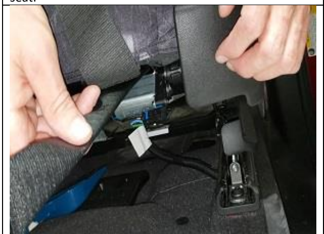
Step 15. DB/PB: Driver & Passenger Bottom Fold the long front hook Velcro™ lengthwise with the hook facing in. This will stiffen the Velcro up like a ruler and make it easy to route the Velcro™ to the back edge. Route the Velcro™ keeping it up directly under the seat avoiding wiring, electric motors, and the metal framework. Using the smoothing method in Step 14, tighten the cover, and connect the long front hook Velcro™ to the loop Velcro™ sewn on the back edge, avoiding the areas the clip connects to shown in Step 12.