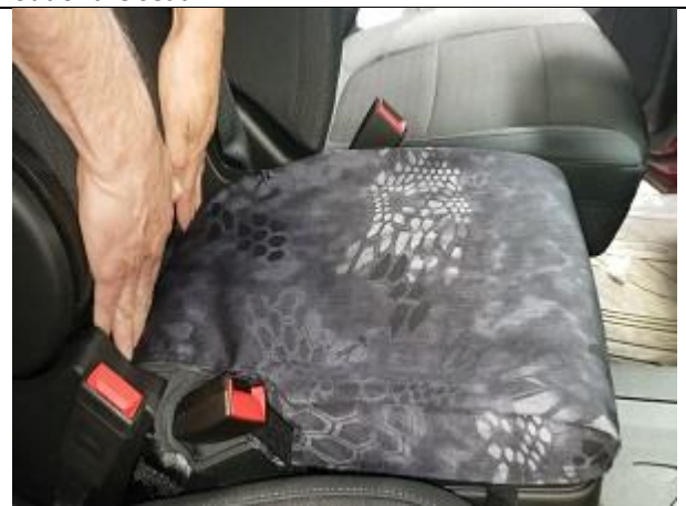
Step 3. MB: Middle Bottom

All the parts of your seat cover are labeled on the inside right of each part. Use the seat cover Part ID chart to ID parts. Slide the headrest cover on with the extending hook Velcro™ to the front. Tuck the fabric under the button on the side. Line up the seams of the cover to the seams on the headrest, they should closely match. Connect the front hook Velcro™ to the loop Velcro™ sewn inside the back edge.