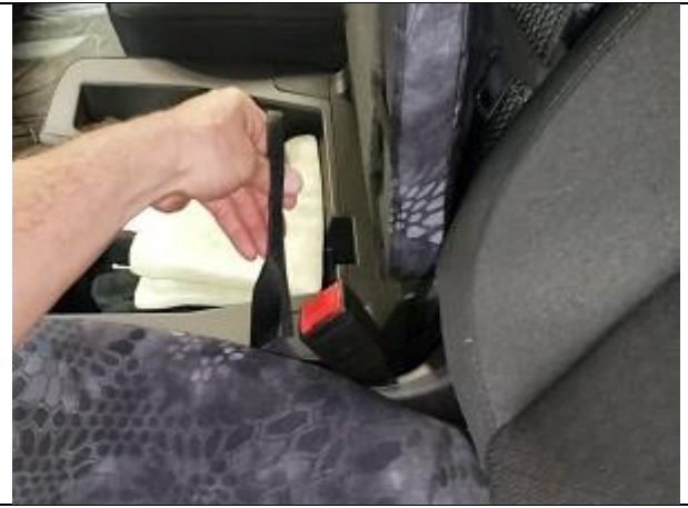
Step 17. DB/PB: Driver & Passenger Bottom Lift up the middle seat, and route the inside edge Velcro™ under the seat, avowing seat mechanisms and angle it to the back of the seat.