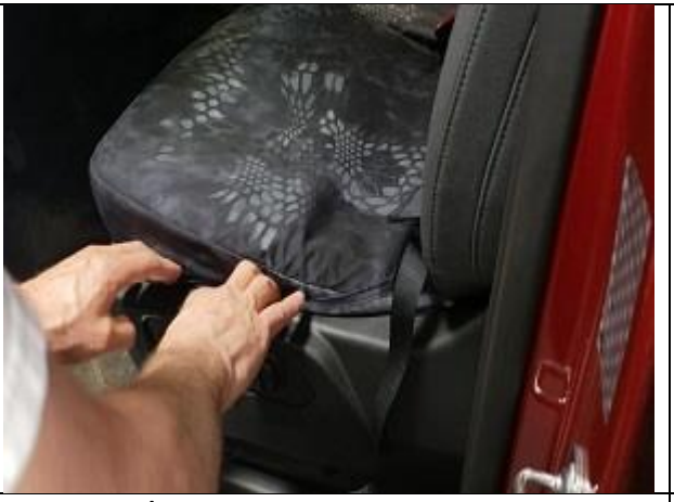
Step 13. DB/PB: Driver & Passenger Bottom Each seat cover bottom is marked on the inside back right edge "DB or PB" for driver and passenger bottoms respectively. Carefully disconnect all the Velcro™, and set aside the two "safety buckles" and set aside. For electric controlled seats, lift them all the way up, clearing a path for the Velcro™ to run under the seat, above all the metal framework. Sliding the seats forward will give you room to work from behind the seat. Place the cover on as shown, lining up the seams of the seat cover to the seams on your seat, they should match closely. Carefully tuck the cover behind the plastic cowling, and tuck the back edge into the seat.