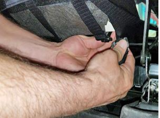
Step 24. DT/PT: Driver & Passenger Top Connect the plastic hooks under the seat to the same metal bar as in Step 12, lining them up with the loop Velcro™ sewn to the seat cover.