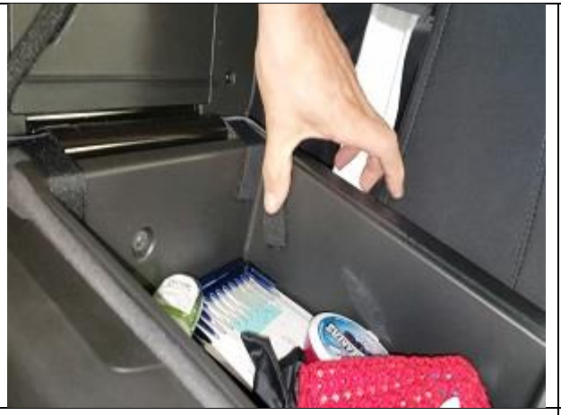
Step 9. C: Console

Fold the Velcro into the console cavity and note where they will connect. Prepare the surface for the adhesive Velcro™ with rubbing alcohol and paper towel. Wet the towel and scrub the areas hard, wiping them clean while it's still wet. This removes any residue from the cleaning. Next, peel off the backing on the adhesive hook Velcro still connected to the loop Velcro on the cover, pressing it onto the plastic hard. If the Velcro doesn't stick, re-clean the area with soapy water, then rubbing alcohol. Extra adhesive Velcro™ is provided.