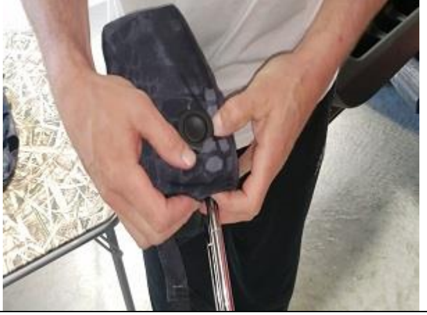
Step 2. H: Headrests

Please note, the headrests are difficult to remove, but not impossible. Using an Allen wrench or similar tool, push the fabric down exposing the small ring being pointed at. Hook your Allen wrench into the ring and push back. When the post releases, pry your hand under the headrest holding gentle upward pressure keeping the post from going back into the seat. While holding the released post up, release the other post using the same method, evenly sliding the headrest out of the seat.