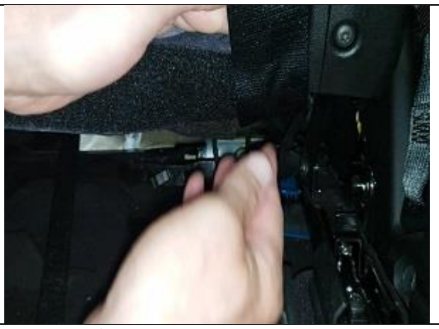
Step 18. DB/PB: Driver & Passenger Bottom Working from behind the seat, locate the side Velcro™, routing them making sure to avoid the seat mechanisms and the clip locations from step 12.