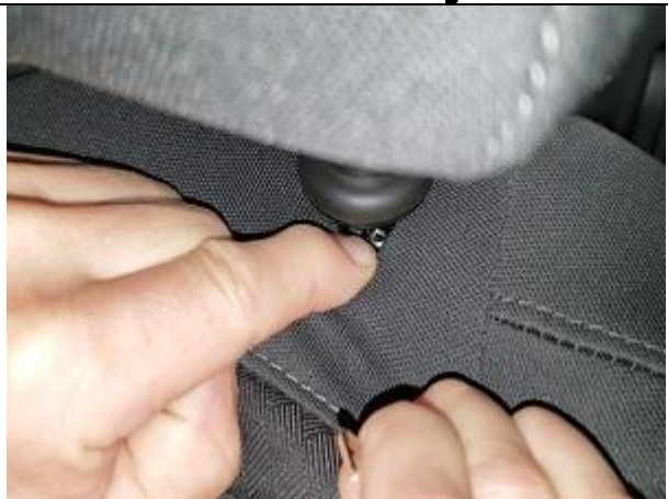
Step 1. H: Headrests

The installation can be viewed on our YouTube channel: <a href="https://youtu.be/rQ2nVcHnl1s">https://youtu.be/rQ2nVcHnl1s</a>