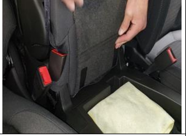
Step 4. MB: Middle Bottom

Place the cover on as shown, tucking in the back edge and aligning the cover on left and right.