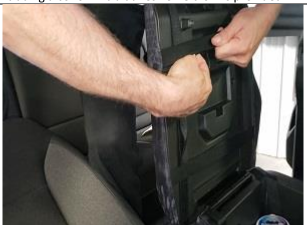
Step 11. L: Lid

Carefully disconnect the Velcro, and place the cover on with the Velcro™ splayed out as shown. If possible, install the cover from behind. Use your knee's to hold the back of the cover in place and pull the front edge on.