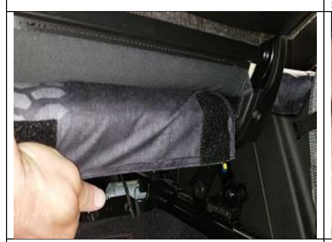
Step 23. DT/PT: Driver & Passenger Top Pull the cover down into place.