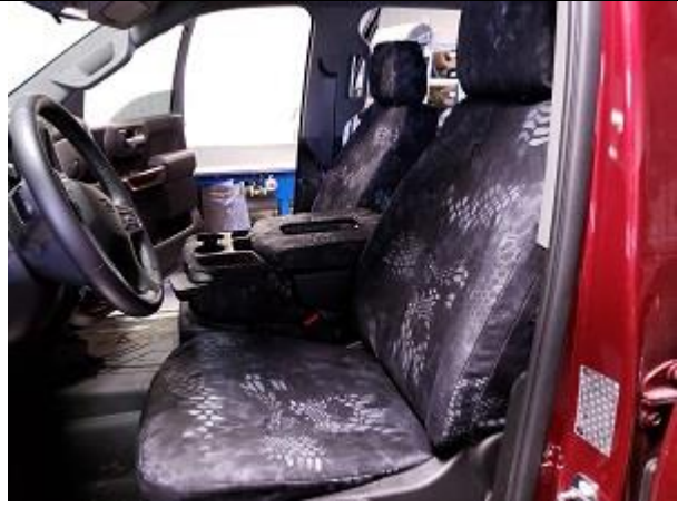
Congratulations! Your properly installed seat cover should look like it's painted on, and stay in place until you remove them.