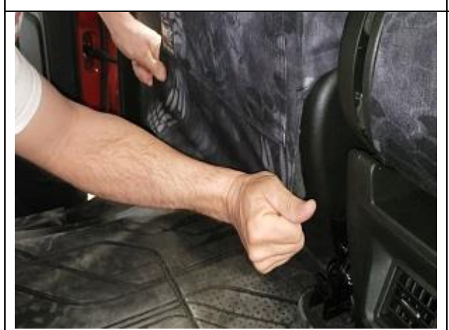
Step 27. DT/PT: Driver & Passenger Top Lastly, pull down and press the hook Velcro™ sewn inside the cover to the fuzzy carpet on the seat as shown.