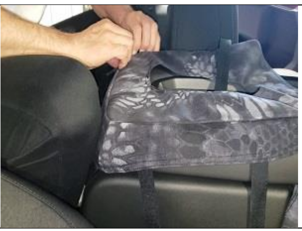
Step 10. L: Lid

Fold the Velcro into the console cavity and note where they will connect. Prepare the surface for the adhesive Velcro™ with rubbing alcohol and paper towel. Wet the towel and scrub the areas hard, wiping them clean while it's still wet. This removes any residue from the cleaning. Next, peel off the backing on the adhesive hook Velcro still connected to the loop Velcro on the cover, pressing it onto the plastic hard. If the Velcro doesn't stick, re-clean the area with soapy water, then rubbing alcohol. Extra adhesive Velcro™ is provided.