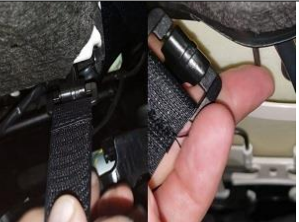
Step 20. DB/PB: Driver & Passenger Bottom Lastly, connect the two "safety buckles" under the back edge of the seat to the same metal bar the clips fastened to in Step 12, avoiding the areas for the clips. Connect the safety buckles to the loop Velcro™ sewn on the back edge, trim the excess. This step keeps your seat bottom anchored and keeps it from sling around.