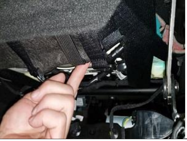
Step 26. DT/PT: Driver & Passenger Top Reconnect the factory plastic clips from Step 12 under the seat. You may have to adjust previously connected Velcro slightly to expose the clip area.