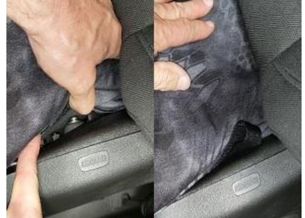
Step 16. DB/PB: Driver & Passenger Bottom View of the outside edge of the driver seat bottom. Push the seat away from the plastic cowling as shown, noting the gap to feed the side Velcro™ thru. Same as Step 15, fold the Velcro™ in half lengthwise to stiffen it up making it easier to route to the back edge.