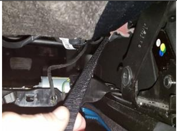
Step 19. DB/PB: Driver & Passenger Bottom While gently pulling on the side Velcro™, use one hand in a smoothing action along the side of the seat from front to back taking up any slack in the cover, then connect the hook Velcro™ to the loop Velcro™ sewn on the back edge. Do the same for both sides.