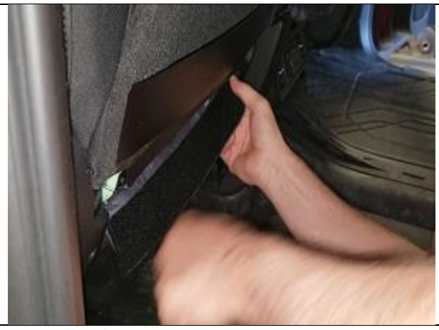
Step 14. DB/PB: Driver & Passenger Bottom View from behind the driver seat. Grab onto the back edge of the cover and pull. Use one hand in a smoothing action from front to back on the cover to gain slack and tighten the cover to the front of the seat.