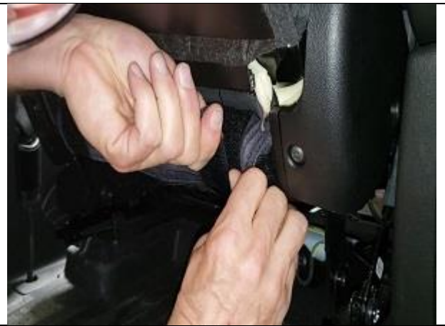
Step 25. DT/PT: Driver & Passenger Top Pull the cover down hard, connecting the buckle Velcro™ to the loop Velcro™ sewn to the cover.