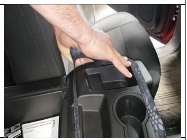
Step 8. C: Console Connect the Velcro™ behind the seatbelt as shown.