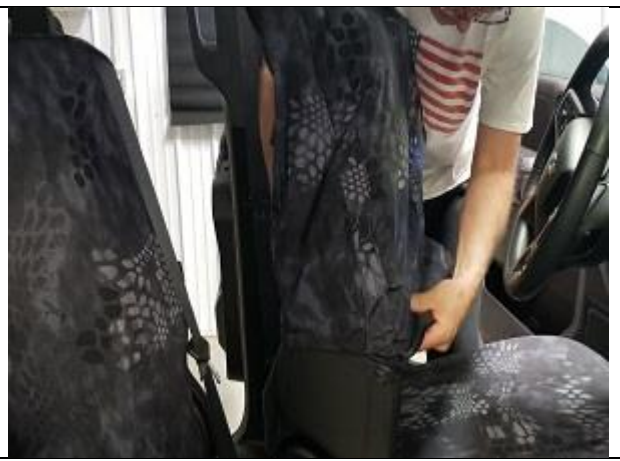
Step 21. DT/PT: Driver & Passenger Top Provisions are made for the side impact airbags. It is critical to get the covers on the correct side. The covers are marked on the inside front right "DT & PT" for Driver & Passenger Tops. Also note, the Driver Top has our Headwaters Seat Cover label on the backside. Disconnect the plastic buckles with hook Velcro™ and set them aside. Slide the covers on with "DT & PT" to the front.