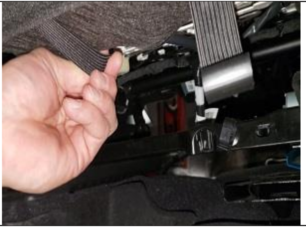
Step 12. Seat Preparation

Use one hand to hold the cover in place, then lift the console lid up. Connect the front to back, or top to bottom Velcro™ first, then the side Velcro™. Once in place, re-tighten each Velcro™. Do this by pulling on the connected to gain some slack. Then disconnect the Velcro™, holding onto the ends of each Velcro™, pulling hard and reconnecting them.