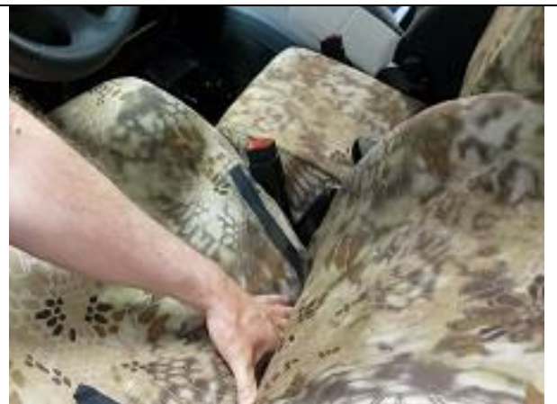
Step 19. Driver & Passenger Top/DT&PT: Slide the seat covers on with the extending hook Velcro™ to the front. Tuck the fabric under the plastic molding on the outside bottom edge of the seat.