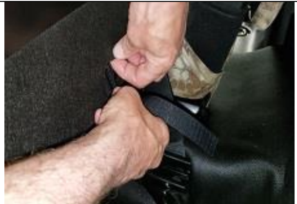
Step 18. Driver & Passenger Top/DT&PT: Disconnect the buckle Velcro™ from the cover. From behind the seat, lift the flap up that you detached earlier. Notice the two holes underneath the flap. Push the buckle Velcro™ the hole, clip facing the seat. Push on the hook while moving it up until it clicks, repeat for the other side.