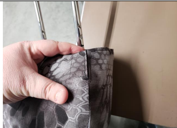
Step 13. Headrests/H: Connect the side Velcro™ as shown.