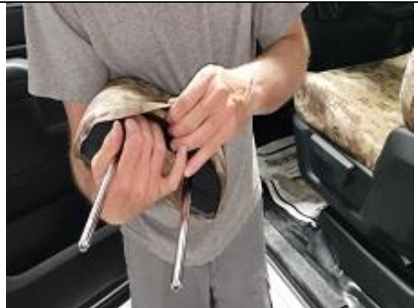
Step 14. Headrests/H: Tuck the front Velcro™ under the back edge and connect it to the loop Velcro™ sewn inside the back edge.