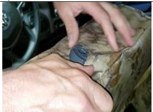
Step 20. Driver & Passenger Top/DT&PT: Tuck the fabric under the plastic for the headrests, starting on the push button side as shown.