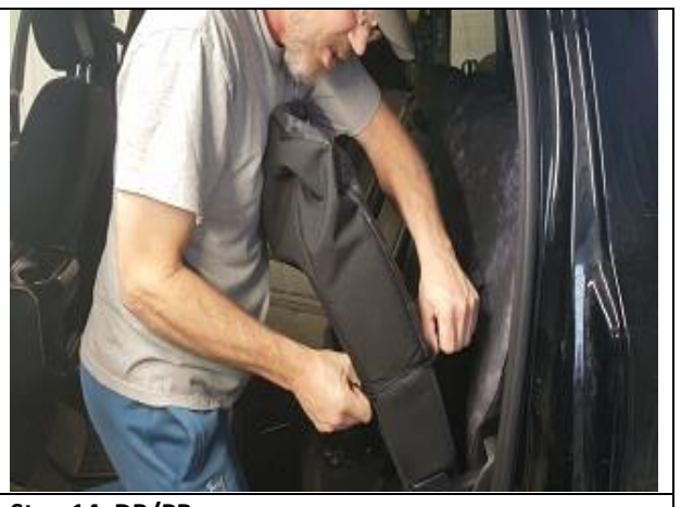
Step 14. DB/PB: Lift the seat up and pull the cover over the seat. Try a sawing motion to get it on.