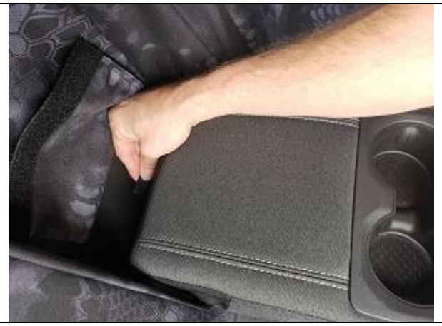
Step 21. PT:

Lay the arm down and grab the recently tucked Velcro. Pull tight and connect them to the loop Velcro that is located on the flap shown above.