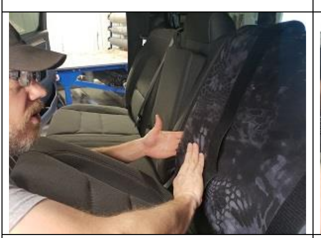
Step 7. DT:

Now work your way down the cover, tucking the edges around the seat. When you get to the bottom tuck the cover down through the space between the seat bottom and backrest.