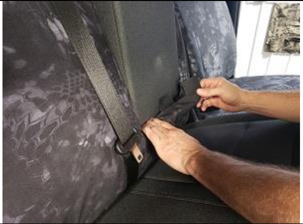
Step 20. PT: Now tuck the Velcro under the armrest into the encasement area behind the armrest.