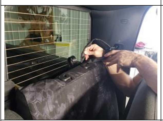
Step 11. DT:

Next, with the other hand, take the flap on the side of the seat that has some loop Velcro on it and press it against the hook Velcro that you just fed up the back.