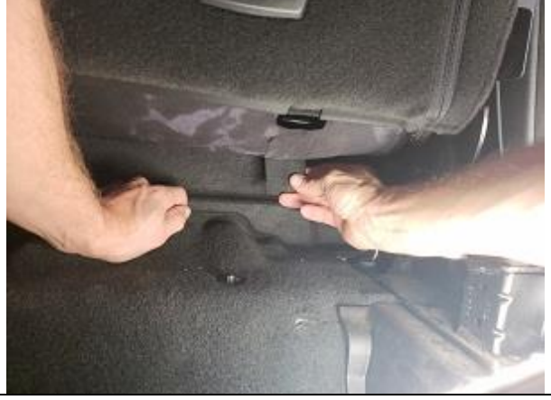
Step 12. DT:

Take the long Velcro's at the top of the cover and feed them down the back of the seat. It might be easier if you fold the in half long ways. This stiffens them up and can make it easier to feed down.