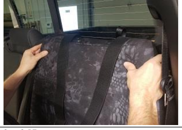
Step 6. DT: Fit the cover around the corners and get the cover into position.