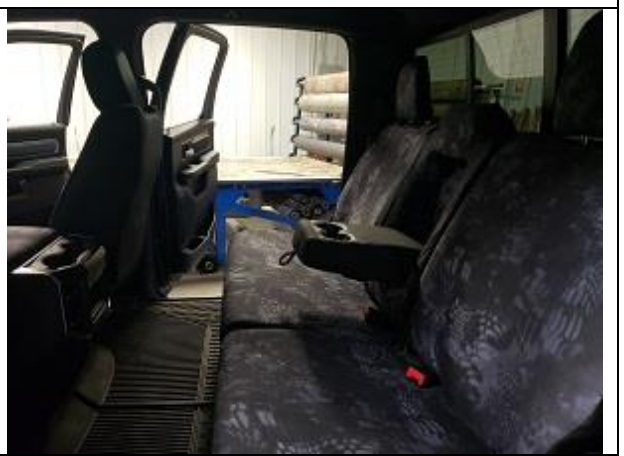
Step 24. Congrats!

Similar to the encasement from before, take the bottom of the arm cover and feed it through to the back of the arm. Then, take the top flap and connect the bottom with the top.