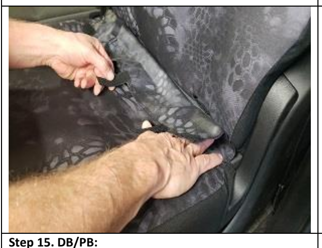
Once you get it on there, now is the time to position it. Make sure you line the seams on the sides of the seat up with the seams of the cover. Using a sweeping motion over the cover is the best way to get rid of wrinkles and adjust it. Now feed the top of the cover into the space between the backrest and seat bottom.