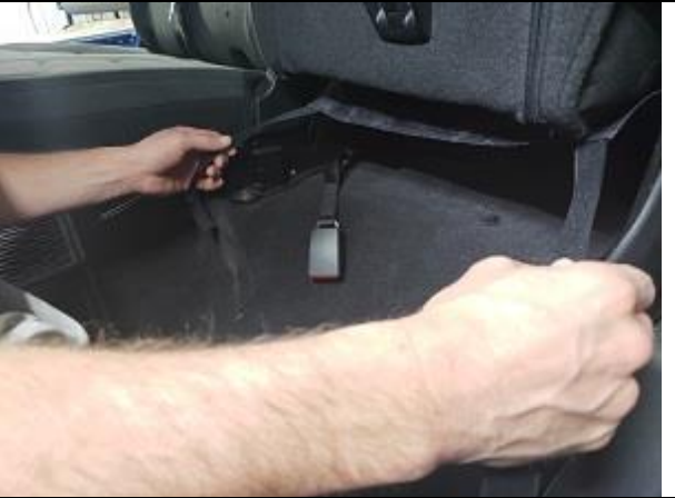
Step 8. DT:

Now work your way down the cover, tucking the edges around the seat. When you get to the bottom tuck the cover down through the space between the seat bottom and backrest.