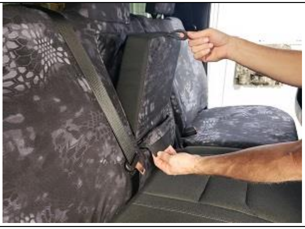
Step 22. A:

Lay the arm down and grab the recently tucked Velcro. Pull tight and connect them to the loop Velcro that is located on the flap shown above.