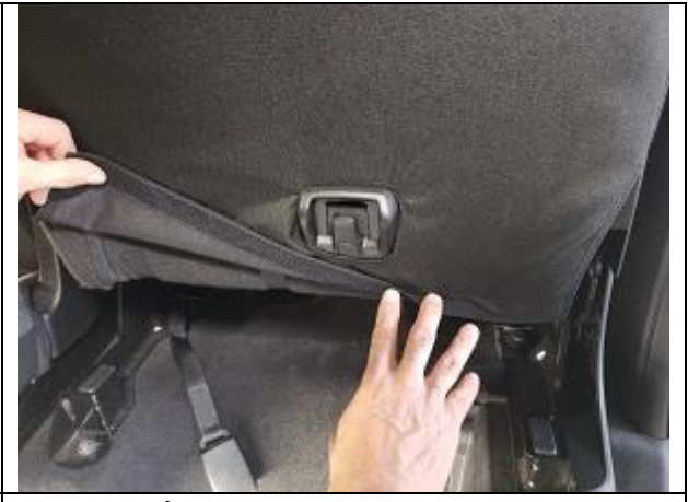
Step 18. DB/PB: Now take the bottom of the cover, pull tight and press the bottom of it to the fuzz too.