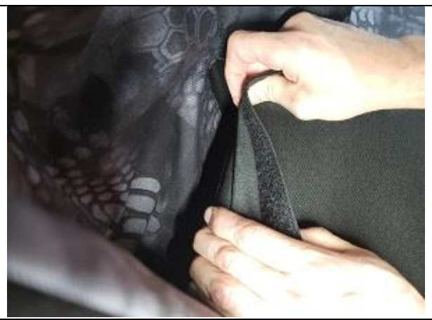
Step 23. A:

Slip the armrest cover over the arm. Make sure the opening is on the same side as the drink holders. Before you get the cover pulled tight find the pull tab at the front of your arm and push it through a provided opening at the very front of the cover. Then finish pushing the cover on.