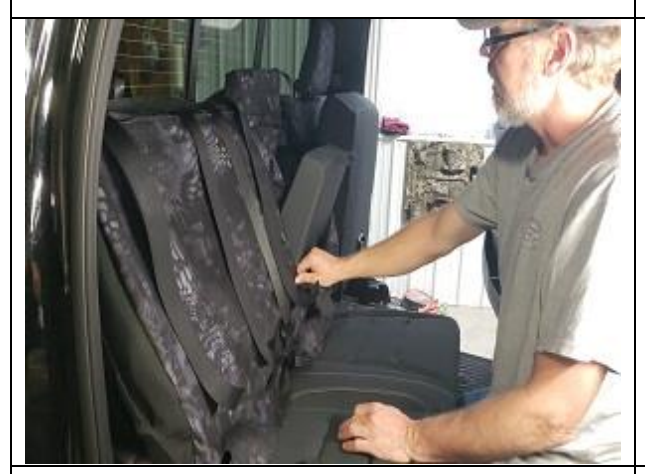
Step 19. PT: The passenger top install is very similar to the driver side, with the main difference being an armrest. Place the cover onto the backrest. As you are placing it on push the seat's armrest through the hole provided. Now follow steps #5-#13 and install the whole cover before starting with the armrest area.