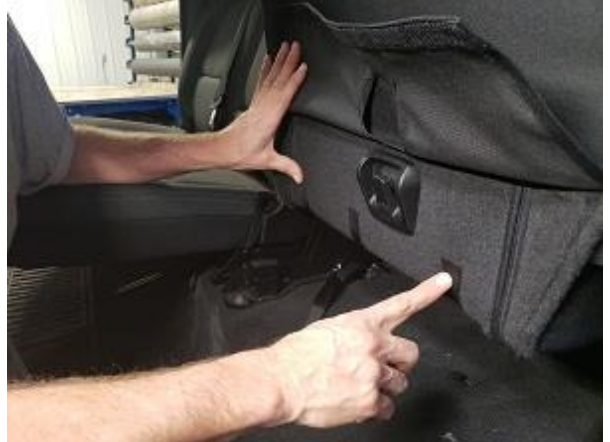
Step 16. DB/PB: Take the hook Velcro's extending from the top of the cover, pull tight on the material and press the Velcro's against the fuzz on the bottom of the seat.