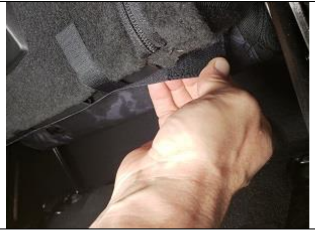
Step 17. DB/PB: Take the hook Velcro at the edges of the top, pull tight, and press them to the seat as well.