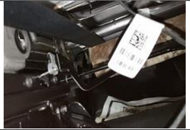
Step 17. Driver & Passenger Bottoms/DB&PB: Keep the Velcro™ up under the seat as much as possible.