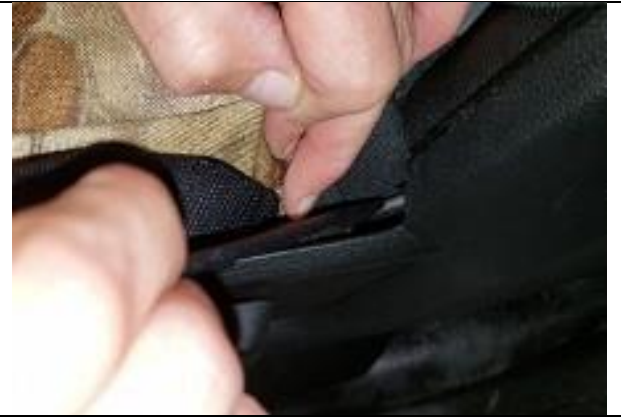
Step 15. Driver & Passenger Bottom: DB/PB Close up view of the driver's seat plastic molding. Fold the long hook (sticky) Velcro™ on the outside edge and fold it in half lengthwise with the sticky facing in. This stiffens it up making it easier to route. Push the seat in and away from the plastic, and push the Velcro™ straight down from where it's sewn on.