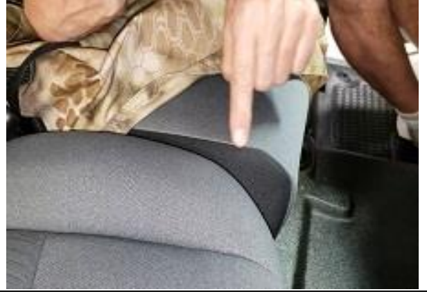
Step 3. Middle Bottom/MB:

View from under the back of the driver seat. The seat has a carpeted flap that wraps under the back edge. It's held in place by two elastic bands with plastic hooks attached. Follow the elastic with your hand under the seat, and push them forward to unclip. Note the areas they connected to the metal bar. Avoid routing Velcro™ across these areas when installing the seat cover bottoms.