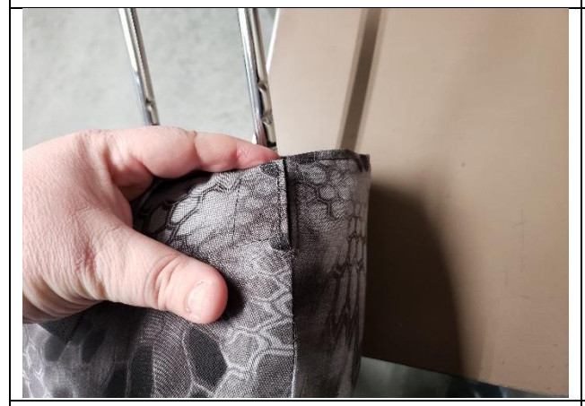
Step 23. Headrests/H: Connect the side Velcro™ as shown