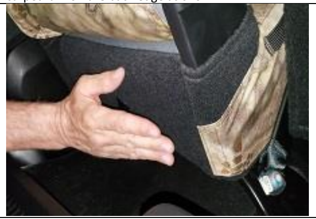
Step 7. Middle Bottom/MB:

Tuck the side hook Velcro™ in front of the metal brace down below, and route it at an angle to the back edge.