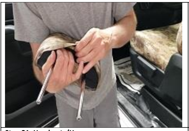
Step 21. Headrests/H: Tuck the front Velcro™ under the back edge and connect it to the loop Velcro™ sewn inside the back edge.