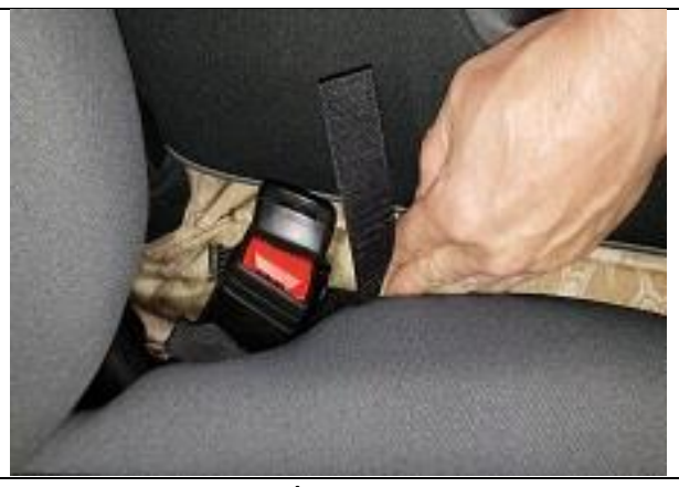
Step 6. Middle Bottom/MB:

Slide one hand down the side of the cover while pulling with the other hand on the back of the cover. With the cover tight, press the hook Velcro^{TM} to the carpet fuzz on the back edge as shown.