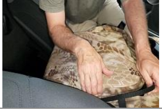
Step 12. Lid/L:

Fold the Velcro™ into the cavity and note where they will lay inside. Clean the areas with rubbing alcohol by scrubbing hard and wiping it dry while it's still wet. Pull the Velcro™ snug, then peel off the backing and press the adhesive Velcro™ onto the plastic. If the adhesive isn't sticking, clean the areas with warm soapy water, then rubbing alcohol again.