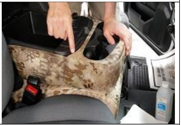
Step 8. Console/C:

Feel for the Velcro \!\!^{\mathsf{TM}} under the seat, then connect it to the fuzzy carpet on the back edge.