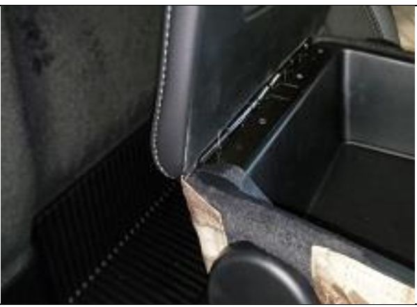
Step 10. Console/C:

Tuck the left and right sides behind the plastic molding, and pull the cover up into position, flush along the opening. Pull the back edge up to the hinge. Do this by using the same smoothing action in previous steps. Slide one hand down the front from top to bottom while pulling on the back edge of the console cover. Next, press the hook Velcro™ to the fuzzy carpet on the sides of the console in front and back of the hinge area as shown.