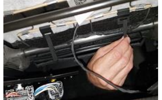
Step 29. Driver & Passenger Top/DT&PT: Re-connect the plastic clips under the seat.