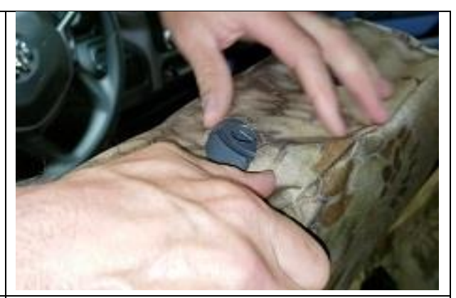
Step 26. Driver & Passenger Top/DT&PT: Tuck the fabric under the plastic for the headrests, starting on the push button side as shown. Slide the seat covers on with the extending hook Velcro™ to the front shown in Step 25. Tuck the fabric under the plastic on the outside edge of the seat.