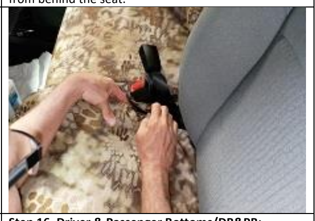
Step 16. Driver & Passenger Bottoms/DB&PB: As in Step 15, fold the hook Velcro™ in half, and push it down next to the middle seat. From behind the seat, locate the Velcro™ from the left and right sides and route them to the back edge. Use the same smoothing action from front to back while tightening the Velcro™, connecting them at an angle to the loop Velcro™ sewn on the back edge.