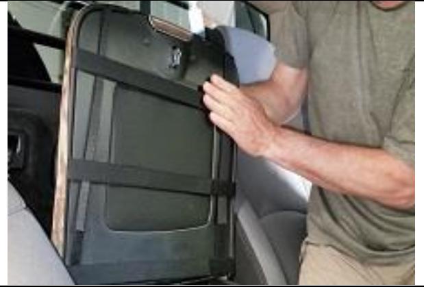
Step 13. Lid/L: Properly installed it should look like this photo