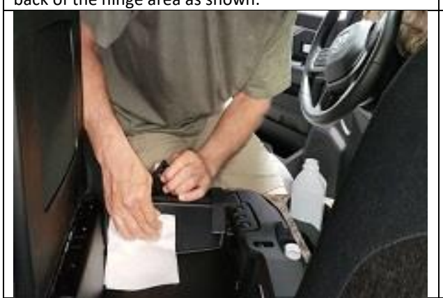
Step 11. Console/C:

Route the back edge loop Velcro™ between the lid and console next to the hinge as shown.