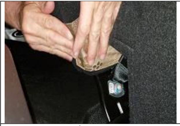
Step 5. Middle Bottom/MB:

Slide one hand down the side of the cover while pulling with the other hand on the back of the cover. With the cover tight, press the hook Velcro^{TM} to the carpet fuzz on the back edge as shown.