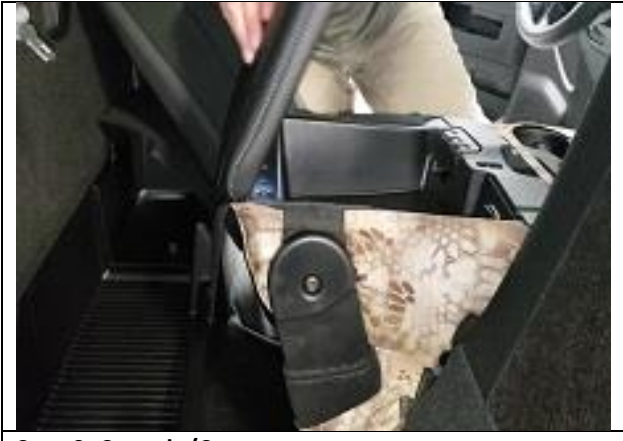
Step 9. Console/C:

Tuck the left and right sides behind the plastic molding, and pull the cover up into position, flush along the opening. Pull the back edge up to the hinge. Do this by using the same smoothing action in previous steps. Slide one hand down the front from top to bottom while pulling on the back edge of the console cover. Next, press the hook Velcro™ to the fuzzy carpet on the sides of the console in front and back of the hinge area as shown.