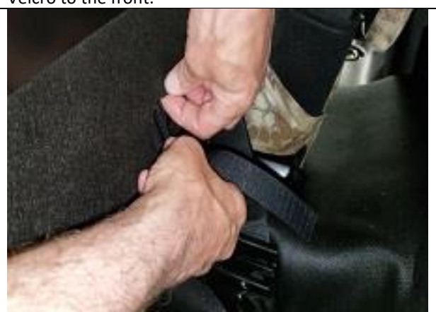
Step 24. Driver & Passenger Top/DT&PT: Disconnect the buckle Velcro™ from the cover. From behind the seat, lift the flap up that you detached earlier. Notice the two holes underneath the flap. Push the buckle Velcro™ the hole, clip facing the seat. Push on the hook while moving it up until it clicks, repeat for the other side.