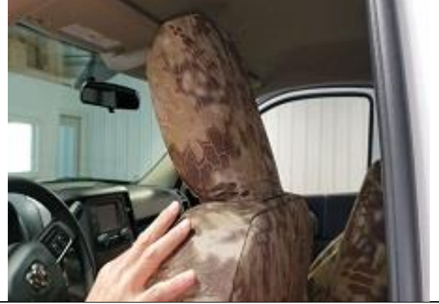
Step 20. Headrests/H: Slide the cover on with the headrest still on the seat with the extending Velcro™ to the front. Recline the backrests and depress the two push button releases shown while holding gentle upward pressure.