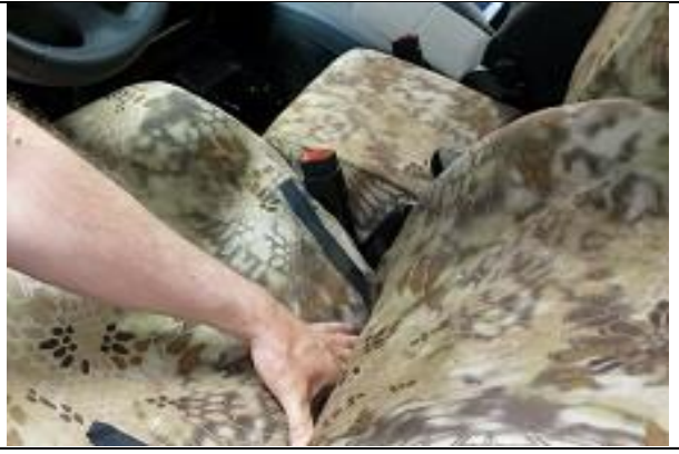
Step 25. Driver & Passenger Top/DT&PT: Provisions are made for the side impact airbags. It is critical to get the covers on the correct side. The covers are marked on the inside front right "DT & PT" for Driver & Passenger Top. Also note, the Driver Top has our Headwaters Seat Cover label on the backside.