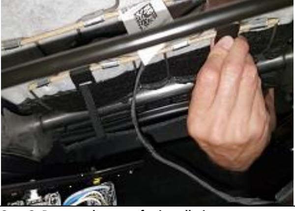
Step 2. Prepare the seats for installation:

The installation can be viewed on our YouTube channel at: https://youtu.be/EdniS-47WIQ