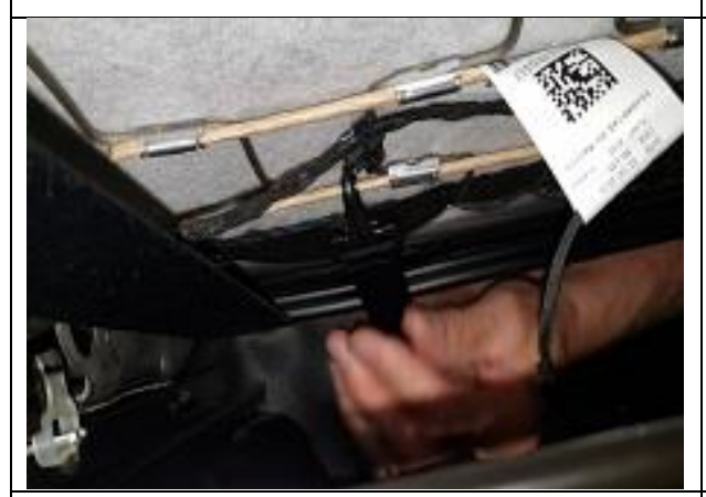
Step 19. Driver & Passenger Bottoms/DB&PB: Connect the plastic hooks under the back edge of the seat to the metal bar, and then press the hook Velcro™ to the loop Velcro™ sewn on the back edge. This will keep the seat cover from shifting around.