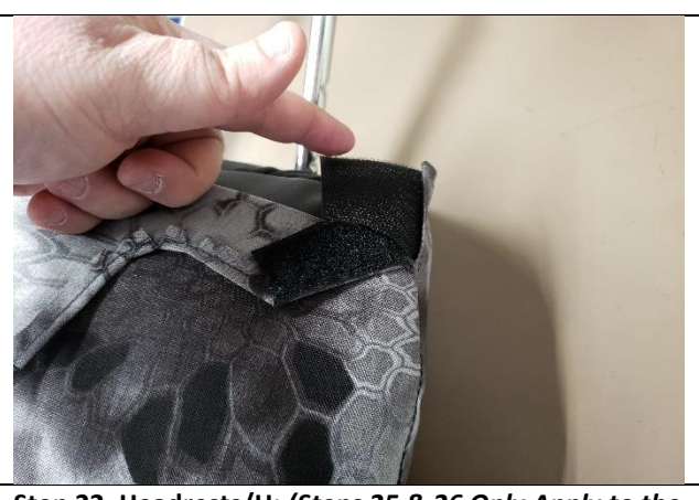
Step 22. Headrests/H: (Steps 25 & 26 Only Apply to the large variant of the "Thick Headrest") Carefully open the Velcro on bottom and side of the cover. Slide the cover on with the extending hook Velcro to the front.