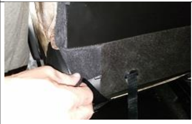
Step 28. Driver & Passenger Top/DT&PT: Using the same smoothing action, this time on the front outside edges while pulling on the angled Velcro™ shown. Connect the Velcro™ to the carpet fuzz on the back where shown.