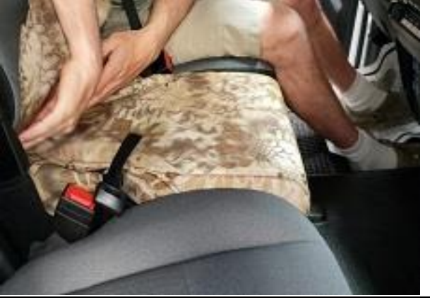
Step 4. Middle Bottom/MB:

These models have loop Velcro<sup>™</sup> sewn on the back.