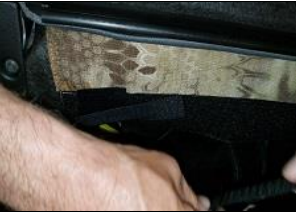
Step 18. Driver & Passenger Bottoms/DB&PB: Connect the long front edge hook Velcro™ to the loop Velcro™ sewn on the back edge. Using the same smoothing action, use one hand on top of the seat cover while pulling on the back of the seat cover, then connect the Velcro™.