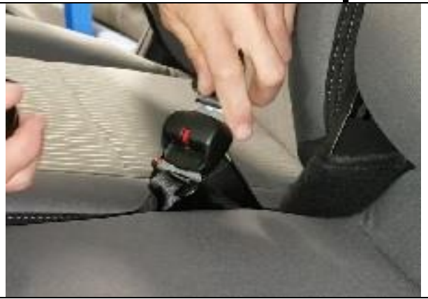
Step 1. Prepare the seats for installation:

Release the middle seatbelt by pushing in on the orange button shown until it disconnects.