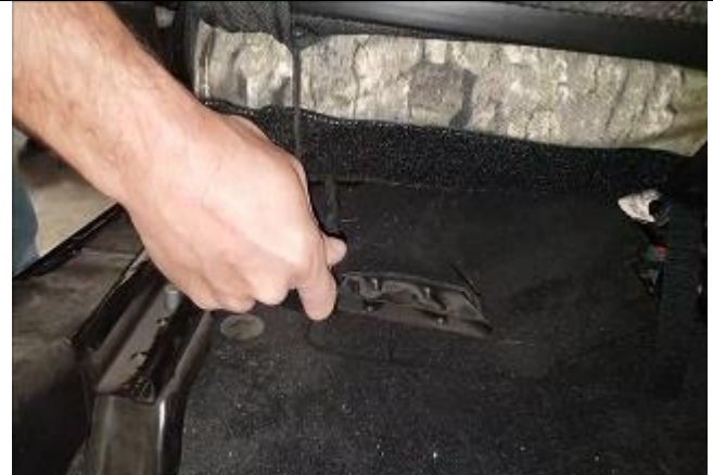
Step 9. Driver & Passenger Bottoms/DB&PB: Reach behind the seat and pull the cover down tight. This will help form the cover on the rest of the seat.