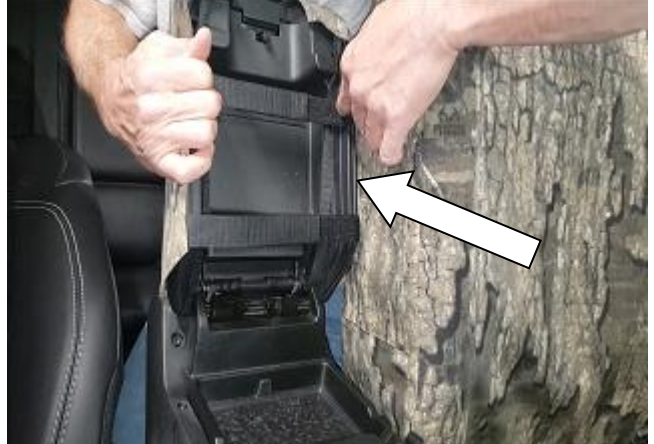
Step 25. Lid/L: Open just the top section of the lid and connect the Velcro. Make sure the horizontal Velcro are loose enough to fit into the crevasses. If they are too tight, your lid will not shut. The vertical Velcro can be tightly fastened.