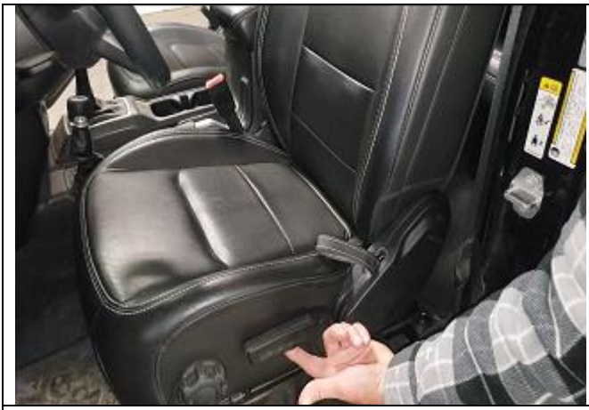
Step 1. Prep: Lift your seat up as much as possible. This will give you a little extra room to work with.