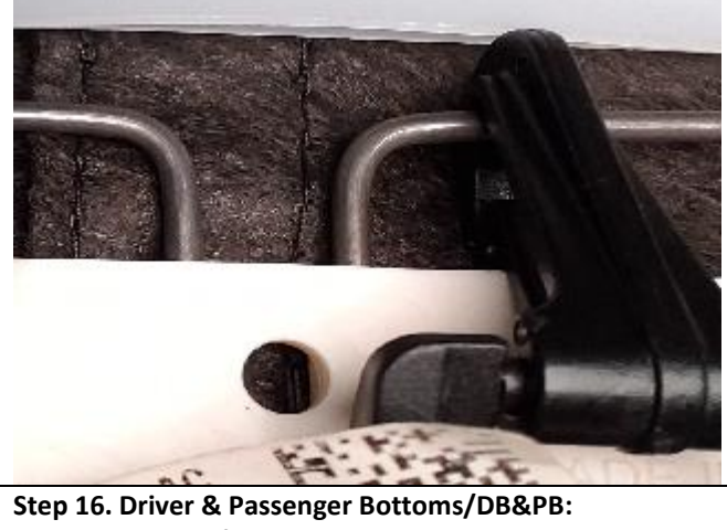
Step 16. Driver & Passenger Bottoms/DB&PB: Take the buckles from earlier and clip them onto the metal bars under the seat. Hook them around the bars toward the center of the seat. Then pull them tight and connect them to the flap.