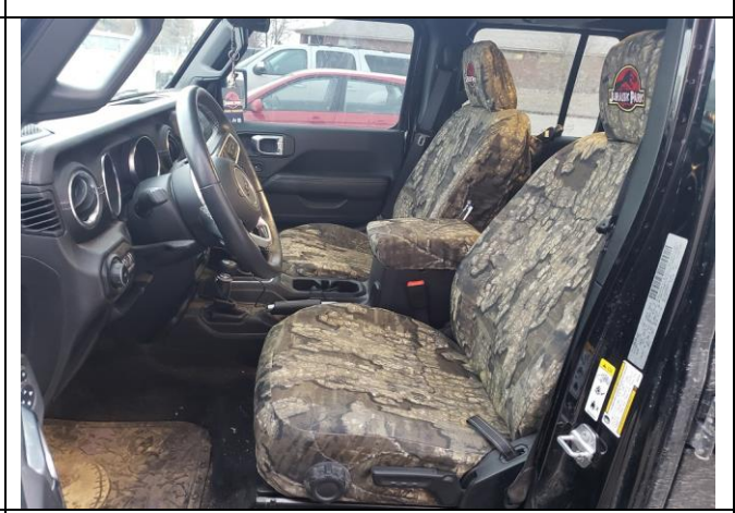
Congratulations! Your cover is now installed! If you need any more install help, please reference or install video at: https://youtu.be/LnwL7Lgv4IE

Disconnect the Velcro and set it over the lid with the "L" at the back of the lid.