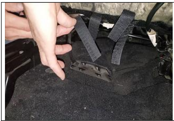
Step 17. Driver & Passenger Bottoms/DB&PB: Cut off any excess Velcro. Be careful not to cut any wires or the cover itself.