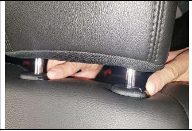
Step 2. Prep: Take your headrests off by pushing both buttons on the peg plastics and pulling the headrest up.

Reach under your seats from behind. You'll feel 2 loops of elastic looped over some hooks. Pull the elastics off the hooks and lift your back panel up.