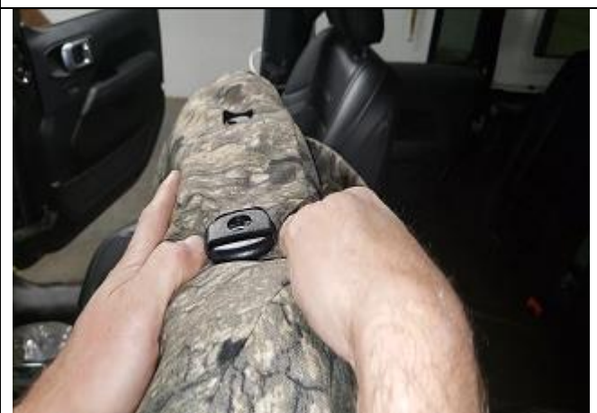
Step 19. Driver & Passenger Tops/DT&PT: Poke the headrest plastics through the holes at the top of the cover.

Step 18. Driver & Passenger Tops/DT&PT: Detach any Velcro and save the buckles for later. Take the top covers and pull them over the backrests. These pieces are labeled DT and PT but if you aren't sure, the driver top has our logo on it. Pull the covers down all the way making sure to match the seats of the cover with the seams of the seat.