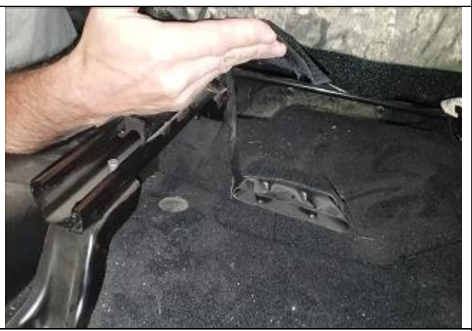
Step 14. Driver & Passenger Bottoms/DB&PB: Then grab the Velcro, pull tight and connect it to the seat cover.