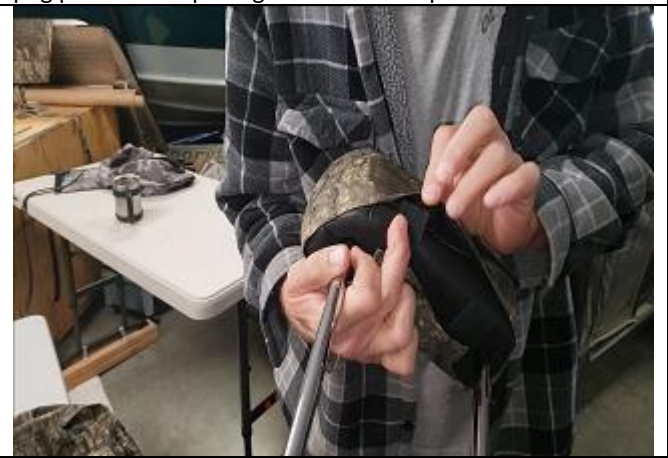
Step 4. Headrests/H: All our pieces are labeled on the inside of the piece. Each having a letter representing the piece. Find the H (Headrests) and slide them over your headrests with the extending Velcro on the front. Wrap the flap under the headrest and connect it to the Velcro on the underside of the back.