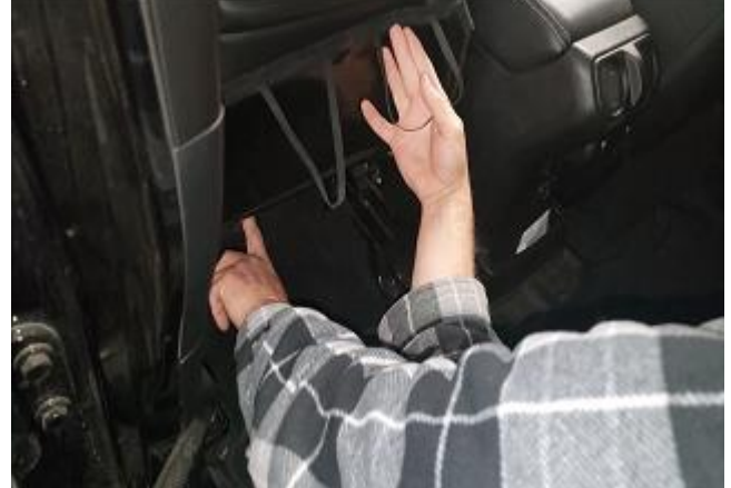
Step 3. Prep:

Reach under your seats from behind. You'll feel 2 loops of elastic looped over some hooks. Pull the elastics off the hooks and lift your back panel up.