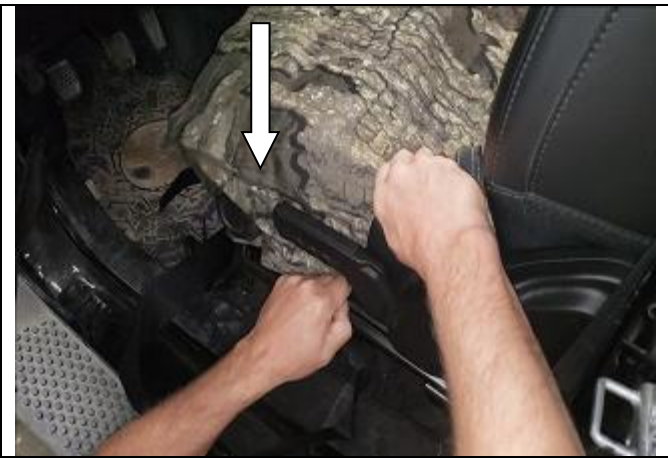
Step 6. Driver & Passenger Bottoms/DB&PB: Place the rest of the cover over the seat. Make sure to match the seam of the seat cover to the outside seam of the seat.