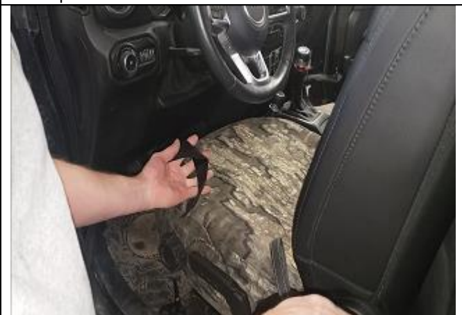
Step 10. Driver & Passenger Bottoms/DB&PB: Take the long Velcro on the front of the cover and fold them in half long ways. This will stiffen them up and make it easier to feed under the seat.