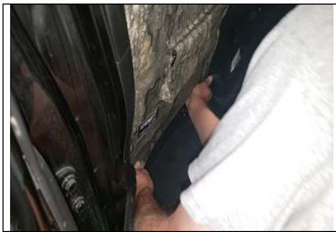
Step 23. Driver & Passenger Tops/DT&PT: Take the elastics from step 3 and reconnect them under the seat. Now take the back of the cover and pull it down tight and connect it to the fuzz on your seat.