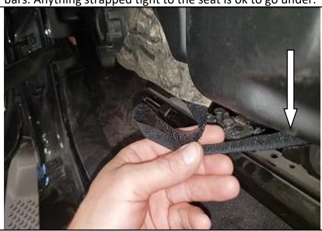
Step 13. Driver & Passenger Bottoms/DB&PB: Take the Velcro on the door side of the seat and feed it under the seat between the seat and rails.