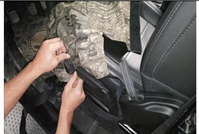
Step 5. Driver Bottoms/DB: Before putting the cover on, disconnect any Velcro. Take the 2 buckles and save them for later. There is a cut out on the driver bottom for the lumbar knob. Fit the cover under one side of the knob then pull it over the rest. It's going to be tight so the material will suck in behind the knob.