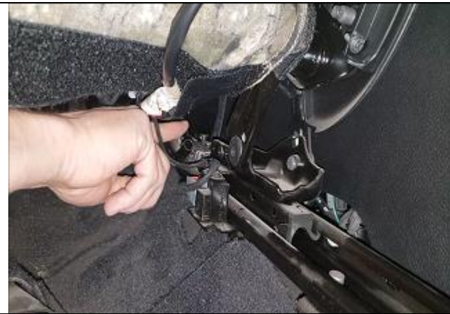
Step 15. Driver & Passenger Bottoms/DB&PB: Repeat the same process for the Velcro that is on the inside side of the cover.