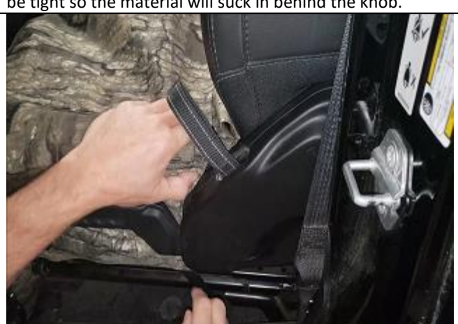
Step 7. Driver & Passenger Bottoms/DB&PB: Tuck the cover behind the plastic on the outside edge of the seat.