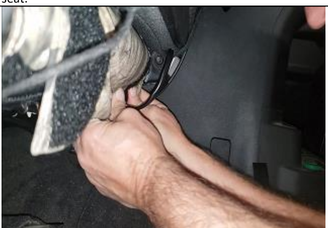
Step 20. Driver & Passenger Tops/DT&PT: Take the front flap and tuck it in-between the backrest and bottom. Then go behind the seat and pull it tight.

*Important: Make sure you poke them through starting on the push button side. If you go the other way, you risk braking the plastic.