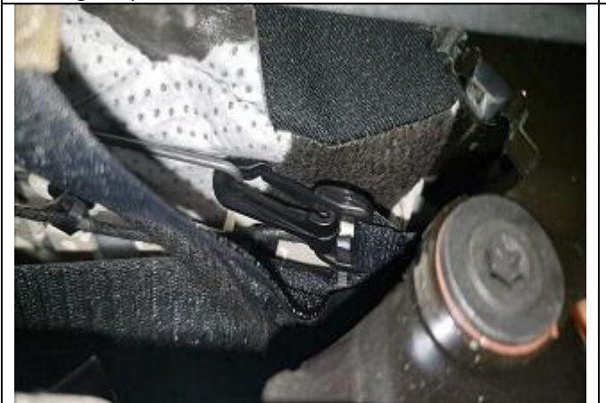
Step 21. Driver & Passenger Tops/DT&PT: Take the buckles and hook them to the metal bars under the seat, toward the edges of the seat.