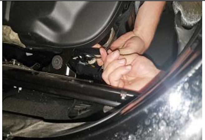
Step 22. Driver & Passenger Tops/DT&PT: Take the buckle Velcro and connect it to the loop Velcro on the flap you pulled through the seat.