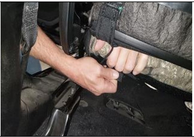
Step 12. Driver & Passenger Bottoms/DB&PB: Pull the seat cover tight and connect the front Velcro to the flap.

Step 11. Driver & Passenger Bottoms/DB&PB: Feed the Velcro under the seat and toward the back of the seat. Make sure to go over any loose wires or low hanging bars. Anything strapped tight to the seat is ok to go under.