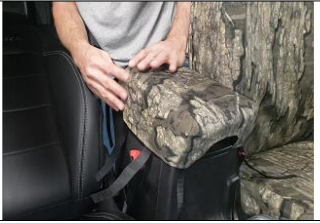
Step 24. Lid/L:

Disconnect the Velcro and set it over the lid with the "L" at the back of the lid.