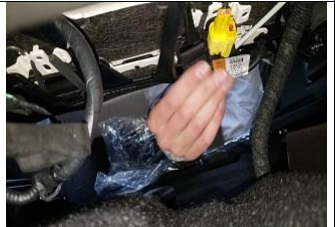
Step 16. DB/PB: Driver and Passenger Bottoms Under your seat there are several little bars that you can hook the buckles to. Focus toward the center of the seat and clip them on.