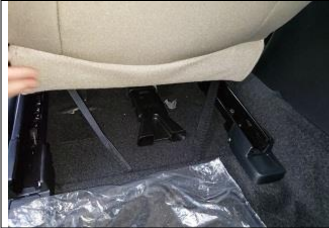
Step 13. DB/PB: Driver and Passenger Bottoms Take the side Velcro and pull both of these tight. This will pull the sides of your cover down.