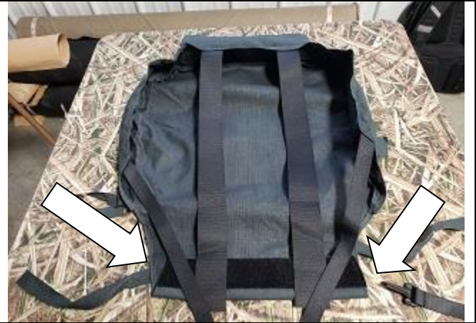
Step 14. DB/PB: Driver and Passenger Bottoms Once again, you will need to pull them into the space between flap and seat. Connect them to the outside edge of the loop Velcro as shown.