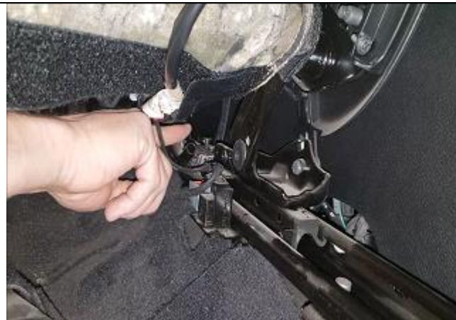
Step 15. Driver & Passenger Bottoms/DB&PB: Repeat the same process for the Velcro that is on the inside side of the cover.