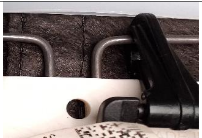
Step 16. Driver & Passenger Bottoms/DB&PB: Take the buckles from earlier and clip them onto the metal bars under the seat. Hook them around the bars toward the center of the seat. Then pull them tight and connect them to the flap.