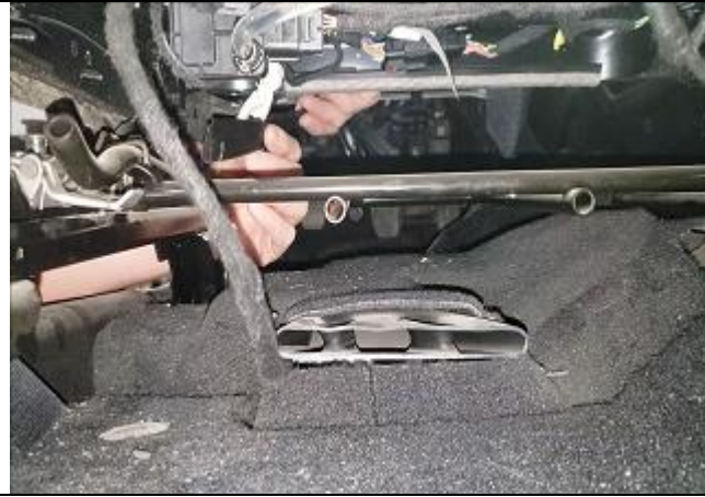
Step 11. Driver & Passenger Bottoms/DB&PB: Feed the Velcro under the seat and toward the back of the seat. Make sure to go over any loose wires or low hanging bars. Anything strapped tight to the seat is ok to go under.