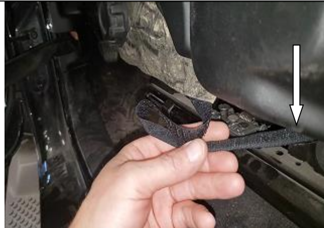
Step 13. Driver & Passenger Bottoms/DB&PB: Take the Velcro on the door side of the seat and feed it under the seat between the seat and rails.