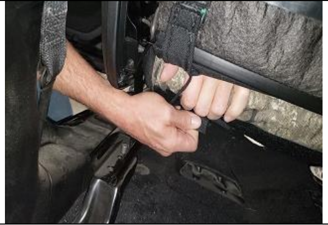
Step 12. Driver & Passenger Bottoms/DB&PB: Pull the seat cover tight and connect the front Velcro to the flap.