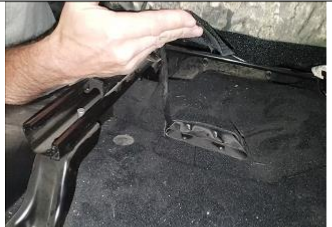
Step 14. Driver & Passenger Bottoms/DB&PB: Then grab the Velcro, pull tight and connect it to the seat cover.