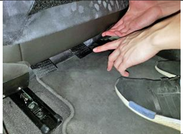
Step 18. DT/PT: Driver & Passenger Tops From behind the seat, pull the cover thru. Form the cover to the top of the seat and use the same smoothing action from top to bottom while gently pulling on the Velcro from behind the seat. Connect the left and right side Velcro first, sliding your hand down the front, taking up slack. Connect the center Velcro last, making sure to not over tighten it creating wrinkles on the front left and right.