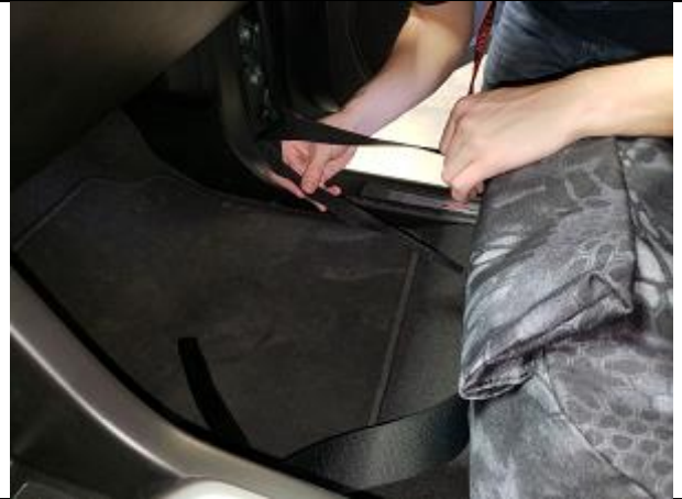
Step 6. DB/PB: Driver & Passenger Bottoms Fold the long hook Velcro in half lengthwise with the sticky facing in. This will stiffen them up and make it easier to route.