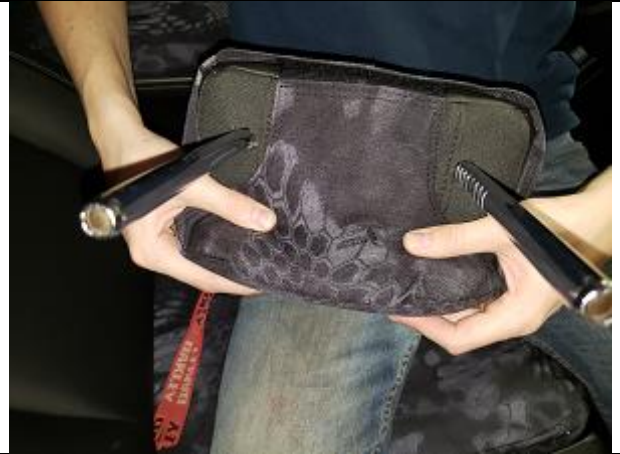
Step 14. H: Headrests Leave enough slack in the cover to allow the headrest to sit flush to the seat if needed.