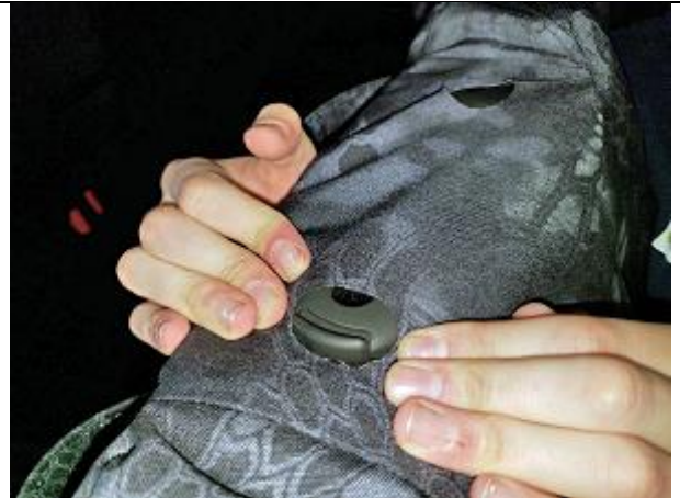
Step 16. DT/PT: Driver & Passenger Tops Tuck the fabric under the plastic for the headrests, starting with the push button side first as shown.