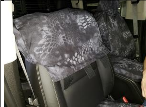
Step 15. DT/PT: Driver & Passenger Tops Provisions are made for the Side Impact Airbags. It is critical to get the covers on the proper seat to allow the airbag to function. The Driver Top has "DT" printed on the inside right front corner, PT is for the Passenger Top. Slide the covers on with the extending hook Velcro to the front. Line up the seams of the seat cover to the seams of your seat on left and right, they should match closely.