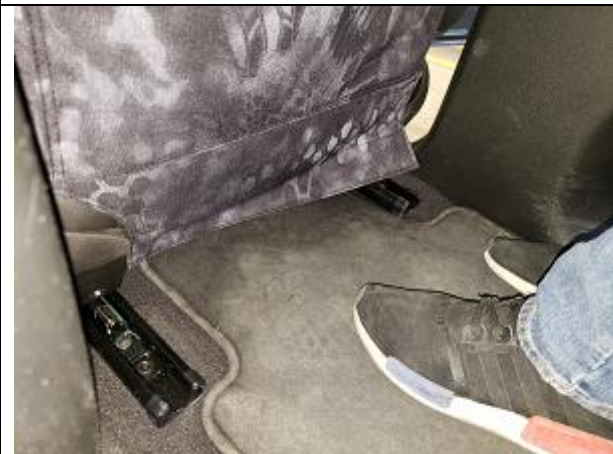
Step 19. DT/PT: Driver & Passenger Tops The completed task should look like the picture.