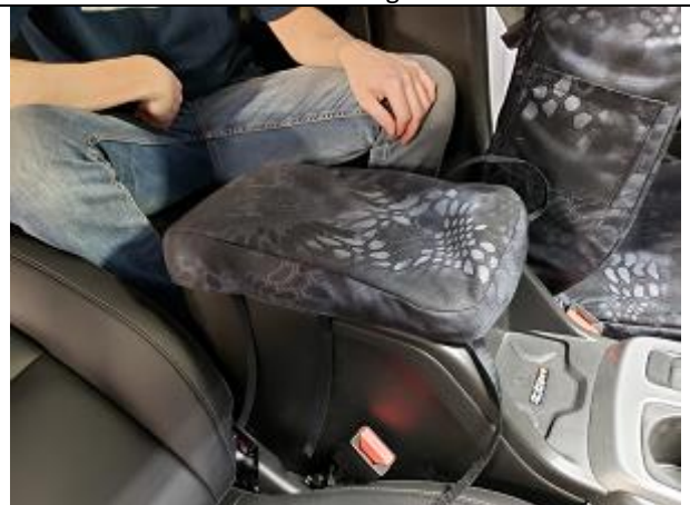
Step 20. L: Lid Carefully disconnect the Velcro and place the cover on with the "L" printed on the inside to the back.