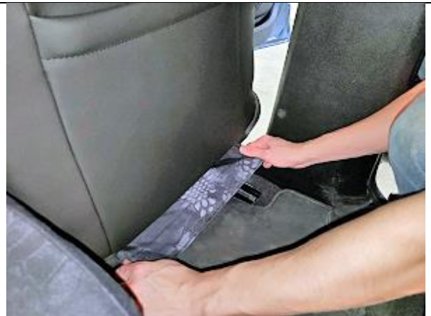
Step 8. DB/PB: Driver & Passenger Bottoms Pull the cover snug from behind the seat. Use one hand in a smoothing action on the seating area, and both sides as you pull, taking up slack and forming the cover to the front and sides of the seat bottom. Look at the placement of the seat cover. Adjust/line up the seams of the seat cover to the seams of your seat, they should match closely.