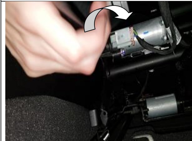
Step 7. DB/PB: Driver & Passenger Bottoms For electric controlled seats, route the Velcro over the top of the motor between the seat and the motor.