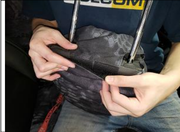
Step 13. H: Headrests Connect the Velcro at the back edge of the headrest.