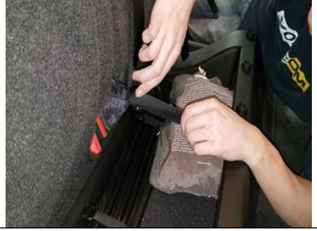
Step 4. DB/PB: Driver & Passenger Bottoms On the sides of your cover you will notice some shorter Velcro straps. Take these, pull tight and paste them to the underside as well.