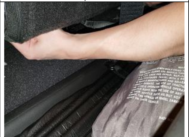
Step 3. DB/PB: Driver & Passenger Bottoms Now, fold the seat up and reach for the Velcro you just tucked to the back. Pull the material tight and paste the Velcro to the fuzzy carpeting that is on the underside of your seat.

If you have holes in your covers for child restraints, make sure you line the holes up with the restraints.