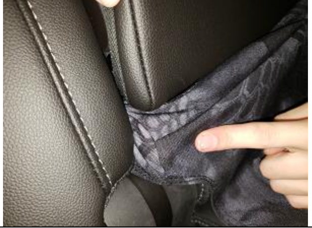
Step 16. DT: Driver Top Before you go to the back of the cover, you need to check your corners. Make sure the bottom corners of the front portion are pulled around the edges correctly.

you start pulling it through on the push button side. If you start on the other side, it will put a bunch of pressure on the button and potentially brake it.