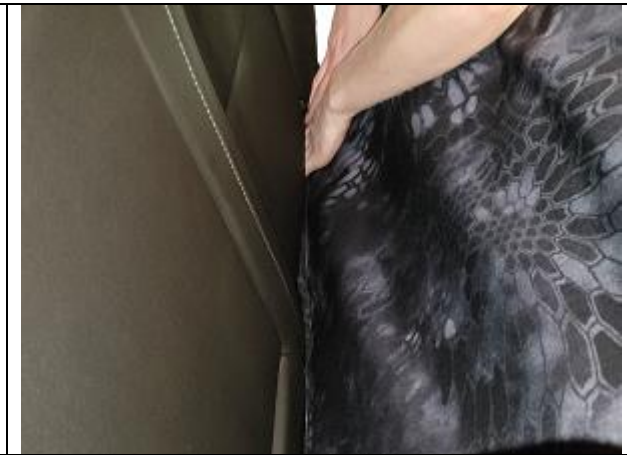
Step 2. DB/PB: Driver & Passenger Bottoms Take the top flap and tuck it in-between the backrest and seat bottom.

Step 1. DB/PB: Driver & Passenger Bottoms All pieces are marked with a letter on the inside of the cover. There will be a sheet provided that shows what each letter belongs to. Disconnect the Velcro and lay the cover out on the seat. Start to form the cover to the seat. Make sure to match the seams of the cover with the seams of your seat.