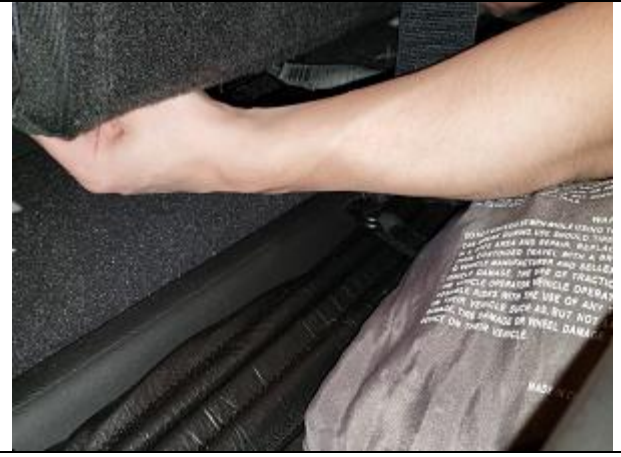
Step 3. DB/PB: Driver & Passenger Bottoms Now, fold the seat up and reach for the Velcro you just tucked to the back. Pull the material tight and paste the Velcro to the fuzzy carpeting that is on the underside of your seat.

If you have holes in your covers for child restraints, make sure you line the holes up with the restraints.