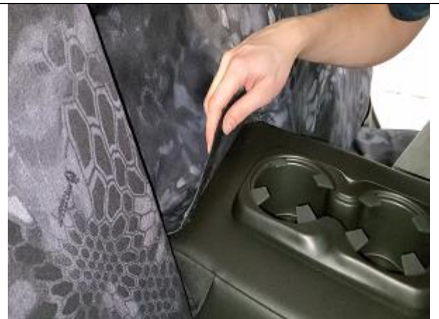
Step 22. DT: Driver Top Above the arm is another flap. This needs to be shoved down behind the arm and attach to the extending Velcro from the bottom flap.