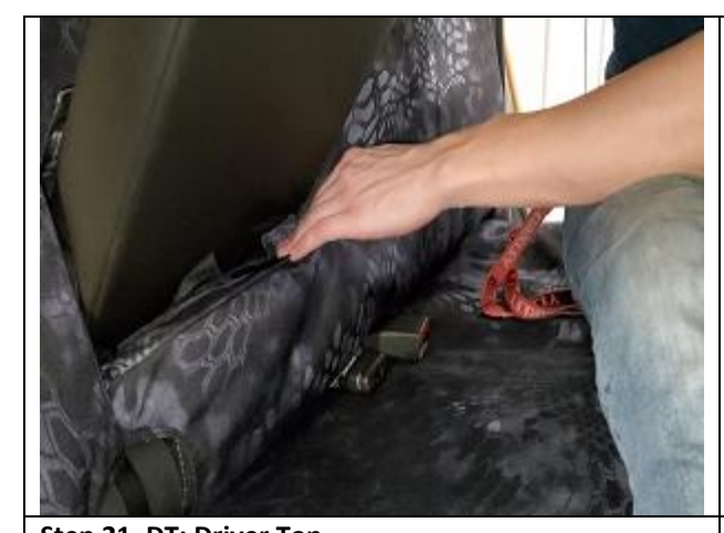
Step 21. DT: Driver Top Flip your seats back up. Under the armrest is some extending Velcro that needs to be tucked under and behind the armrest. Lay the Velcro flat against the back of the arm encasement.