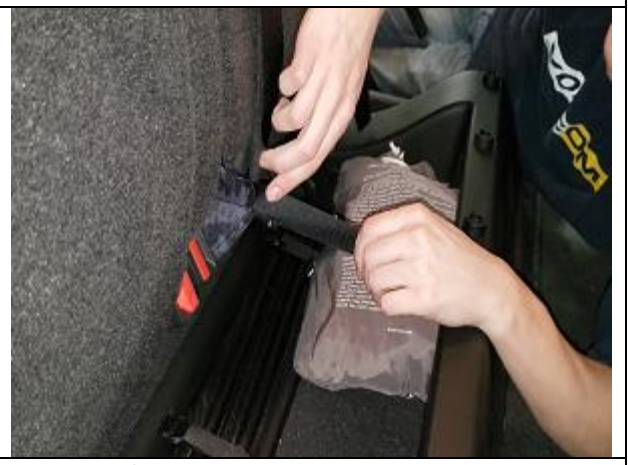
Step 4. DB/PB: Driver & Passenger Bottoms On the sides of your cover you will notice some shorter Velcro straps. Take these, pull tight and paste them to the underside as well.