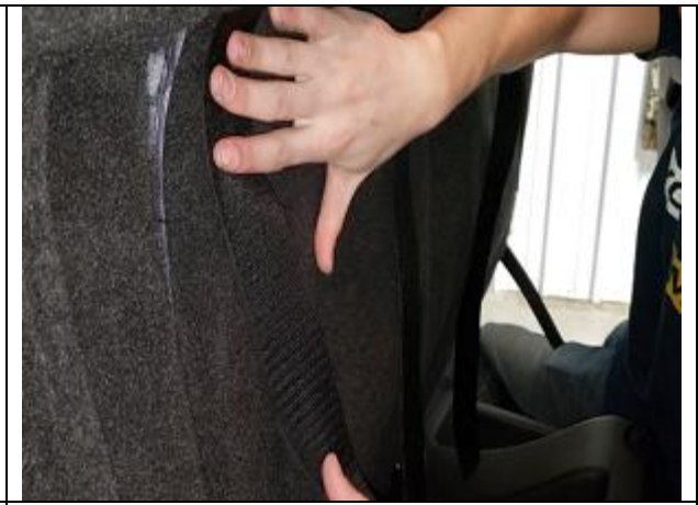
Step 6. DB/PB: Driver & Passenger Bottoms Lastly, you'll want to take the long Velcro hanging off the front of the cover and attach them. Make sure to pull them nice and tight. As you attach them to the carpeting make sure you follow the groove on the underside of the seat. This will allow the seat to set down correctly.