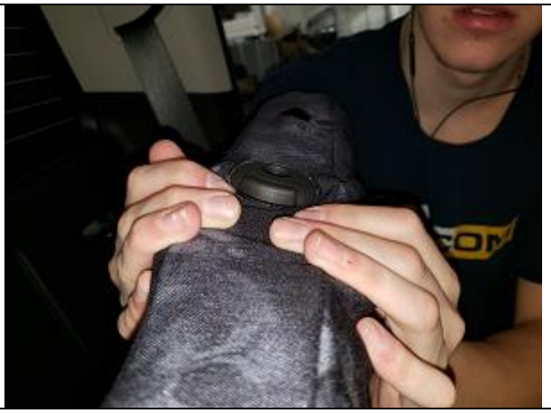
Step 14. DT & PT: Driver & Passenger Tops Once the cover is pulled down, the plastic headrest slots can be slipped through.

If you don't do this and latch your seat to the cab again. It will be very difficult to get the tab out from under the cover.