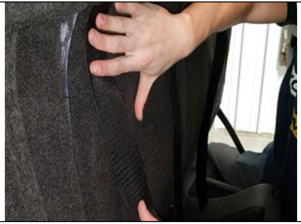
Step 6. DB/PB: Driver & Passenger Bottoms Lastly, you'll want to take the long Velcro hanging off the front of the cover and attach them. Make sure to pull them nice and tight. As you attach them to the carpeting make sure you follow the groove on the underside of the seat. This will allow the seat to set down correctly.