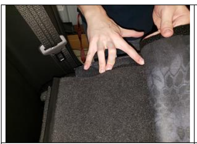
Step 17. DT: Driver Top

On the door side of the cover, you'll find Velcro extending off of the side. Pull the side down and fold the extending Velcro to the back. While holding the Velcro, take the back flap and lay it onto the Velcro, connecting them. The Velcro should be completely covered.