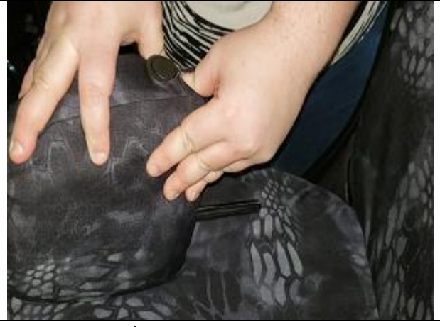
Step 10. H: Headrests

Once you get the cover where it needs to be, take the extending Velcro and connect it to the Velcro on the opposite side.