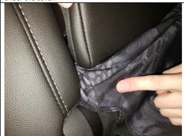
Step 15. DT: Driver Top Before you go to the back of the cover, you need to check your corners. Make sure the bottom corners of the front portion are pulled around the edges correctly.

IMPORTANT: On the push button plastic, make sure you start pulling it through on the push button side. If you start on the other side, it will put a bunch of pressure on the button and potentially brake it.