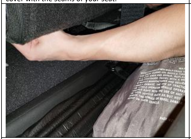
Step 3. DB/PB: Driver & Passenger Bottoms Now, fold the seat up and reach for the Velcro you just tucked to the back. Pull the material tight and paste the Velcro to the fuzzy carpeting that is on the underside of your seat.

If you have holes in your covers for child restraints, make sure you line the holes up with the restraints.