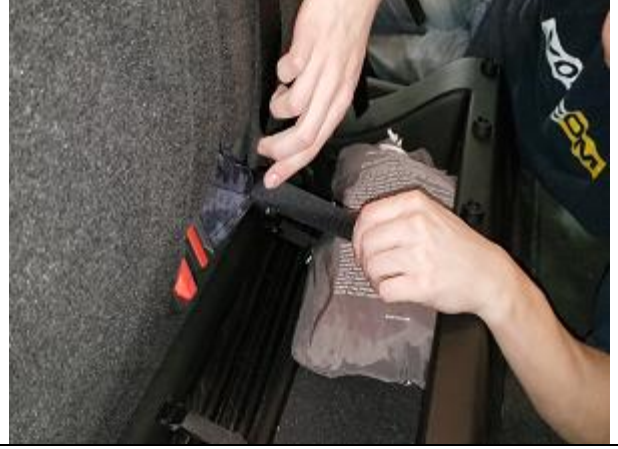
Step 4. DB/PB: Driver & Passenger Bottoms On the sides of your cover you will notice some shorter Velcro straps. Take these, pull tight and paste them to the underside as well.