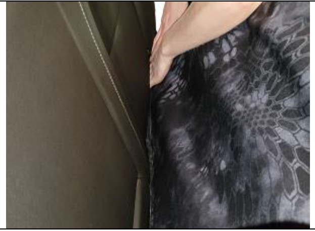
Step 2. DB/PB: Driver & Passenger Bottoms Take the top flap and tuck it in-between the backrest and seat bottom.

If you have holes in your covers for child restraints, make sure you line the holes up with the restraints.