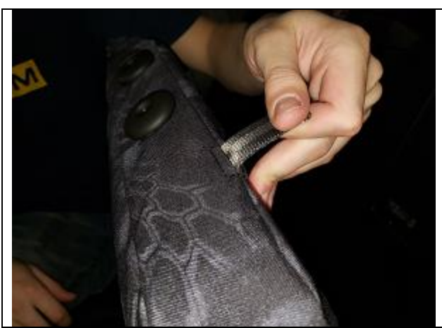
Step 13. DT: DT & PT: Driver & Passenger Tops Once the cover is over the other edge start pulling it down.

IMPORTANT: Before you get the cover all the way down, make sure you find your pull tab. Take the tab and fish it through a small opening at the top of the cover.