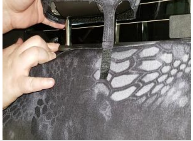
Step 8. H: Headrests Lift the headrests up a bit and push the button on the plastic ring around the pegs. Lift until the headrest is released. If you don't have enough room to get the headrest out, just push the button on the side of the headrest to make your headrest topple. Making it easier to pull out.