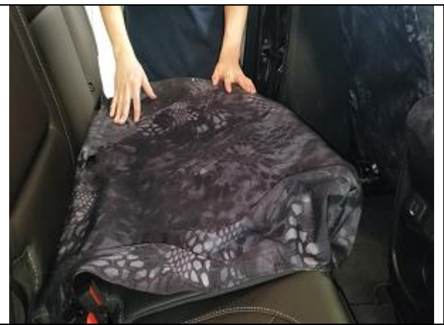
Step 1. DB/PB: Driver & Passenger Bottoms All pieces are marked with a letter on the inside of the cover. There will be a sheet provided that shows what each letter belongs to. Disconnect the Velcro and lay the cover out on the seat. Start to form the cover to the seat. Make sure to match the seams of the cover with the seams of your seat.