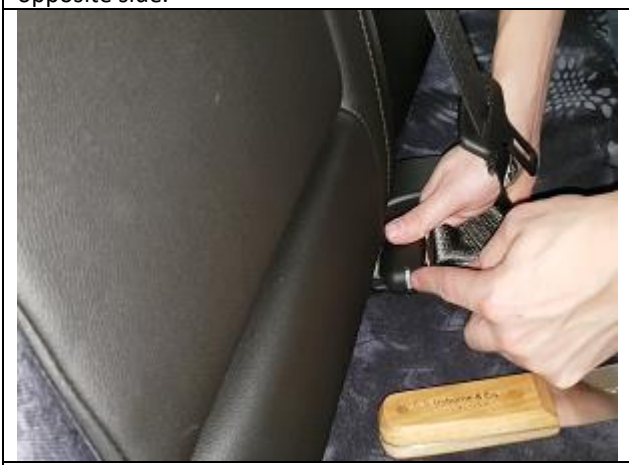
Step 11. DT: Driver Top

Flip the headrest over to the button side. Push down on the material around the button and it should slip right underneath the plastic