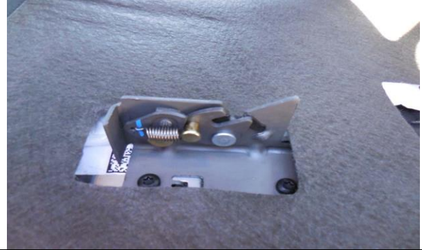
Step 6. Driver Top/DT&PT: Release the driver side backrest by lifting the seat bottom up all the way. Feel behind the driver seat top outside edge, in and down about six inches. Directly on the opposite side of the brass pin shown there is a silver pin same size. Use a small close end wrench to hook and lift it up. You'll hear a click and the will seat release. The passenger side backrest has an exposed nylon release strap that can be seen on Step 10.