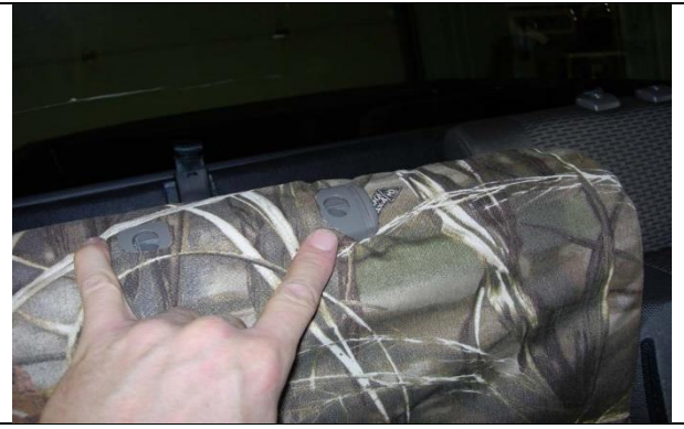
Step 7. Driver & Passenger Top/DT&PT: Tuck the seat cover under the plastic for the headrests starting with the push button release.