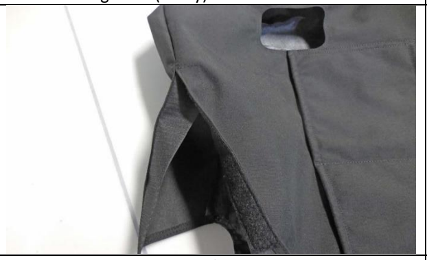
Step 3. Passenger Bottoms/PB: Carefully open the side Velcro™ on the Passenger Bottom as shown.