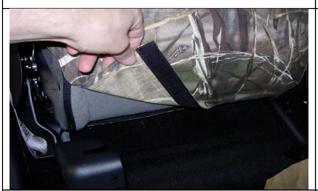
Step 5. Driver & Passenger Bottoms/DB&PB: Passenger Bottom: Re-connect the side Velcro™ from Step 3. Tuck in the top side, pull it tight and press the hook Velcro™ to the fuzzy carpet on the back edge of the seat. Lastly pull the bottom side tight and press it to the fuzzy carpet under the seat.