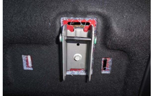
Step 12. Driver & Passenger Top/DT&PT: Make sure the driver side back wall catch is positioned where shown. Lift the driver side seat bottom up all the way and push the backrest in until you hear it click back in. This may take a few tries.