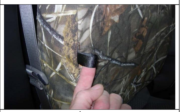
Step 10. Passenger Top/PT: Feed the nylon seat release trap through the provided opening.