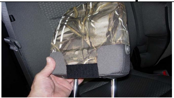
Step 1. Headrests/H: Video of the Install: <a href="https://youtu.be/ID7AZyACWyg">https://youtu.be/ID7AZyACWyg</a> All the parts of the seat cover are labeled inside on the bottom right side. Slide the headrest covers on with the extending hook (sticky) Velcro™ to the front.