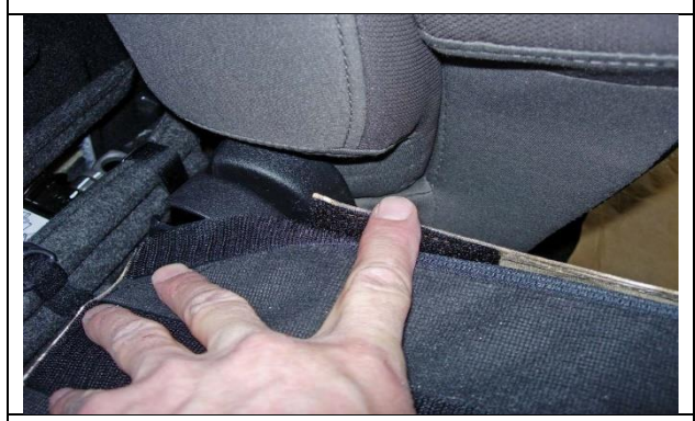
Step 9. Driver & Passenger Top/DT&PT: Connect the outside edge hook Velcro™ to the loop Velcro™ sewn inside the seat cover on the left and right side.