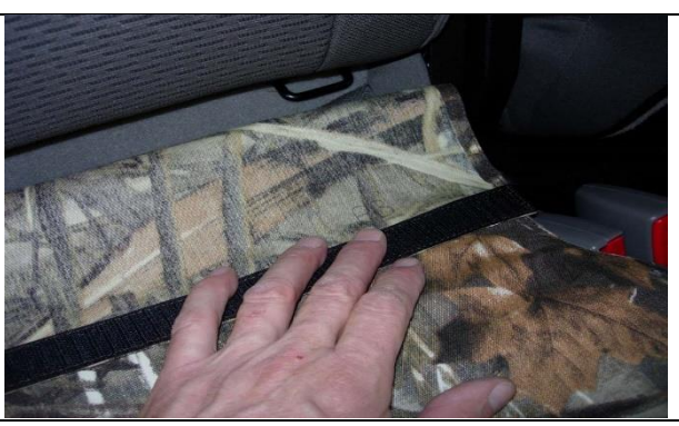
Step 4. Driver & Passenger Bottoms/DB&PB: Slide the seat covers on with the letters DB & PB to the top. Line up the seams of the seat cover to the seams of the seat, and line up the opening for the seat release latch as shown.