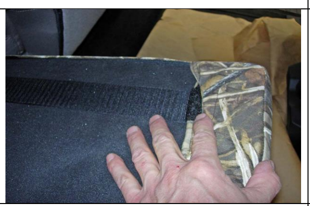
Step 11. Driver & Passenger Top/DT&PT: Connect the long hook Velcro™ to the loop Velcro™ sewn inside the top edge as shown. Do this by gently pulling on the long hook Velcro™ with one hand while using the other hand in a smoothing action down the front of the seat from top to bottom.