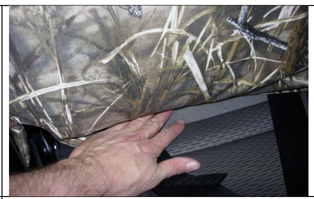
Step 8. Driver & Passenger Top/DT&PT: Tuck in the front edge of the seat cover and fold the backrest forward. Make sure to pull the cover down far enough that the rounded bottom left and right corners are forming to the bottom of the backrest.