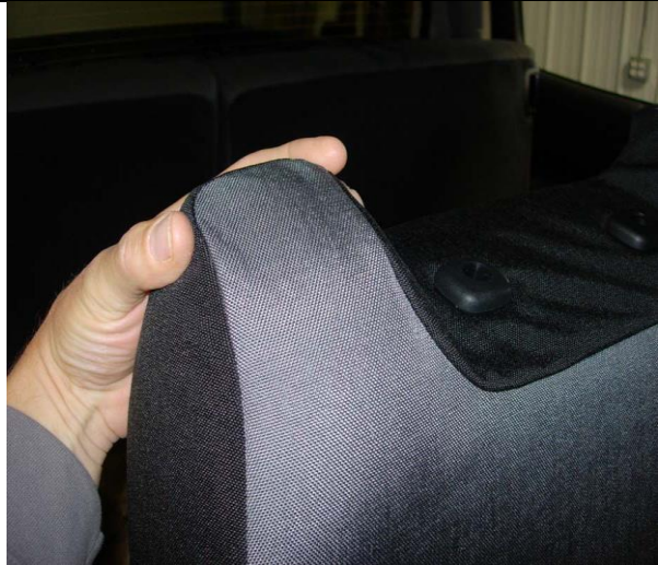
Step 25. Driver & Passenger Top/DT&PT: Form the top corners of the seat cover to the seat by pulling down on the bottom edge of the seat cover.