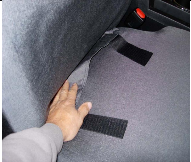
Step 26. Driver & Passenger Top/DT&PT: Tuck in the front edge.