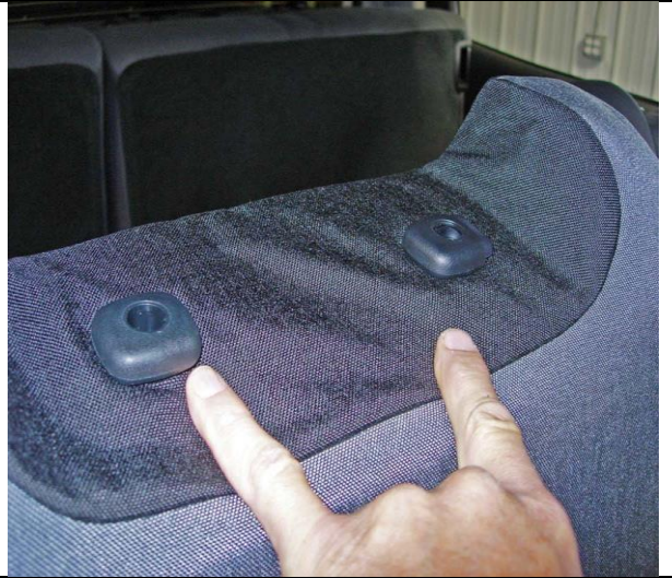
Step 24. Driver & Passenger Top/DT&PT: Tuck the seat cover under the plastic for the headrests, starting with the push button side.