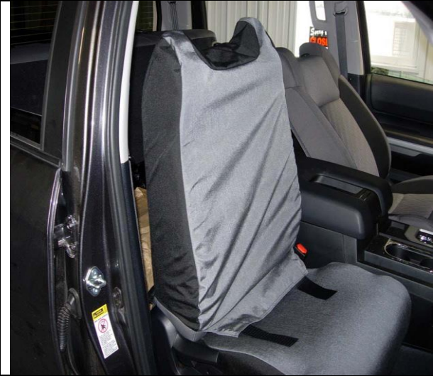
Step 23. Driver & Passenger Top/DT&PT: Slide the seat cover on with the extending hook Velcro™ to the front.