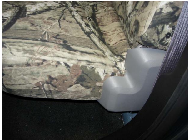
Step 20. Driver & Passenger Bottoms/DB&PB: The outside of the seat bottoms should look like this when properly installed.