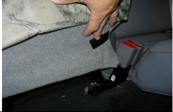
Step 16. Driver & Passenger Bottoms/DB&PB: Lift the seat bottoms up partway, and pull the seat cover down into position, again lining up the seams of the seat cover to the seams of the seat. Pull it tight and press the inside edge Velcro™ next to the center seatbelts onto the carpet on underside of the seat.