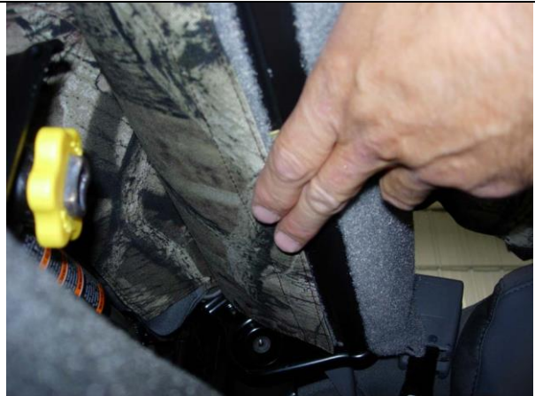
Step 18. Driver & Passenger Bottoms/DB&PB: View from under the passenger seat. Pull the back edge of the seat cover tight, and press it to the carpet, right next to the plastic as shown.