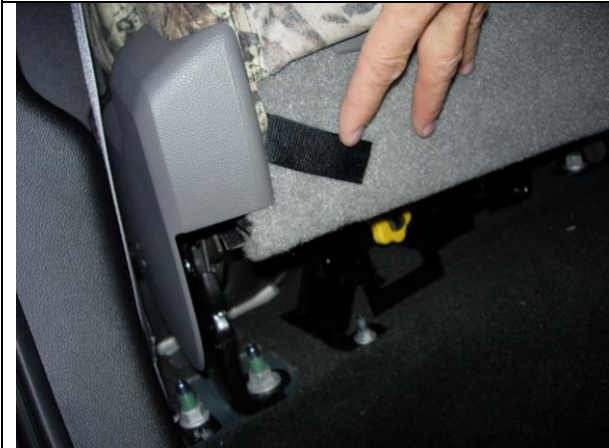
Step 17. Driver & Passenger Bottoms/DB&PB: Pull the outside edge Velcro™ tight, and press it to the carpet under the seat, same as Step 16.