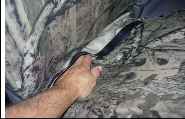
Step 15. Driver & Passenger Bottoms/DB&PB: Fold the seat bottom down, and tuck the seat cover in.