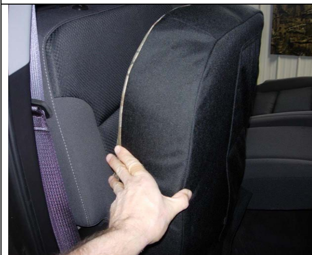
Step 23. Driver & Passenger Bottom/DB&PB: Slide the covers on with the abbreviations "DB & PB" to the top side of the seat. Line up the seams of the seat cover to the seams of the seat, they should closely match.