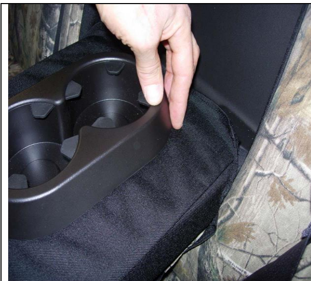
Step 21. Armrest/A: Tuck in the sides and back under the plastic.