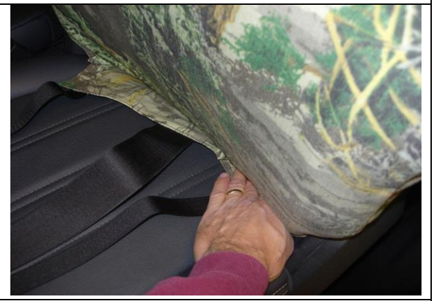
Step 12. Driver & Passenger Top/DT&PT: Tuck the hook fasteners into the seat, slide the seat forward and tip the backrests forward.