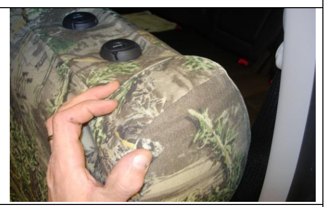
Step 10. Driver & Passenger Top/DT&PT: Slide the seat covers on with the extending hook fasteners to the front. Tuck the fabric under the plastic on the outside edge of the seat. Like Step 6, line up the seams of the seat cover to the seams of the seat.