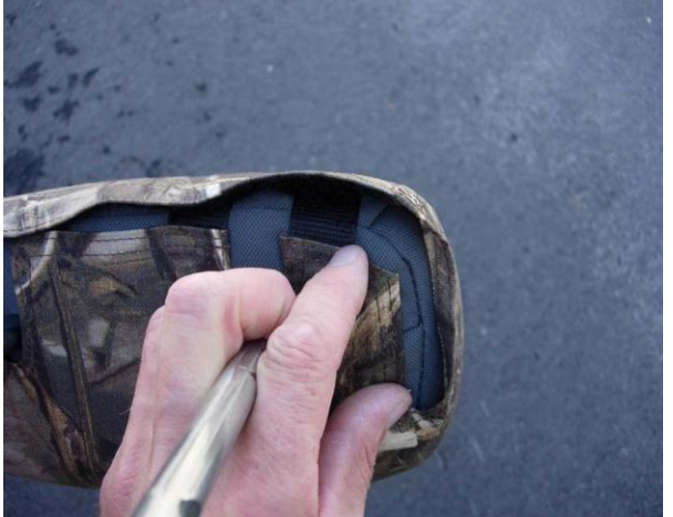
Step 26. Headrests/H: Tuck the front Velcro<sup>™</sup> under the back edge and connect it to the loop Velcro<sup>™</sup> sewn inside the back edge.