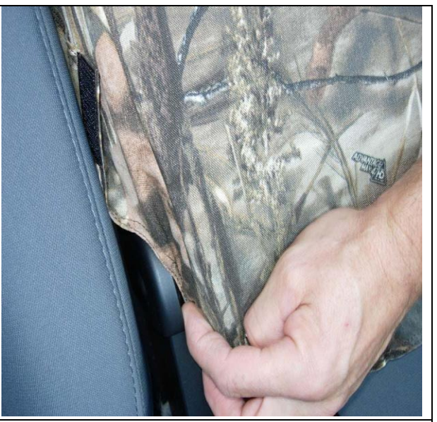
Step 20. Console/C: Tuck the left & right front in around the hinge area