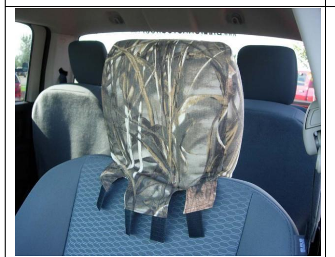
Step 25. Headrests/H: Slide the cover on with the headrest still on the seat with the extending Velcro™ to the front as shown.

Carefully open the Velcro<sup>™</sup> and fold the console down, place the cover on and open the lid. Line up the seams and connect the Velcro<sup>™</sup> under the lid as shown.