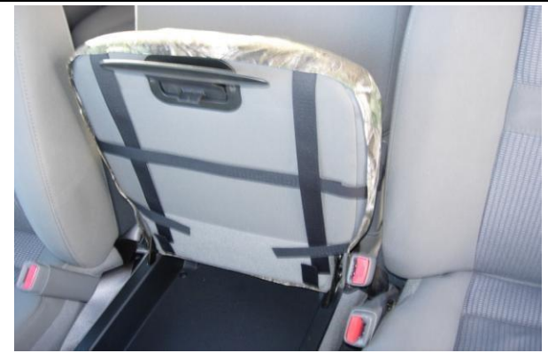
Step 18. Middle Bottom/MB: Connect the Velcro<sup>™</sup> to the carpet on the bottom of the seat and then the middle Velcro<sup>™</sup> to each other.