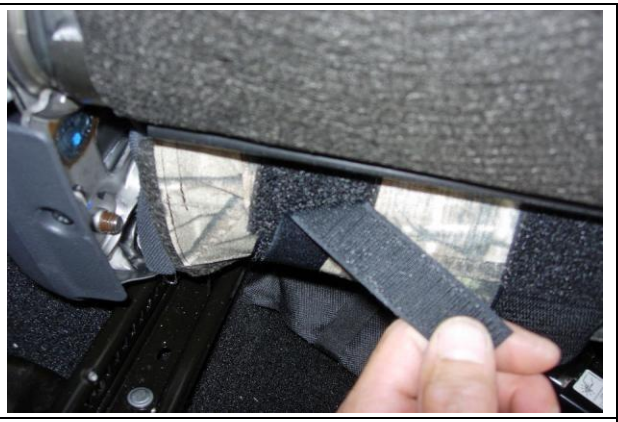
Step 14. Driver & Passenger Top/DT&PT: Use one hand in a smoothing action down the front of the seat, pull the fabric down in back and hold it to the seat while you pull the Velcro<sup>™</sup> forward over the bar, then bring it back and connect the Velcro<sup>™</sup> as shown. It might take a couple tries before you get it tight.

Step 15. Driver & Passenger Top/DT&PT: Center the backside of the seat cover and mate the hook fasteners on the seat cover to the carpet on the back of the seat. Lastly, re-connect the plastic clips under the seat.