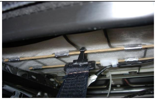
Step 9. Driver & Passenger Bottoms/DB&PB: Connect the plastic hooks under the back edge of the seat to the metal bar, and then mate hook fasteners to the loop fastener as in Step 7. This will keep the seat cover from shifting around. Trim off the excess length of fasteners.