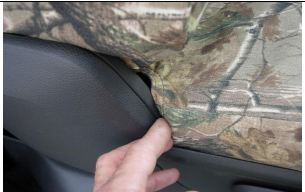
Step 6. Driver & Passenger Bottoms/DB&PB: Line up the seams of the seat cover to the seams of the seat, they should match closely. Then, tuck the outside edge in as shown.

Step 5. Driver & Passenger Bottoms/DB&PB: Slide the long outside edge hook fasteners in as shown between the plastic and the seat, then put the seat belts through the elastic on the inside of the cover.