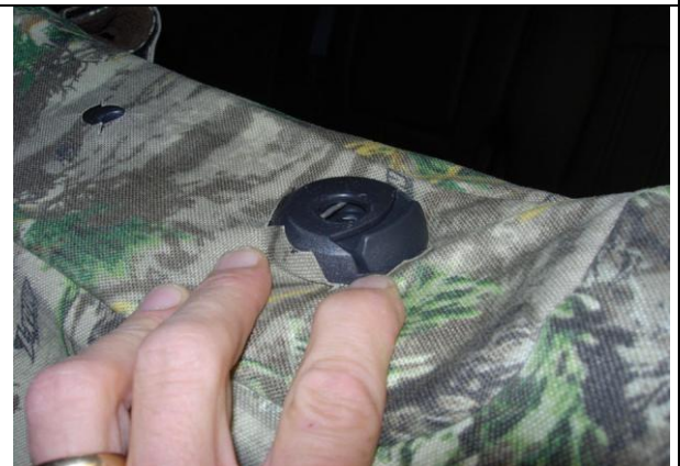
Step 11. Driver & Passenger Top/DT&PT: Tuck the fabric under the plastic of the headrests starting with the push button side as shown.