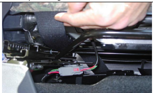
Step 4. Driver & Passenger Bottoms/DB&PB: All the parts of the seat cover are labeled inside. Use the Seat Cover Piece Identification Chart to ID parts. Tuck the back edge of the seat cover into the seat. Next, route the long hook (sticky) fasteners under the front of the seat where shown, avoiding any seat mechanisms.

Step 3. Remove the seat belt from the elastic on the inside edge of the driver and passenger seat bottoms.