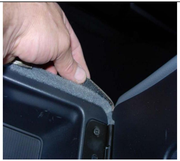
Step 22. Console/C: Pull the back left & right sides up and press the Velcro<sup>™</sup> to the carpet as shown.