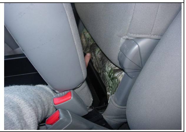
Step 16. Middle Bottom Back/MBB: Lift the middle bottom up and place the loop Velcro<sup>™</sup> into the cavity of the middle bottom. Prepare the surface of the plastic with rubbing alcohol. Press the adhesive hook Velcro<sup>™</sup> to the inside of the plastic box.