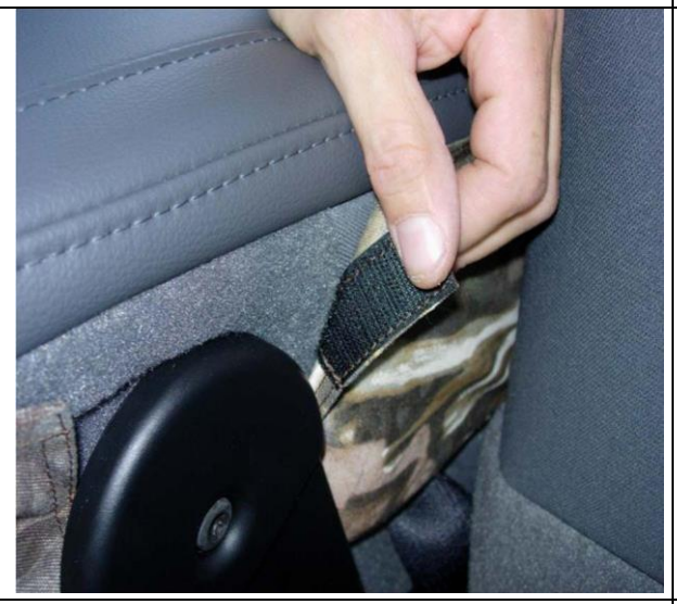
Step 21. Console/C: Pull the back left & right sides up and press the Velcro<sup>™</sup> to the carpet as shown.