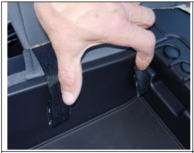
Step 23. Console/C: Slide the rear Velcro<sup>™</sup> into the hinge area using a sawing motion while moving the lid. Fold the Velcro<sup>™</sup> into the cavity and look where they will lay inside. Clean the areas with rubbing alcohol by scrubbing hard and wiping it dry while it's still wet. Pull the Velcro<sup>™</sup> tight, peel off the backing and press the adhesive Velcro<sup>™</sup> onto the plastic.