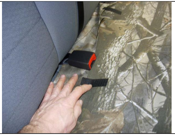
Step 10. Bottom/B: Lift the seat bottom up partway and tuck the seat cover under the seat belts and into the seat with the extending hook Velcro<sup>™</sup> on the top.