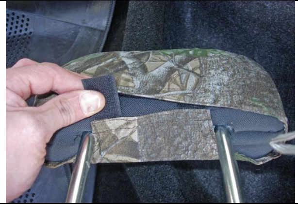
Step 14. Headrest/H: Slide the seat cover on with the extending hook Velcro<sup>™</sup> to the front, connecting them as shown.

Feel for the hook Velcro<sup>TM</sup> under the seat. Using one hand in a smoothing action from the front to the back on the top to remove slack, then press the Velcro<sup>TM</sup> to the carpet as shown.