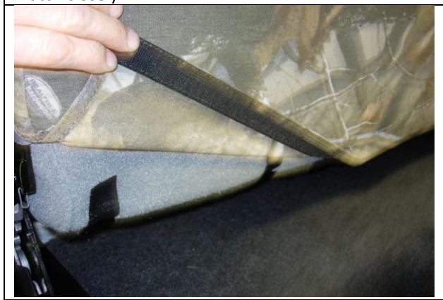
Step 13. Bottom/B: Starting at one side moving to the other, press the hook Velcro<sup>™</sup> to the carpet under the seat as shown.

Tuck the seat cover under the plastic as shown, and along the side of the seat. Line up the seams of the seat cover to the seams of your seat, they should match closely.