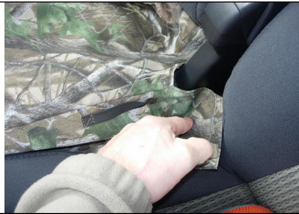
Step 17. Middle Bottom/MB: Push the left and right sides through to the back.