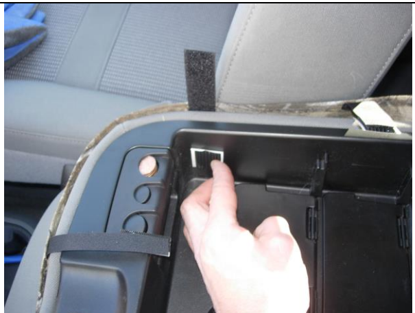
Step 22. Console/C: Clean the surface with rubbing alcohol as in Step 17. Peel off the backing from the adhesive hook Velcro™ and stick them to the plastic on the inside of the console. If they are not sticking, stop and re-clean the areas. Keep truck at 68 degrees or warmer for at least 24 hrs if possible for best results.