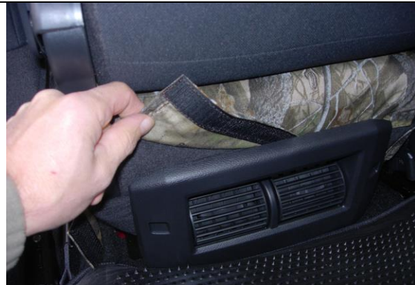
Step 19. Middle Bottom/MB: Pull the cover back and press the hook Velcro™ to the carpet on the back edge of the seat.