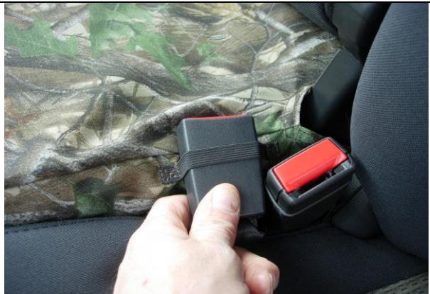
Step 20. Middle Bottom/MB: Push the seat belts through the provided elastic loops on the seat cover.