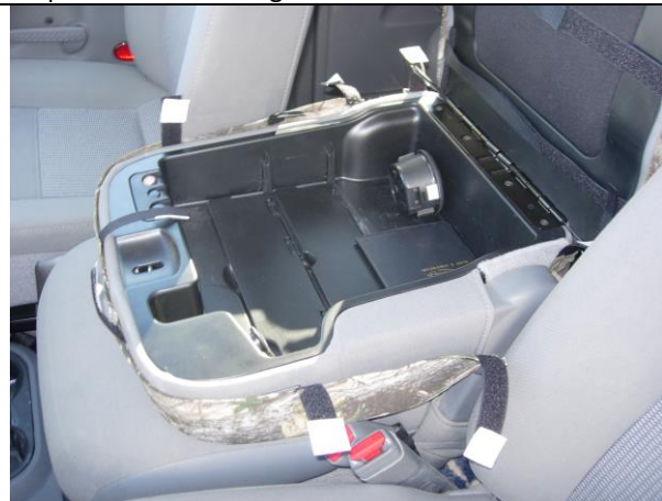
Step 21. Console/C: With the console in the up position, slide the console cover on and tuck it in on the bottom. Fold the console down, holding it in position with one hand. Note where the Velcro™ will lay inside the cavity. Fasten the right side and left side rear hook Velcro™ to the carpet behind the console hinge.