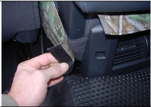
Step 18. Middle Bottom/MB: Line up the seams of the seat cover to the seams of the seat, and then press the hook Velcro™ on left and right to the carpet on the back edge of the seat.