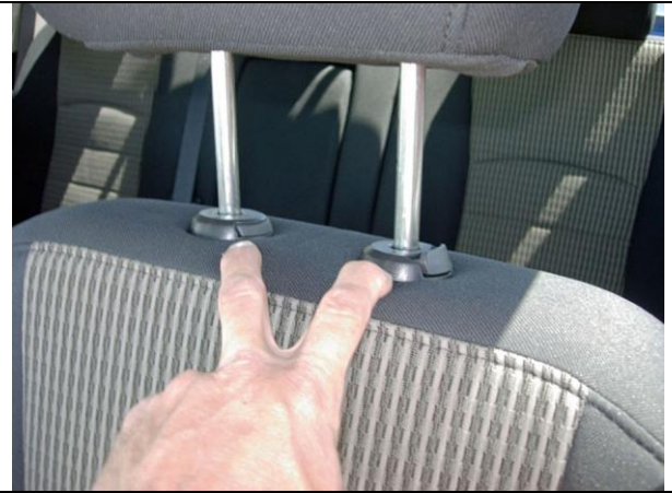
Step 1. Prepare the driver and passenger seat for installation

by temporarily removing the headrests. Recline the backrests and depress the two push button releases shown while holding gentle upward pressure.