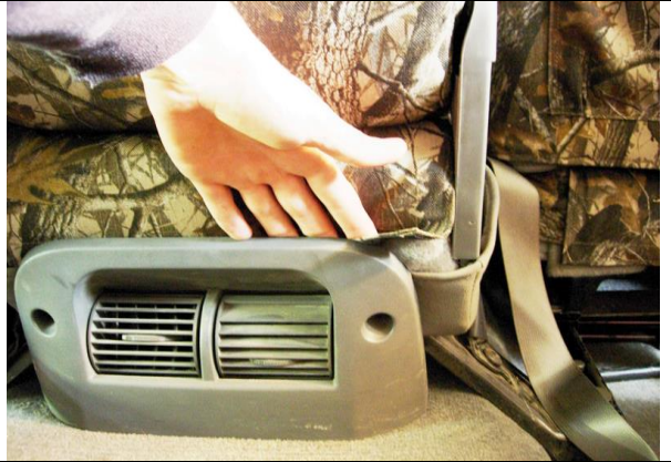
Step 17. Middle Bottom Back/MBB:

Lift the middle bottom up and place the loop Velcro™ into the cavity of the middle bottom. Prepare the surface of the plastic with rubbing alcohol. Press the adhesive hook Velcro™ to the inside of the plastic box.