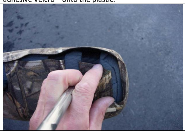
Step 25. Headrests/H:

Slide the rear Velcro™ into the hinge area using a sawing motion while moving the lid. Fold the Velcro™ into the cavity and look where they will lay inside. Clean the areas with rubbing alcohol by scrubbing hard and wiping it dry while it's still wet. Pull the Velcro<sup>™</sup> tight, peel off the backing and press the adhesive Velcro™ onto the plastic.