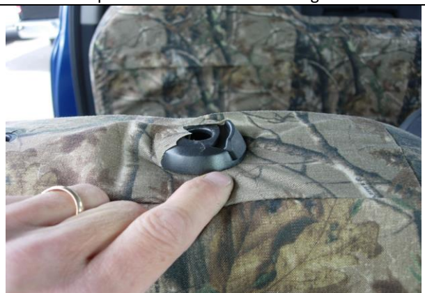
Step 11. Driver & Passenger Top/DT&PT: Tuck the fabric under the plastic of the headrests starting with the push button side as shown.