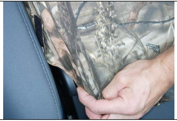
Step 20. Console/C:

Slide the cover on as shown, line up the seams..