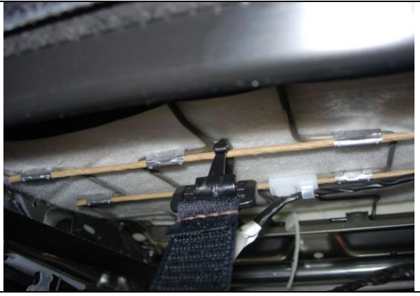
Step 9. Driver & Passenger Bottoms/DB&PB: Connect the plastic hooks under the back edge of the seat to the metal bar, and then press the hook Velcro™ to the loop Velcro™ sewn on the back edge. This will keep the seat cover from shifting around.