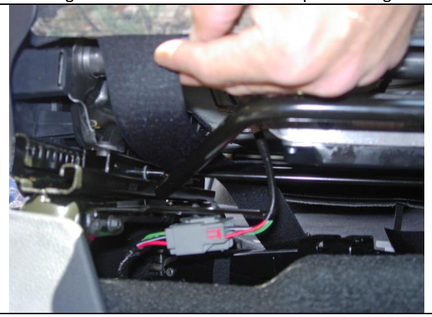
Step 4. Driver & Passenger Bottoms/DB&PB:

Remove the seat belt from the elastic on the inside edge of the driver and passenger seat bottoms.