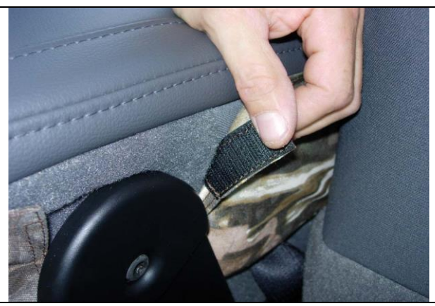
Step 21. Console/C: Pull the right side up and press the Velcro™ to the carpet.