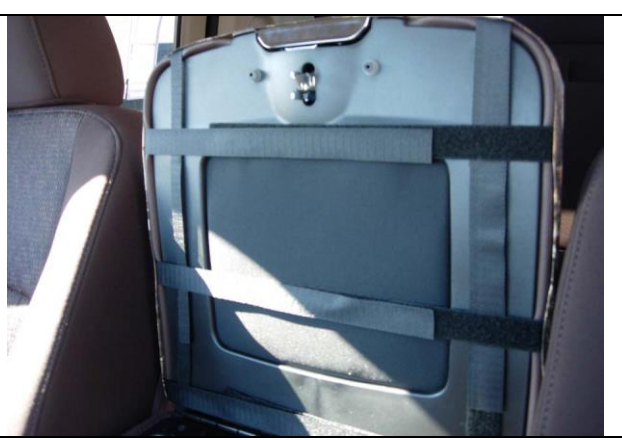
Step 26. Lid/L:

Tuck the front Velcro^{\mathsf{TM}} under the back edge and connect it to the loop Velcro™ sewn inside the back edge.