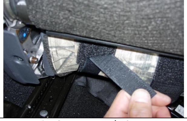
Step 14. Driver & Passenger Top/DT&PT: While gently pulling on the fastener from behind the seat, use one hand in a smoothing action down the front of the seat, and then connect the Velcro™ to the loop Velcro™ sewn inside the seat cover.