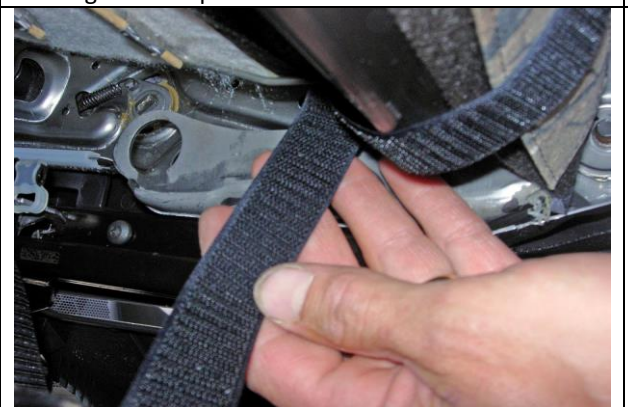
Step 13. Driver & Passenger Top/DT&PT: View from under the back of the seats. Route the long hook Velcro™ on left and right, over the metal bar as shown. Do the same for the two inch wide center hook Velcro™.