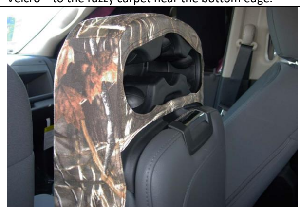
Step 19. Console/C:

Connect the Velcro<sup>™</sup> to the carpet on the bottom of the seat and then the middle Velcro<sup>™</sup> to each other.