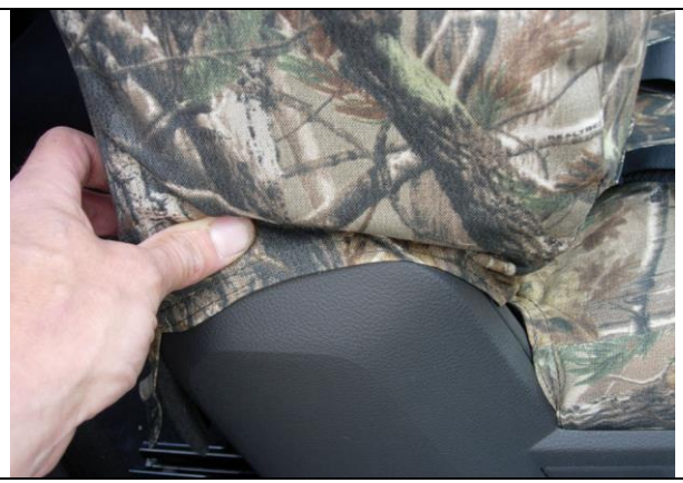
Step 10. Driver & Passenger Top/DT&PT: Slide the seat covers on with the extending hook Velcro™ to the front. Tuck the fabric under the plastic on the outside edge of the seat. Like Step 6, line up the seams of the seat cover to the seams of the seat.