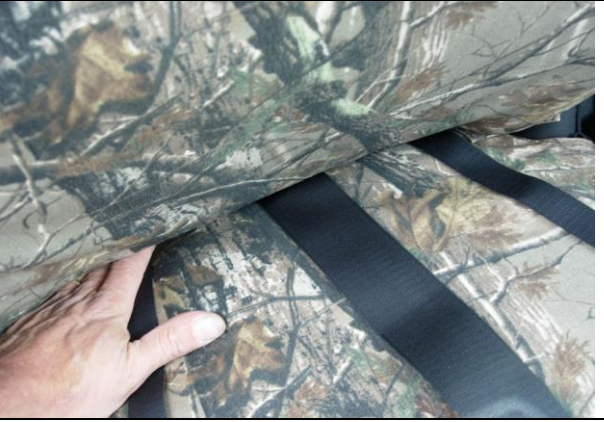
Step 12. Driver & Passenger Top/DT&PT: Tuck the hook Velcro™ into the seat, slide the seat forward and tip the backrests forward.