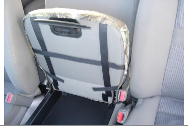
Step 18. Middle Bottom/MB:

Mate the hook Velcro™ to the carpet on the back edge of the middle seat bottom by tucking behind the vent. Some models have no vent, in which case, press the Velcro™ to the fuzzy carpet near the bottom edge.