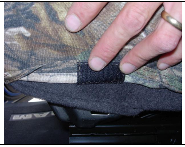
Step 8. Driver & Passenger Bottoms/DB&PB: View from the inside edge of the passenger bottom next to the middle bottom. Press the two hook Velcro™ sewn inside the seat cover to the carpet on the seat. Like step 7, slide one hand from front to back along the inside edge while connecting the Velcro™ to the carpet to remove any slack in the seat cover.