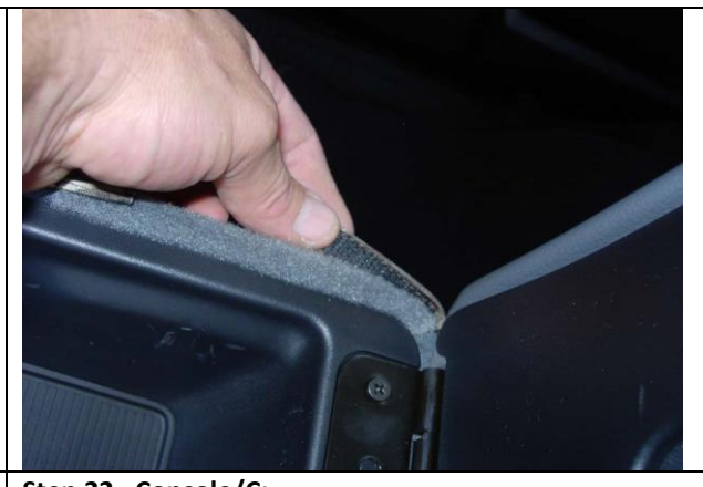
Step 22. Console/C: Pull the back left & right sides up and press the Velcro<sup>™</sup> to the carpet as shown.