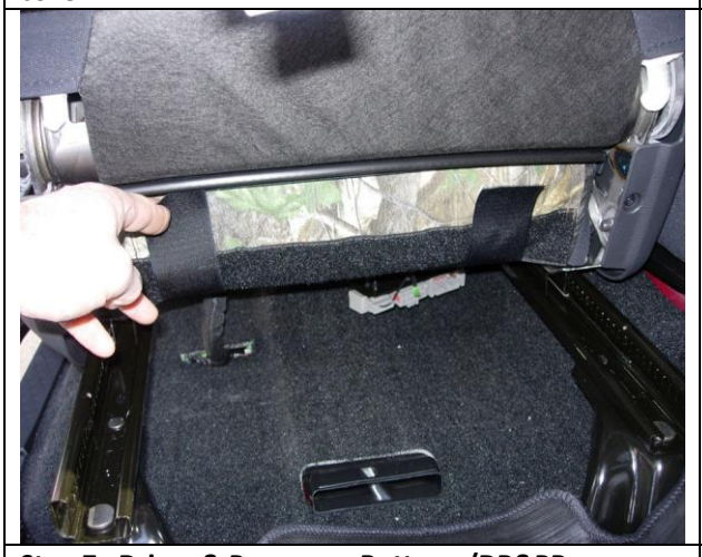
Step 7. Driver & Passenger Bottoms/DB&PB: If you have electric seats be sure to lift the seat up as high as it will go. This will pull everything away from your seat and free up some space. Route the long front edge hook Velcro™ to the loop Velcro™ sewn on the back edge. Make sure the Velcro is routed above any wires or bars. Route the outside edge hook Velcro™ at an angle and connect it to the loop Velcro™ sewn on the back edge. Use one hand in a smoothing action from front to back along the outside edge and top of the seat cover while pulling on the back of the seat cover, then tightening the Velcro™.