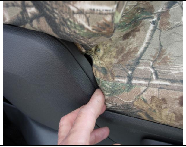
Step 6. Driver & Passenger Bottoms/DB&PB: Line up the seams of the seat cover to the seams of the seat, they should match closely. Then, tuck the outside edge in as shown.