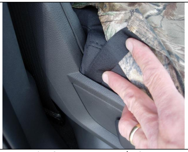
Step 5. Driver & Passenger Bottoms/DB&PB: Slide the long outside edge hook Velcro™ in as shown between the plastic and the seat, then put the seat belts through the elastic on the inside of the seat cover.