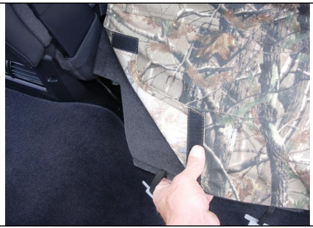
Step 15. Driver & Passenger Top/DT&PT:

Center the backside of the seat cover and press the hook Velcro™ on the seat cover to the carpet on the back of the seat. Lastly, re-connect the plastic clips under the seat.