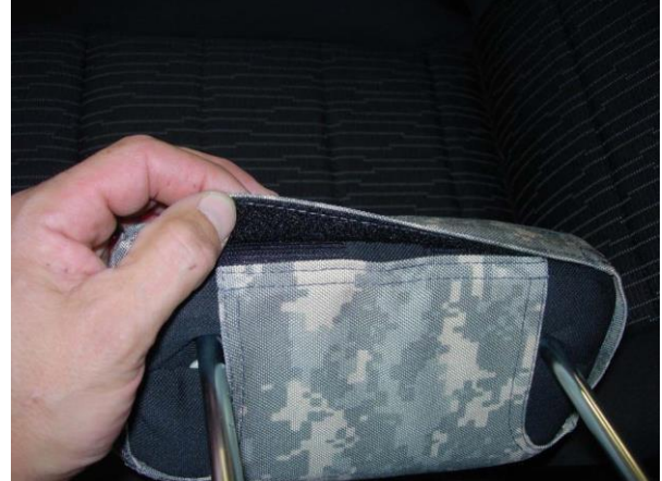
Step 3. Headrest/H: Line up the seams of the headrest cover to the seams of the headrest, they should closely match. Tuck the front Velcro<sup>™</sup> under the back edge and connect it as shown.