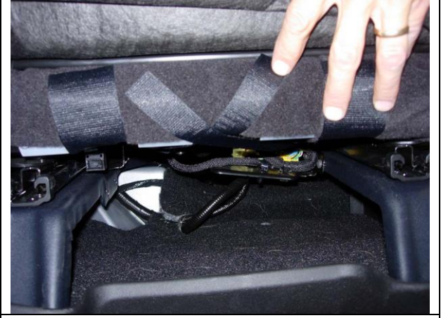
Step 14. Driver & Passenger Bottoms/DB&PB: The side Velcro<sup>™</sup> should be fastened in an "X" pattern.