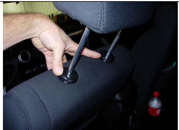
Step 2. Headrest/H: Temporarily remove the headrests by lifting them up all the way, depress the push button releases while holding gentle upward pressure.

Slide the headrest covers on with the extending hook (sticky) Velcro<sup>™</sup> to the front.