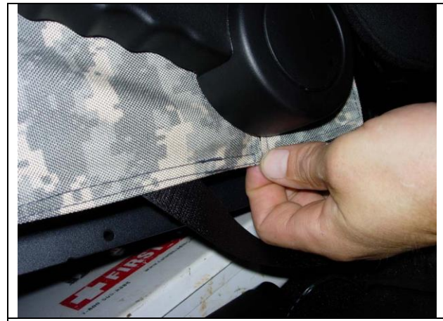
Step 11. Driver Bottom/DB: Connect the Velcro<sup>™</sup> under the side lever.