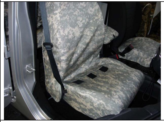
Step 16. Driver & Passenger Tops/DT&PT: Slide the cover on with the extending hook Velcro<sup>™</sup> to the front.