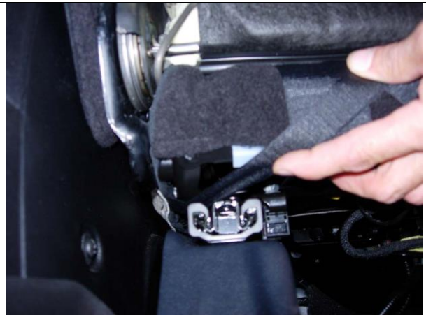
Step 13. Driver & Passenger Bottoms/DB&PB: Route the far back side Velcro<sup>™</sup> where shown, above the seat slide in back.