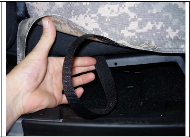
Step 12. Driver & Passenger Bottoms/DB&PB: Route the side hook Velcro<sup>™</sup> over the seat slides.