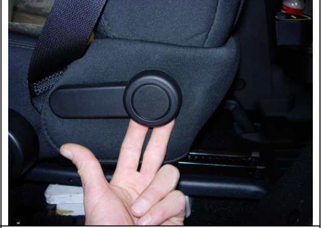
Step 4. Driver & Passenger Top/DT&PT: Temporarily remove the keep pin from the backside of the recline handle by pushing up with both fingers alongside the shaft. Use your other hand over the top of the handle to keep the pin from flying away on you.