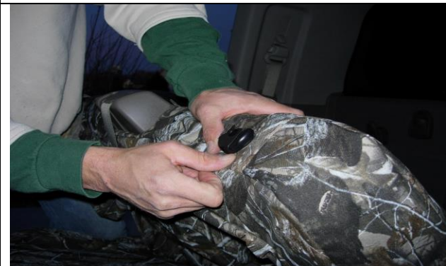
Step 11. Driver & Passenger Top/DT&PT: Tuck the fabric under the plastic for the headrests.