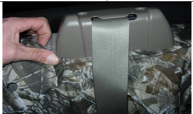
Step 10. Passenger Top/PT: Tuck the fabric under the plastic for seatbelt.