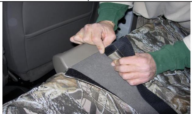
Step 12. Passenger Top/PT: Press the hook Velcro™ to the carpet under the seatbelt.