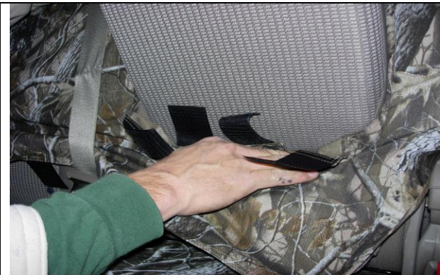
Step 7. Passenger Top/PT: Tuck the Velcro™ under the armrest.