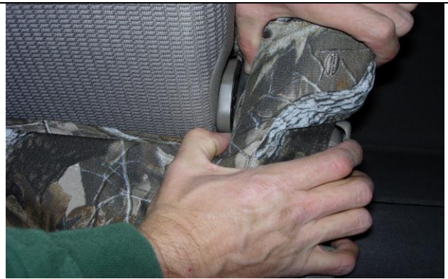
Step 8. Passenger Top/PT: Tuck the seat cover behind the plastic for the armrest.