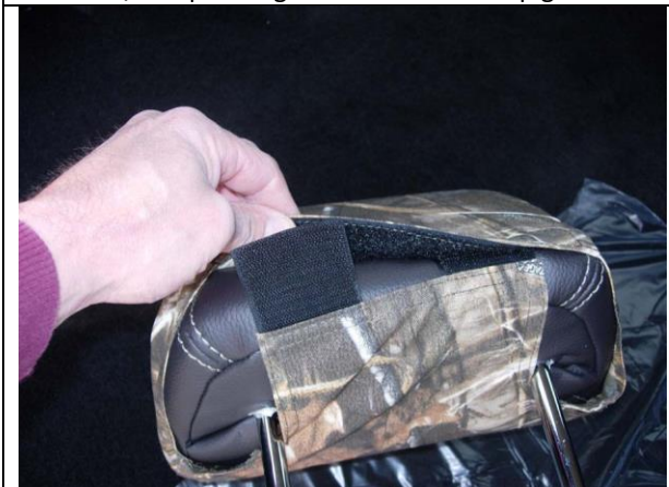
Step 19. Headrest/H: Tuck the hook Velcro™ under the back edge and connect the Velcro™ as shown.