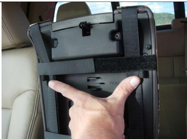
Step 22. Lid/L Lastly, connect the side to side Velcro™, making sure to keep the front Velcro™ inside of the plastic studs.