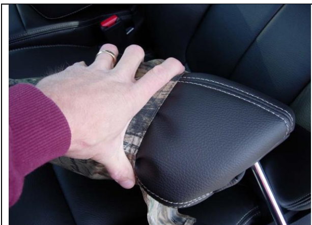
Step 17. Headrest/H: Slide the cover on with the extending hook Velcro™ to the front, compressing the headrest to help get it on.