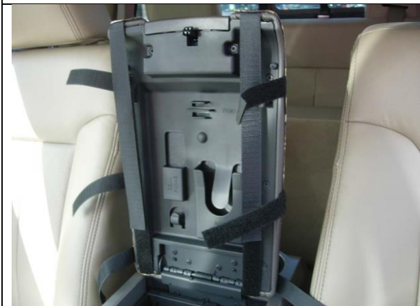
Step 21. Lid/L Connect the two front to back Velcro™ first.