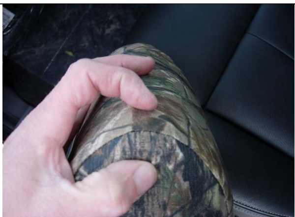
Step 18. Headrest/H: Manipulate the material inside the cover from forefinger to thumb along the sides and top.