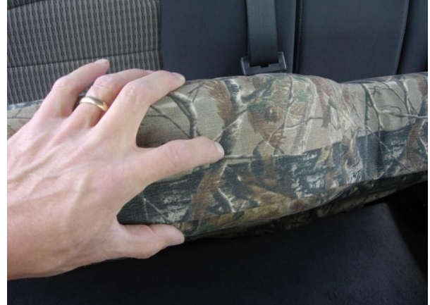
Step 14. Driver & Passenger Bottoms/DB&PB:

Tilt the seat bottom up, and slide the seat covers on with the letters "DB" & "PB" up.