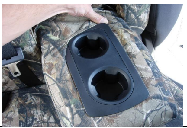
Step 10. Armrest/A:

Push the fabric into the top of the cavity with one hand, and then mate the loop Velcro^{TM} in back by pressing it down onto the hook Velcro^{TM} behind the armrest with the other hand.