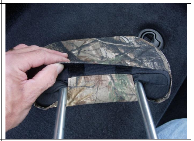
Step 12. Headrests/H:

Pull the hook Velcro<sup>™</sup> up from the back and mate them to the loop Velcro<sup>™</sup> sewn inside the back edge.