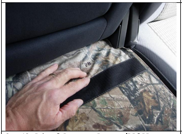
Step 13. Driver & Passenger Bottoms/DB&PB:

Slide the covers on with the extending hook Velcro^{TM} to the front. Line up the seams, and connect the Velcro^{TM} as shown.