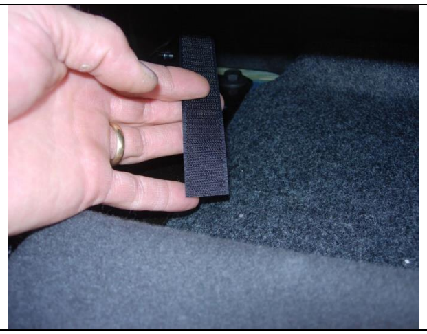
Step 5. Driver & Passenger Top/DT&PT:

Pictured is one of the 1X12" hook Velcro™ sewn on the bottom left and right corners of the DT & PT. Tuck the fabric behind the plastic as shown on Step 6.