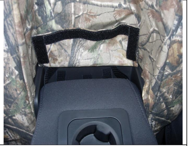
Step 8. Driver & Passenger Top/DT&PT:

Reach up behind the seat and feel for the long hook Velcro™ from Step 3, and pull them down. Slide your hand down the front of the seat gathering up slack. Pull the seat cover all the way to the back edge of the seat (under the seat), connecting the hook Velcro™ to the loop (fuzzy) Velcro™ sewn inside the front edge.