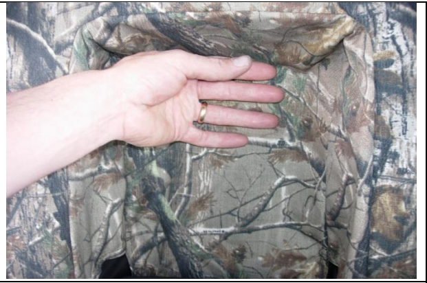
Step 9. Driver & Passenger Top/DT&PT:

Push the fabric into the top of the cavity with one hand, and then mate the loop Velcro^{TM} in back by pressing it down onto the hook Velcro^{TM} behind the armrest with the other hand.