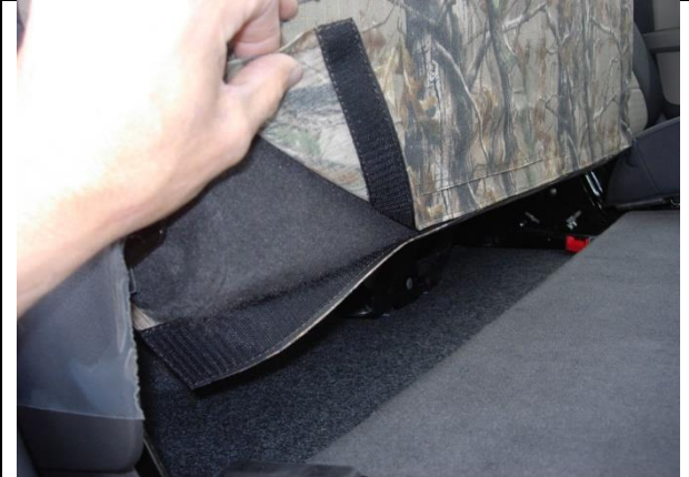
Step 16. Driver & Passenger Bottoms/DB&PB: Lastly, press the hook Velcro™ to the carpet on the seat, starting on one side moving to the other.