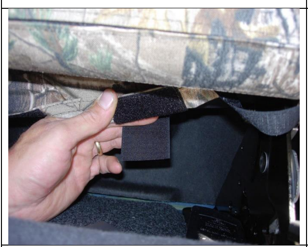
Step 7. Passenger Top/PT:

Route the left and right 1X12" side Hook Velcro™ from Step 5 under the bottom corner around to the side of the seat (above pointer finger), connecting it to the loop (fuzzy) Velcro™ sewn inside. Some re-connecting of the side Velcro™ may be necessary to provide the best fit. Do this by sliding your hand down the sides of the seat cover, pull the bottom corner under the seat back, then take up the slack and re-connect the Velcro™.