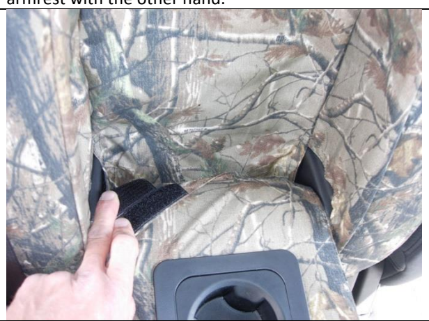
Step 11. Armrest/A:

Slide the cover on with the cut-out on the top, and extending hook Velcro^{TM} to the front. Tuck it under the front of the drink holders, then the back.