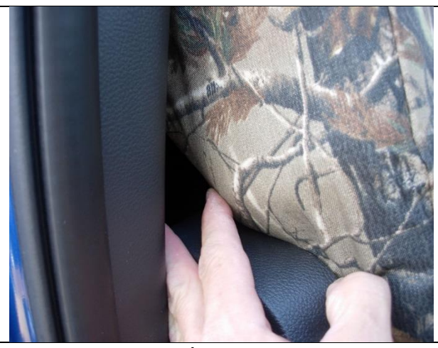
Step 6. Passenger Top/PT:

Pull the seat cover down around the bottom right and left corners. It's critical to get the covers pulled down all the way and over the bottom corners of the seat.