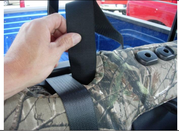
Step 4. Passenger Top/PT:

Lift the seat bottoms up. Fold the 2X22" hook Velcro™ that's on top of the seat in half lengthwise with the sticky facing in, making them 1X22", and stiff as a ruler. Slide them down behind the seat. You may have to fold the bottoms down slightly in order to move the bottom edge of the seat away from the back of the cab giving more clearance to grab the Velcro™.