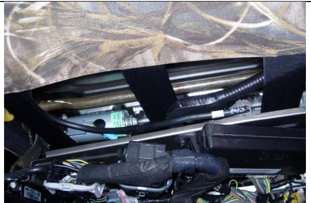
Step 14. Driver & Passenger Bottom/DB&PB: Route the long hook Velcro<sup>™</sup> under the front of the seat, over the top of the metal framework to the back edge of the seat.