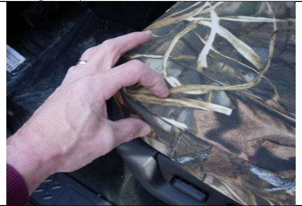
Step 8. Driver & Passenger Bottom/DB&PB: Then, work the material from the seam inside the seat cover outward (forefinger to thumb). Pulling the seat cover from behind the seat will help hold the cover to the front of the seat bottom.