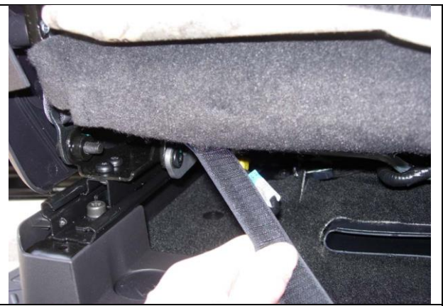
Step 12. Driver & Passenger Bottom/DB&PB: connect the Velcro<sup>™</sup> at an angle to the carpet on the back edge of the seat.