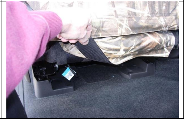
Step 16. Driver & Passenger Bottom/DB&PB: Again, use one hand in a smoothing action from front to back while pulling on the rear part of the seat cover. connect it to the carpet on the back edge of the seat, starting on one side, moving to the other.

Test the seat by moving it in all directions to make sure the seats action is not impeded. Adjust if needed.