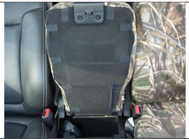
Step 18. Middle Bottom/MB: Again, use one hand in a smoothing action from front to back, and connecting the rear Velcro<sup>™</sup>. Slide one hand down the side, while connecting the Velcro<sup>™</sup>.