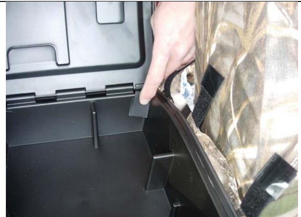
Step 22. Console/C: Again, use a sawing motion while moving the lid to slide the rear Velcro<sup>™</sup> into the hinge.