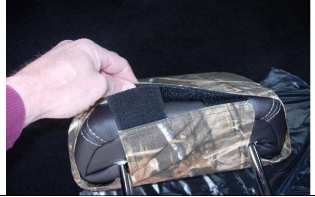
Step 28. Headrest/H: Tuck the hook Velcro<sup>™</sup> under the back edge, connecting the Velcro<sup>™</sup> as shown.

Step 26. Headrest/H: Slide the cover on with the extending hook Velcro<sup>™</sup> to the front, compressing the headrest to help get it on.