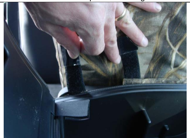
Step 21. Console/C: Use a sawing motion with the two Velcro<sup>™</sup> shown to help slide the seat cover behind the plastic on the left.

Step 19. Console/C: With the console in the up position, slide the cover on. With the cover pulled down all the way, carefully tuck the seat cover behind the plastic on the right side.