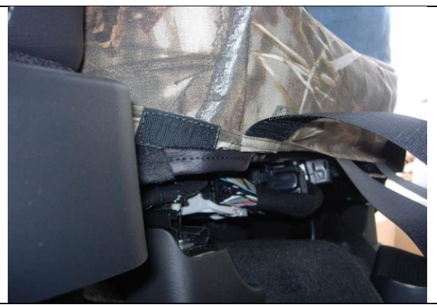
Step 6. Driver & Passenger Bottom/DB&PB: Turn the inside edge of the seat cover next to the console inside out to help keep the Velcro<sup>™</sup> from sticking while you work the rest of the seat cover.

Step 9. Driver & Passenger Bottom/DB&PB: Pull the inside edge back, connecting the hook Velcro<sup>™</sup> to the carpet on the seat. Reach in next to the console and turn the seat cover right side out, connecting the Velcro<sup>™</sup> on the inside edge to the carpet on the seat.