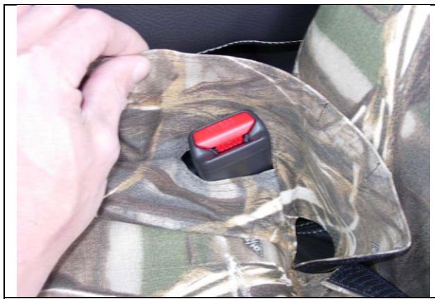
Step 5. Driver & Passenger Bottom/DB&PB: Place the seat cover on with the long hook Velcro<sup>™</sup> to the front. Put the seatbelt through the provided opening as shown.