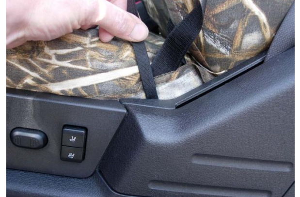
Step 10. Driver & Passenger Bottom/DB&PB: Fold the outside edge hook Velcro<sup>™</sup> in half, sticking it to itself. Next, slide it down between the seat and the plastic cowling exactly where shown. Tuck the seat cover behind the plastic cowling.