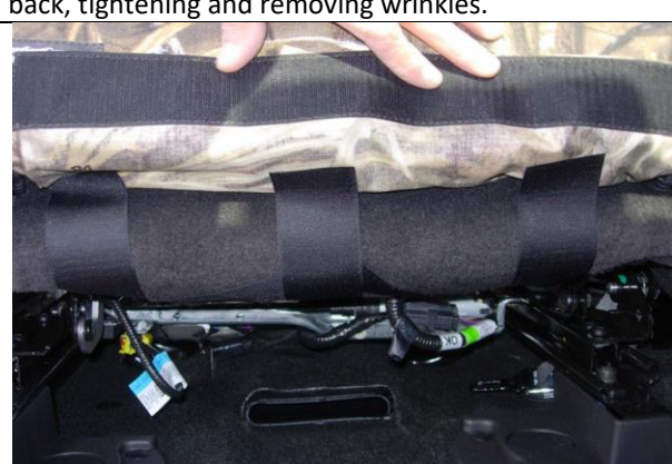
Step 15. Driver & Passenger Bottom/DB&PB: Connect them to the carpet on the back edge of the seat.

Test the seat by moving it in all directions to make sure the seats action is not impeded. Adjust if needed.