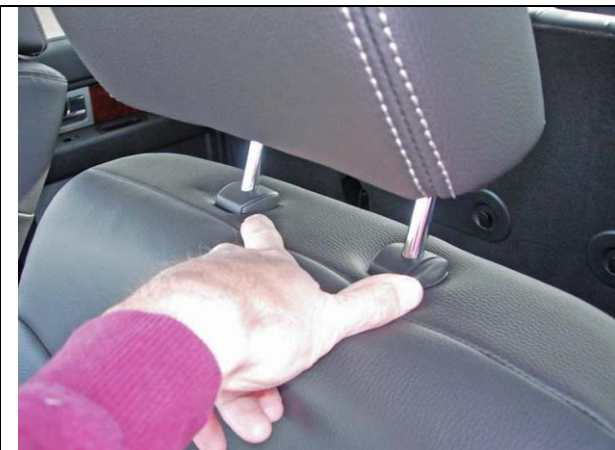
Step 1. Driver & Passenger Top/DT&PT: Temporarily remove the headrests by lifting them up all the way. Then, keeping gentle upward pressure, push the release buttons at the same time until the headrest comes out.