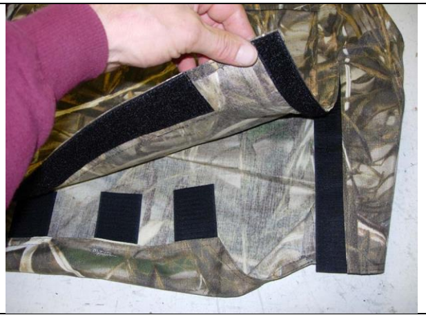
Step 2. Driver & Passenger Top/DT&PT: All the parts of the seat cover are labeled inside. Use the seat cover Piece Identification Chart to ID parts.

Carefully open the seat cover, making sure to open the inside edge vertical Velcro<sup>™</sup> as shown.