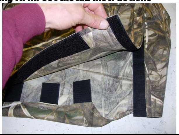
Step 2. Driver & Passenger Top/DT&PT: All the parts of the seat cover are labeled inside. Use the seat cover Piece Identification Chart to ID parts. Carefully open the seat cover, making sure to open the inside edge vertical fasteners as shown.