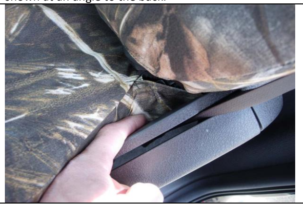
Step 13. Driver & Passenger Bottom/DB&PB: Tuck the outside edge of the seat cover in and back around the corner, mating the hook Velcro™ to the carpet on the seat similar to Step 9, while sliding one hand down the side of the seat cover from front to back, tightening and removing wrinkles.