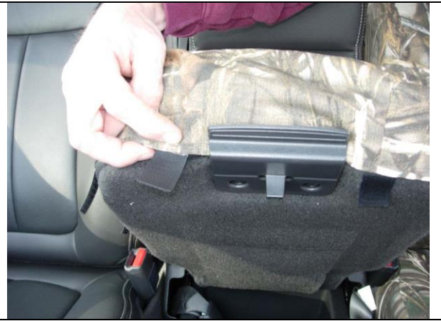
Step 17. Middle Bottom/MB:

Place the cover over the front, tucking it behind the latch, mating the Velcro™ to the carpet in front.