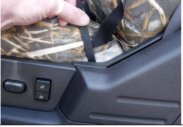
Step 10. Driver & Passenger Bottom/DB&PB: Fold the outside edge hook Velcro™ in half, sticking it to itself. Next, slide it down between the seat and the plastic cowling exactly where shown. Tuck the seat cover behind the plastic cowling.