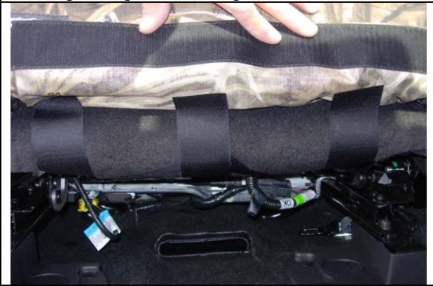
Step 15. Driver & Passenger Bottom/DB&PB: Mate the Velcro™ to the carpet on the back edge of the seat. Test the seat by moving it in all directions to make sure the seats action is not impeded. Adjust if needed.