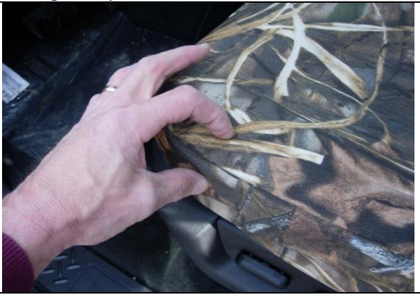
Step 8. Driver & Passenger Bottom/DB&PB: Then, work the material from the seam inside the seat cover outward (forefinger to thumb). Pulling the seat cover from behind the seat will help hold the cover to the front of the seat bottom.