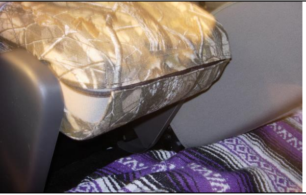
Step 20. Armrest/A

Place the armrest cover on with the long hook Velcro™ to the front. As in Step 3, line up the seams of the armrest cover to the seams of the armrest.