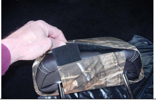
Step 22. Headrest/H:

Slide the cover on with the extending hook Velcro^{TM} to the front, compressing the headrest to help get it on.