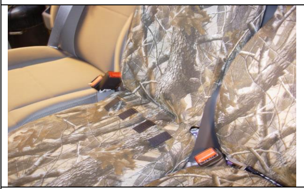
Step 19. Armrest/A

Again, use one hand in a smoothing action from front to back, and mate the rear Velcro ^{\text{TM}} . Slide one hand down the side, while mating the Velcro ^{\text{TM}} .