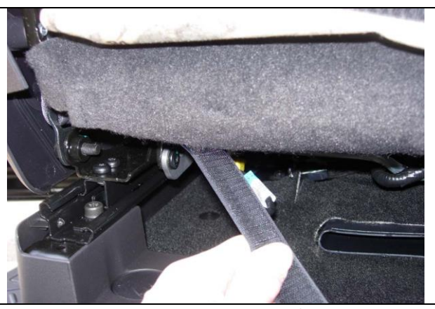
Step 12. Driver & Passenger Bottom/DB&PB: Mate the Velcro™ at an angle to the carpet on the back edge of the seat.