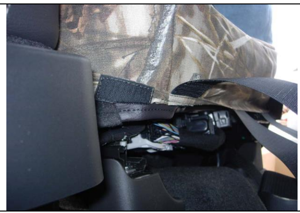
Step 6. Driver & Passenger Bottom/DB&PB: Turn the inside edge of the seat cover next to the console inside out to help keep the Velcro™ from sticking while you work the rest of the seat cover.