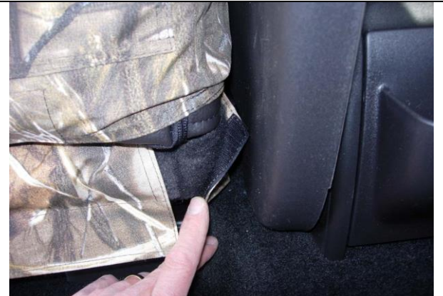
Step 9. Driver & Passenger Bottom/DB&PB: Pull the inside edge back, mating the hook Velcro™ to the carpet on the seat. Reach in next to the console and turn the seat cover right side out, mating the Velcro™ on the inside edge to the carpet on the seat.