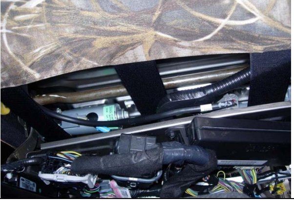
Step 14. Driver & Passenger Bottom/DB&PB: Route the long hook Velcro™ under the front of the seat, over the top of the metal framework to the back edge of the seat.