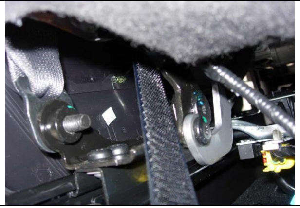
Step 11. Driver & Passenger Bottom/DB&PB: View from under the back of the driver seat. Carefully feel for the Velcro™ under the seat, routing it where shown at an angle to the back.