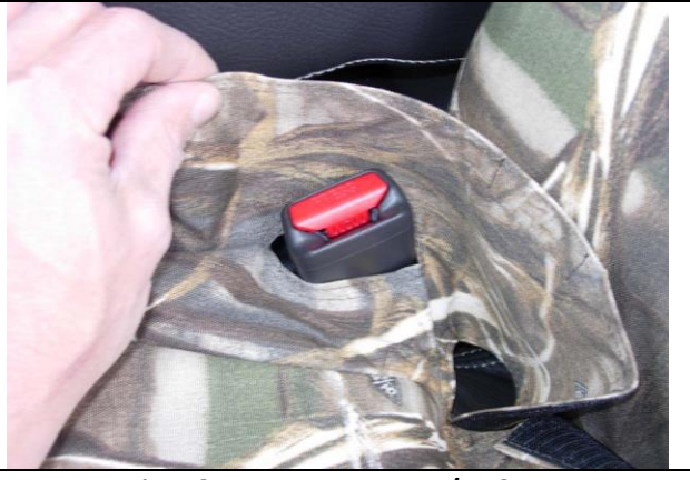
Step 5. Driver & Passenger Bottom/DB&PB: Place the seat cover on with the long hook Velcro™ to the front. Put the seatbelt through the provided opening as shown.