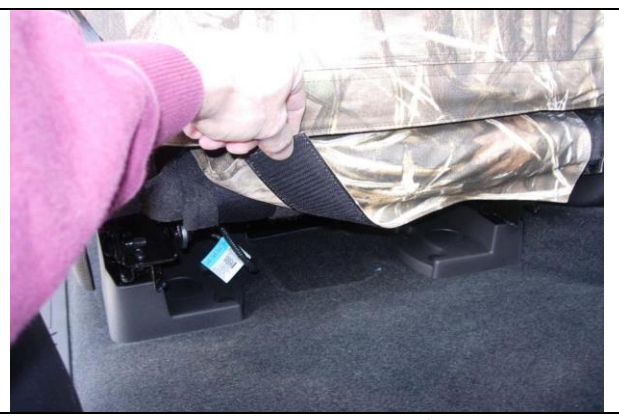
Step 16. Driver & Passenger Bottom/DB&PB: Again, use one hand in a smoothing action from front to back while pulling on the rear part of the seat cover. Mate the Velcro™ to the carpet on the back edge of the seat, starting on one side, moving to the other.