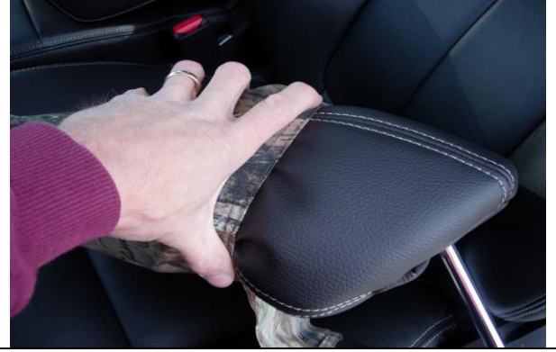
Step 21. Headrest/H:

Move the armrest back and forth and carefully tuck the cover behind the plastic covers of the hinge area. Mate the hook Velcro^{TM} to the loop strip sewn on the back edge.