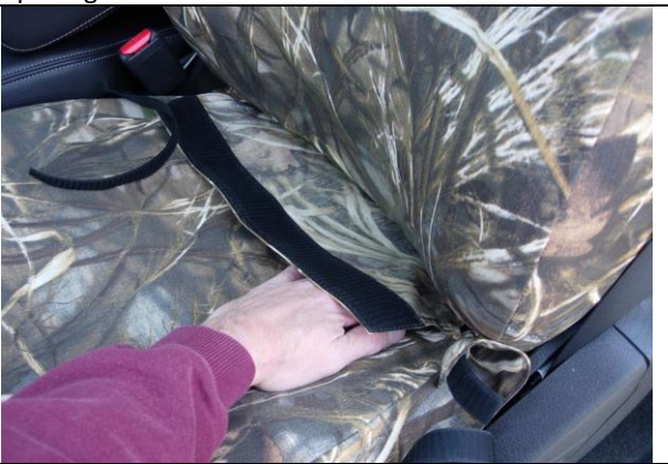
Step 7. Driver & Passenger Bottom/DB&PB: Tuck the back edge of the seat cover into the seat, but don't fasten it down yet. Line up the seams of the seat cover to the seams of your seats around the sides and front, they should closely match.