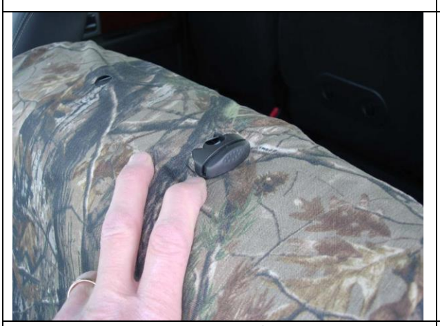
Step 3. Driver & Passenger Top/DT&PT: Slide the seat cover on with the extending hook (sticky) fasteners to the front, and then tuck the fabric under the plastic of the headrests starting with the push button side first as shown. Line up the seams of the seat cover to the seams of your seats along the sides and top, they should closely match. Mate the inside edge vertical fasteners (not shown).