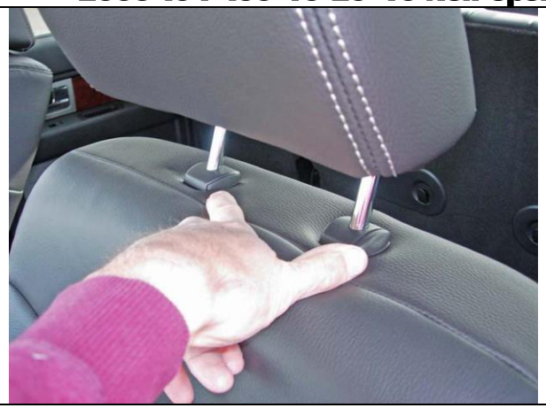
Step 1. Driver & Passenger Top/DT&PT: Temporarily remove the headrests by lifting them up all the way. Then, keeping gentle upward pressure, push the release buttons at the same time until the headrest comes out.

2009-10 F-150 40-20-40 Non-opening Armrest Install Instructions