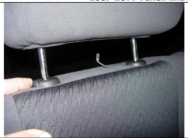
Step 1. Driver & Passenger Top/DT&PT:

Temporarily remove the headrests by gently lifting up while depressing the push button release, then insert a metal coat hanger sized metal wire into the hole in the other piece of plastic until it releases. All the parts of the seat cover are labeled inside. Use the seat cover piece identification chart to ID