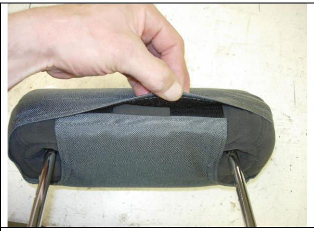
Step 2. Headrests/S:

Temporarily remove the headrests by gently lifting up while depressing the push button release, then insert a metal coat hanger sized metal wire into the hole in the other piece of plastic until it releases. All the parts of the seat cover are labeled inside. Use the seat cover piece identification chart to ID