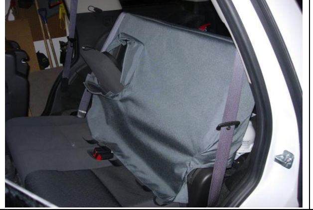
Step 9. Driver Top/DT: Very careful opening the inside edge of the seat cover. Place the cover on with the extending hook Velcro™ to the front. Fold the armrest out and tuck the seat cover around it.