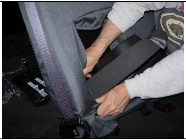
Step 12. Driver Top/DT: Tuck both side in and clear of the hinge area.