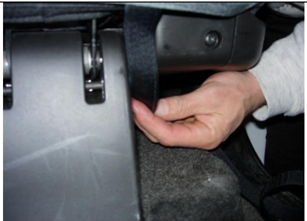
Step 6. Driver & passenger Bottoms/DB&PB: Route the front hook Velcro™ under the front of the seats.