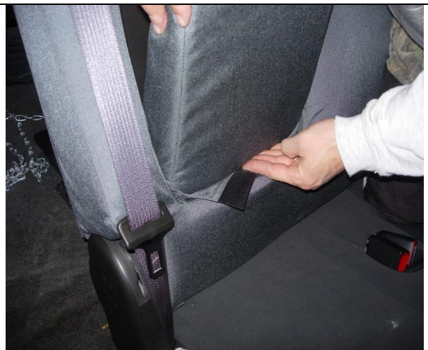
Step 22. Armrest-Console/A: Tuck the front edge in and fold the armrest down