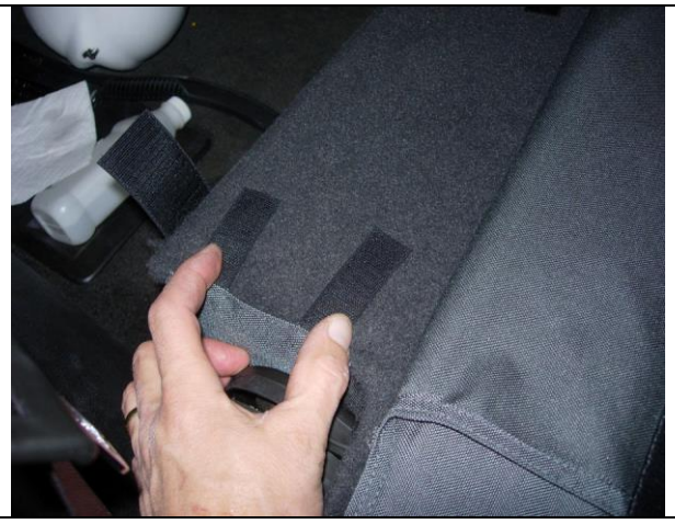
Step 17. Driver & Passenger Tops/DT&PT: Fold the seat flat and pull the left and right corners around to the back and press the hook Velcro™ to the carpet on the back edge of the seat.