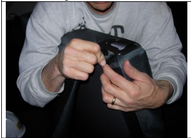
Step 15. Driver Top/DT: Tuck the fabric under the plastic for the seat belt, then connect the Velcro™ at the top.