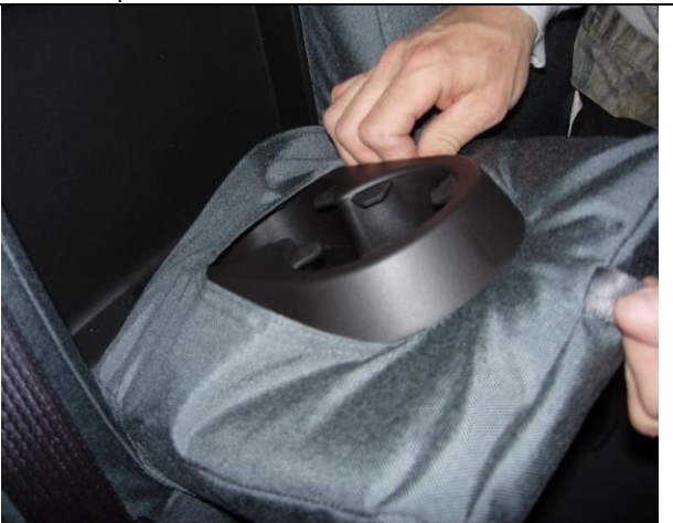
Step 20. Armrest-Console/A: Feed the factory armrest pull tab through the cover and tuck the front edge behind the plastic for the drink holders.