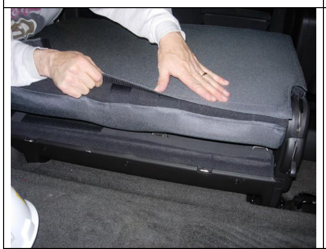
Step 19. Driver & Passenger Tops/DT&PT: Connect the hook Velcro™ on the back of the seat, starting on one side working to the other.