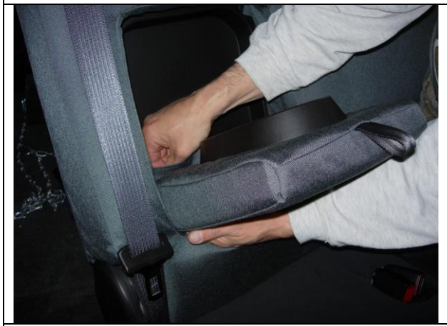
Step 23. Armrest-Console/A: Connect the Velcro™ at the back of the armrest.