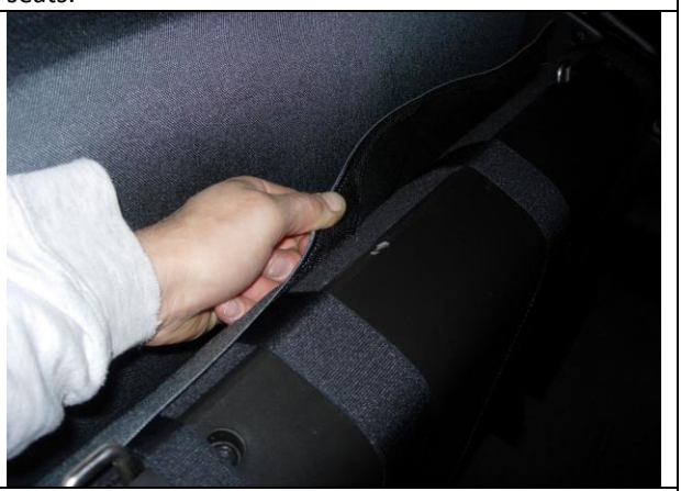
Step 8. Driver & passenger Bottoms/DB&PB: Pull the rear part of the seat cover back and connect it to the carpet on the back edge of the seat.