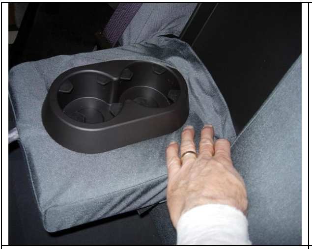
Step 21. Armrest-Console/A: Tuck the fabric under the back side one corner at a time.