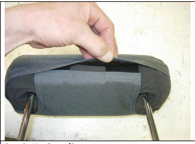
Step 2. Headrests/S:

Step 1. Driver & Passenger Top/DT&PT: Temporarily remove the headrests by gently lifting up Use the seat cover piece identification chart to ID