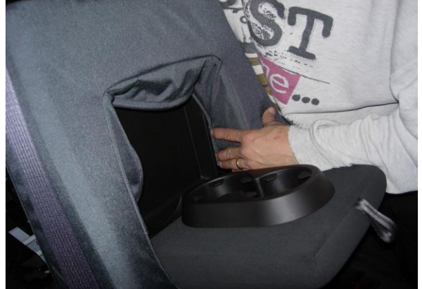
Step 10. Driver Top/DT: Line up the seams of the seat cover to the seams of the seat, they should closely match. Tuck the fabric behind the plastic on the left side.