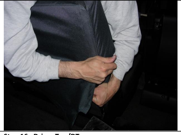
Step 16. Driver Top/DT: Continue working your way down using the "Bear Hug" method shown.