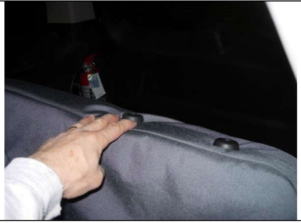
Step 14. Driver & Passenger Tops/DT&PT: Tuck the fabric under the plastic for the headrests.