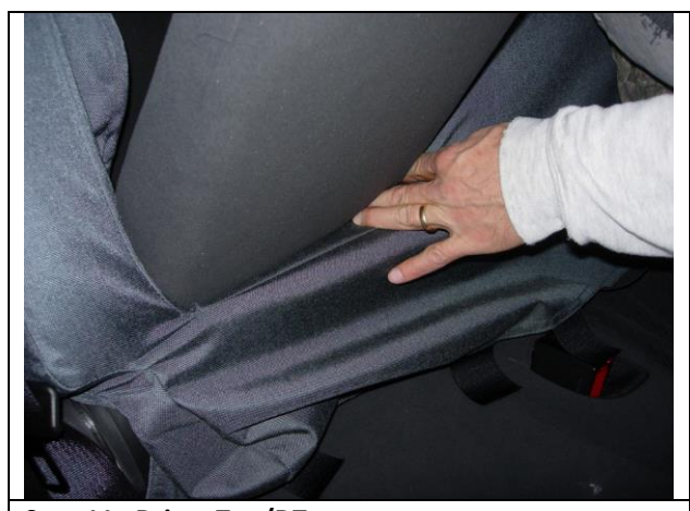
Step 11. Driver Top/DT: Next, tuck the seat cover under the armrest.