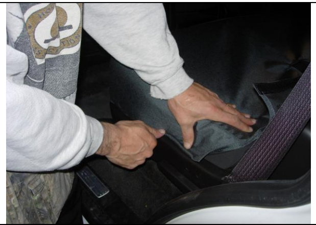
Step 5. Driver & passenger Bottoms/DB&PB: Tuck the outside edges of the seat cover behind the plastic cowling.