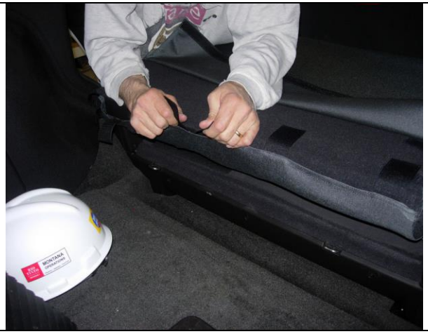
Step 18. Driver & Passenger Tops/DT&PT: Slide one hand down the front of the seat in a smoothing action from top to bottom while gently pulling on the Velcro™ from the back, then press them to the carpet on the seat back.