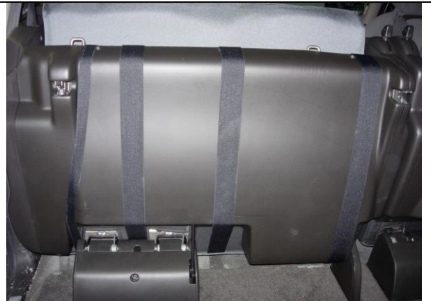
Step 7. Driver & passenger Bottoms/DB&PB: Connect them to the carpet on the back edge of the seat.