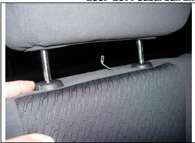
Step 1. Driver & Passenger Top/DT&PT:

Temporarily remove the headrests by gently lifting up while depressing the push button release, then insert a metal coat hanger sized metal wire into the hole in the other piece of plastic until it releases. All the parts of the seat cover are labeled inside.