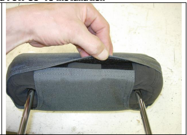
Step 2. Headrests/S:

Use the seat cover piece identification chart to ID