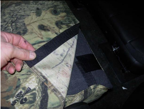
Step 7. Driver & Passenger Top/DT&PT: Press the back edge Velcro™ onto the carpet on the seat back.