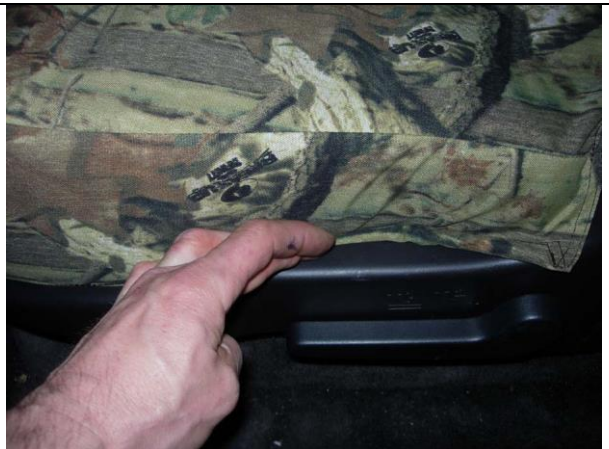
Step 10. Driver & Passenger Bottom/DB&PB: Tuck the left and right edges of the seat cover under the plastic. Line up the seams of the seat covers same as Steps 1, 4, and 9.