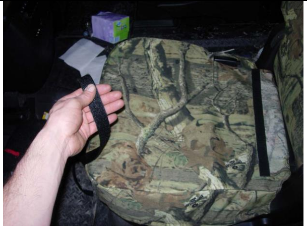
Step 8. Driver & Passenger Bottom/DB&PB: Place the seat covers on with the long Velcro™ to the front.