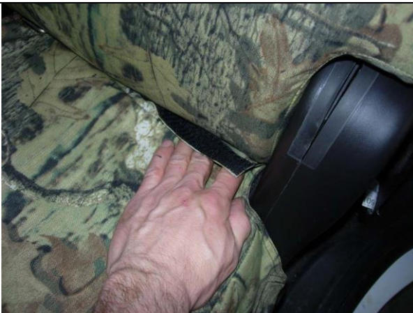
Step 9. Driver & Passenger Bottom/DB&PB: Tuck in the back edge of the cover, and line up the seams of the seat cover to the seams of the seat as Steps 1 & 4.