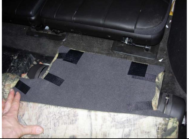
Step 6. Driver & Passenger Top/DT&PT: Continue fastening all the hook Velcro™ to the carpet as shown.