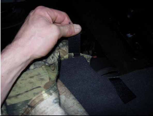
Step 5. Driver & Passenger Top/DT&PT: Slide the Velcro™ under the armrest and press it onto the seat back.