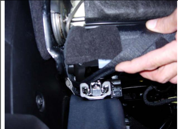
Step 13. Driver & Passenger Bottoms/DB&PB: Route the far back side Velcro<sup>™</sup> where shown, above the seat slide in back.