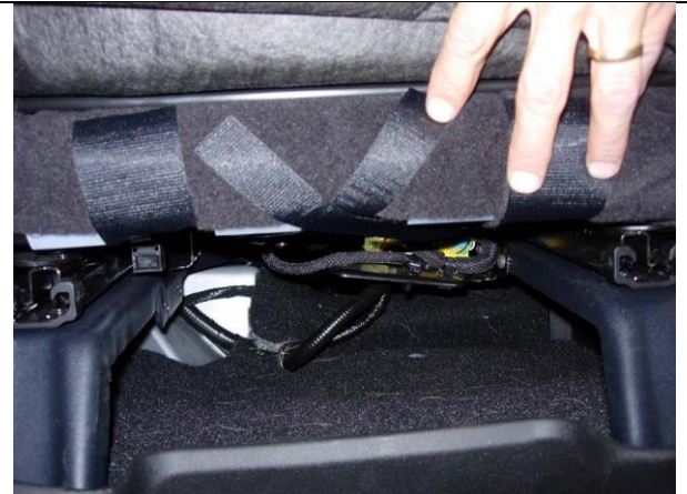
Step 14. Driver & Passenger Bottoms/DB&PB: The side Velcro<sup>™</sup> should be fastened in an "X" pattern.