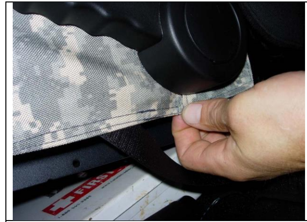
Step 11. Driver Bottom/DB: Connect the Velcro<sup>™</sup> under the side lever.