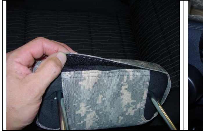
Step 3. Headrest/H: Line up the seams of the headrest cover to the seams of the headrest, they should closely match. Tuck the front Velcro<sup>™</sup> under the back edge and connect it as shown.