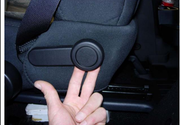
Step 4. Driver & Passenger Top/DT&PT: Temporarily remove the keep pin from the backside of the recline handle by pushing up with both fingers alongside the shaft. Use your other hand over the top of the handle to keep the pin from flying away on you.