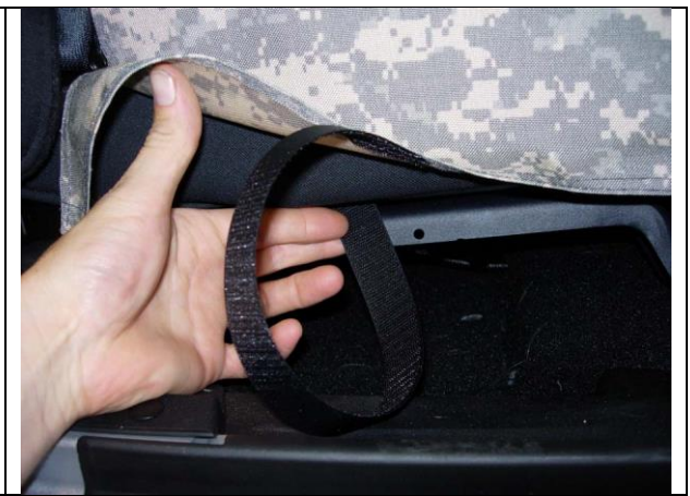
Step 12. Driver & Passenger Bottoms/DB&PB: Route the side hook Velcro<sup>™</sup> over the seat slides.