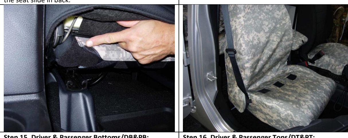
Step 15. Driver & Passenger Bottoms/DB&PB:Step 16. Driver & Passenger Tops/DT&PT:Pull the back edge of the cover back hard and connectSlide the cover on with the extending hook Velcro™ toit to the carpet on the back edge of the seat.the front.