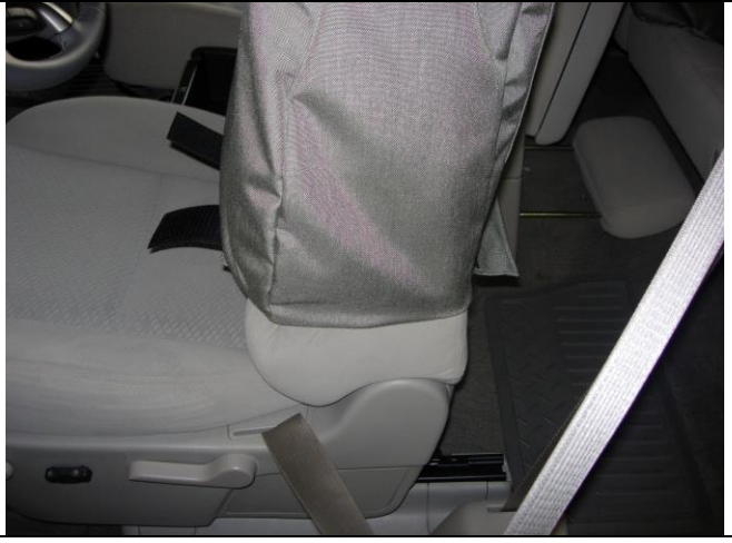
Step 2. Driver and Passenger Tops/DT&PT: Slide the seat covers on with the extending hook (sticky) Velcro™ to the front. Notice how the seat compresses at its widest point. It will relax back out once it is pulled all the way down, and don't worry, you won't tear the seat cover apart pulling it down.

Recline the backrests slightly and temporarily remove the headrests. Do this by wedging one hand between the seat and the headrest holding gentle upward pressure and depress the push button release. Keep holding upward pressure and insert a heavy weight paper clip into the hole in other plastic piece with your other hand until the headrest releases.