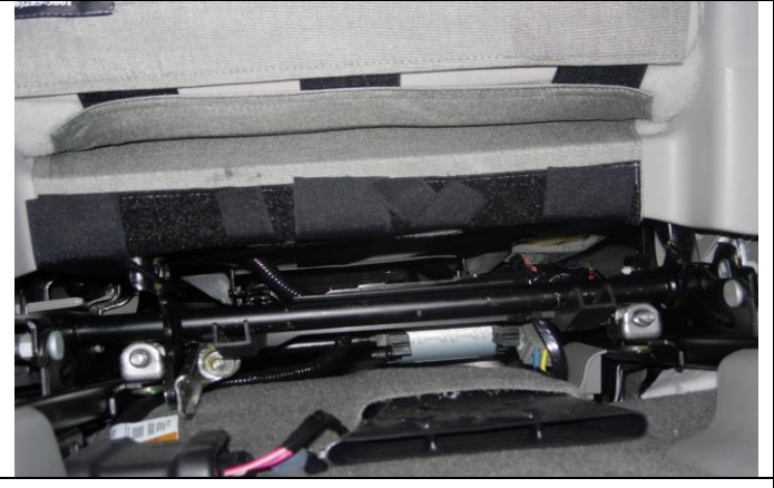
Step 11. Driver and Passenger Bottoms/DB&PB: If you have electric seats be sure to lift the seat up as high as it will go. This will pull everything away from your seat and free up some space. Route the three long hook Velcro™ in front under the seat and connect them to the loop Velcro™ sewn on the back edge. Avoid any seat mechanisms by keeping the Velcro™ up and close to the seat bottom away from the metal framework.