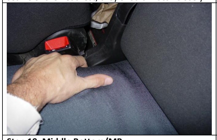
Step 19. Middle Bottom/MB:

Fold the cover inside out on the sides to keep the Velcro™ from attaching prematurely to the carpet. Once pulled into down position to the bottom of the seat, line up the cover and press the front hook Velcro™ to the carpet on the left and right sides.