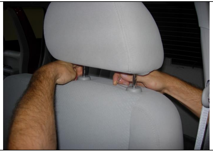
Step 1. Driver and Passenger Tops/DT&PT: All the parts of the seat cover are labeled inside. Use the "Seat Cover Piece Identification chart" to ID pieces.

2007-14 Avalanche 40/20/40 with Non-Opening Consoles Installation