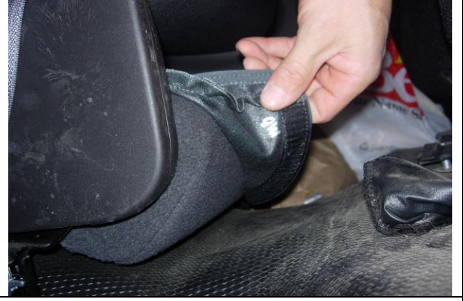
Step 20. Middle Bottom/MB:

Smooth the side of the seat cover from front to back. Once in position, tuck the left and right rear sides in and mate the hook Velcro™ sewn inside the cover to the carpet on the seat.