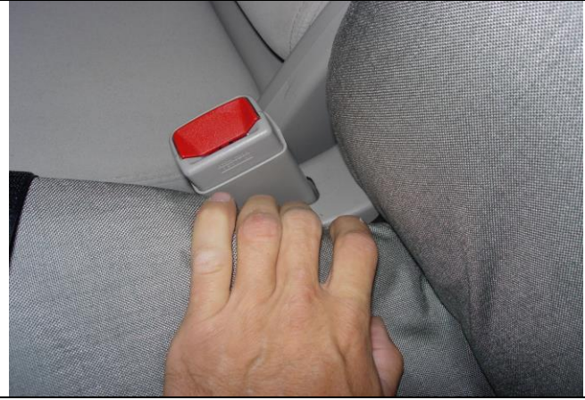
Step 10. Driver and Passenger Bottoms/DB&PB: Tuck the seat cover in behind the plastic on the inside back edge. Pull on the back edge of the seat cover.