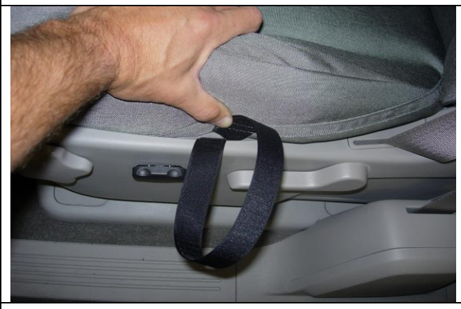
Step 12. Driver and Passenger Bottoms/DB&PB: Feed the long outside edge Velcro™ between the seat and the plastic where shown. Carefully feel under the seat for the Velcro™ the gap between the seat slide and the seat frame. Pull it tight and connect it to the rear loop Velcro™ at an angle. The seat slides have grease on them so clean your hands after doing this part.