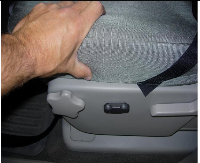
Step 8. Driver and Passenger Bottoms/DB&PB: Tuck the seat cover behind the plastic cowling on the outside edge.