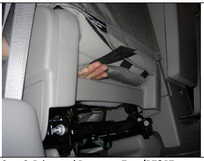
Step 6. Driver and Passenger Tops/DT&PT: Tuck the hook Velcro™ into the seat and connect them to the loop (fuzzy) Velcro™ sewn inside the back edge. Do it by sliding one hand down the front of the seat cover and push the Velcro™ through as shown. Pull on the Velcro™ from behind the seat with one hand and use the other hand in a smoothing action from top to bottom. Be careful to not over-tighten the Velcro™ indenting the foam on the backrest.