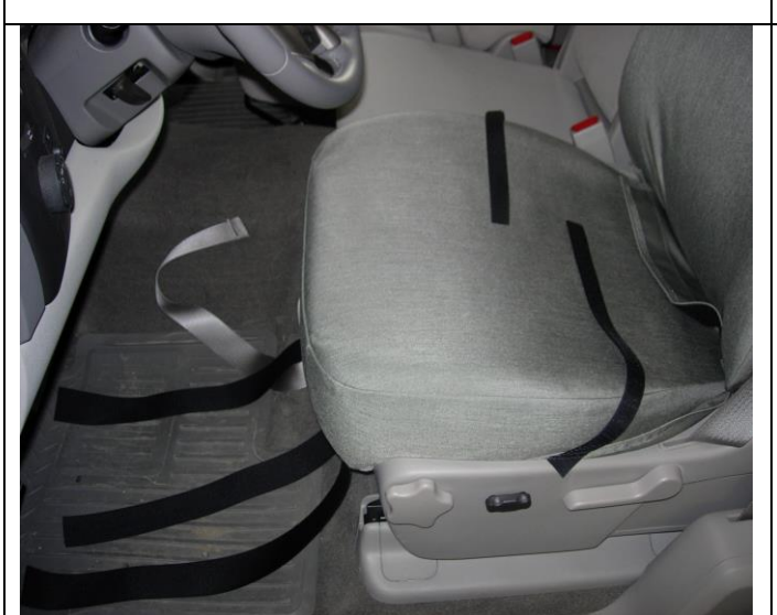
Step 7. Driver and Passenger Bottoms/DB&PB: Place the seat covers on with the long hook Velcro™ to the front. As in Step 5 align the seams of the seat cover to the seams of the seat, they should match closely.