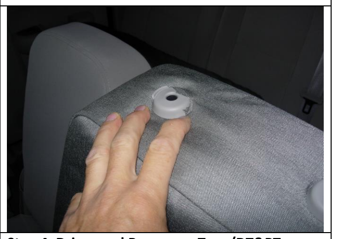
Step 4. Driver and Passenger Tops/DT&PT: Tuck the fabric of the seat cover under the plastic for the headrests starting with the push button side first as shown.