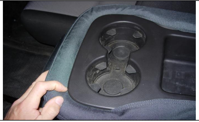
Step 21. Armrest/A:

Slide the cover on with the large opening on top. Start by tucking the fabric under the plastic in front.