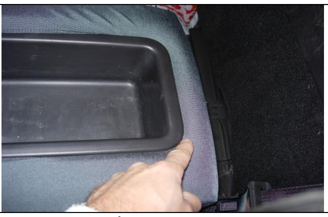
Step 22. Armrest/A:

Tuck the hook Velcro™ in, fold the armrest down, and connect the Velcro™ in back.