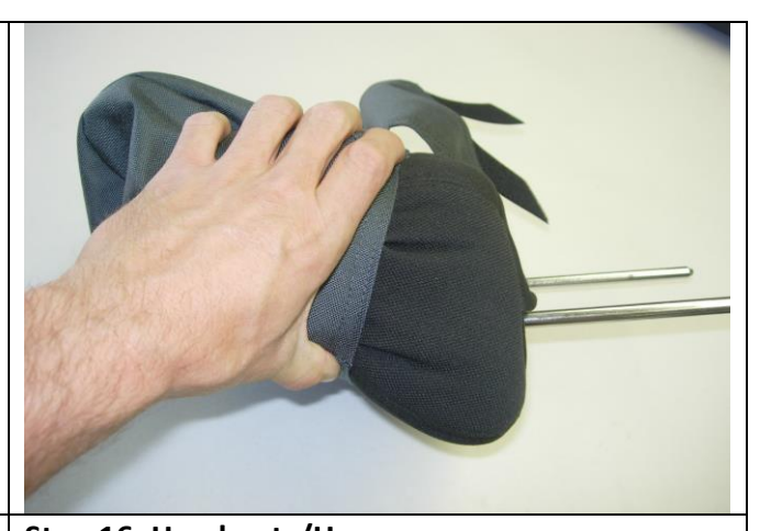
Step 16. Headrests/H: Slide the cover onto the seat again, then slide the cover on with the extending hook Velcro™ to the front. Note the compression of the headrest to get the cover on. The headrest foam will relax once the cover is pulled all the way down into position.