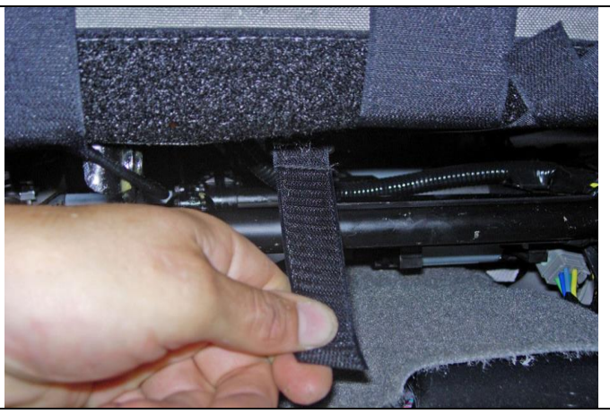
Step 15. Driver and Passenger Bottoms/DB&PB: Connect the plastic hooks under the back of the seat to the metal bar that supports the foam (about 2" in). Then, press the hook Velcro™ to the rear loop Velcro™. This will keep the seat cover from sliding forward, right, or left.