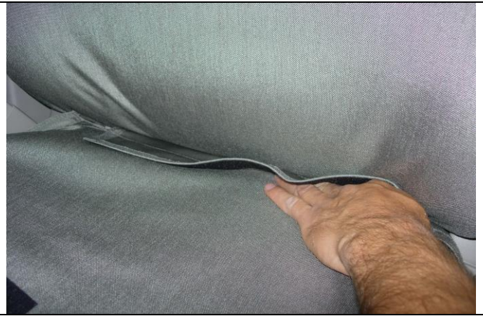
Step 9. Driver and Passenger Bottoms/DB&PB: Tuck the back edge of the seat cover into the seat. Pull it into position from behind the seat.