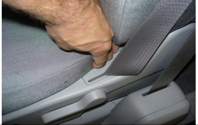
Step 13. Driver and Passenger Bottoms/DB&PB: Tuck the seat cover behind the plastic on the outside edge.