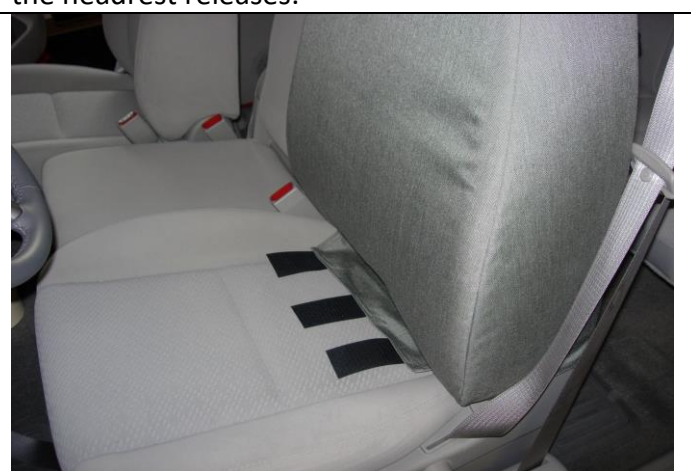
Step 3. Driver and Passenger Tops/DT&PT: As you can see the seat relaxes once the seat cover is pulled into position.