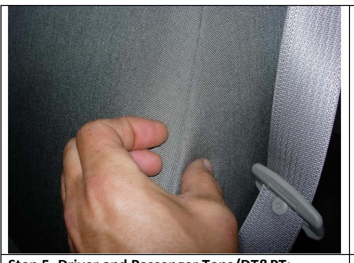
Step 5. Driver and Passenger Tops/DT&PT: Align the seams of the seat cover to the seams of the seat, they should match closely. Work the material from the seam inside the cover from the main body of the seat cover (fingers) to the middle (thumb). Do this for the front and back of the seat