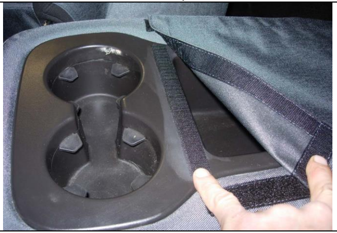
Step 24. Lid/L:

Tuck the fabric behind the plastic in back. This is a tight fit so you will have to pull hard and do one corner at a time. Lastly, tuck the sides in.